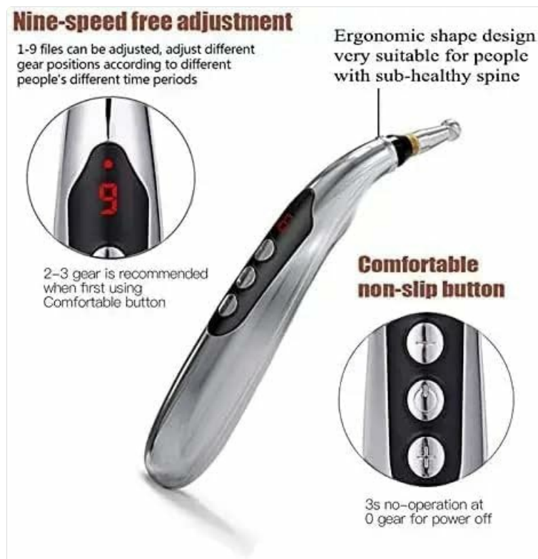
Image 4.2: Close-up of the pen demonstrating the nine-speed adjustment display and comfortable non-slip control buttons.