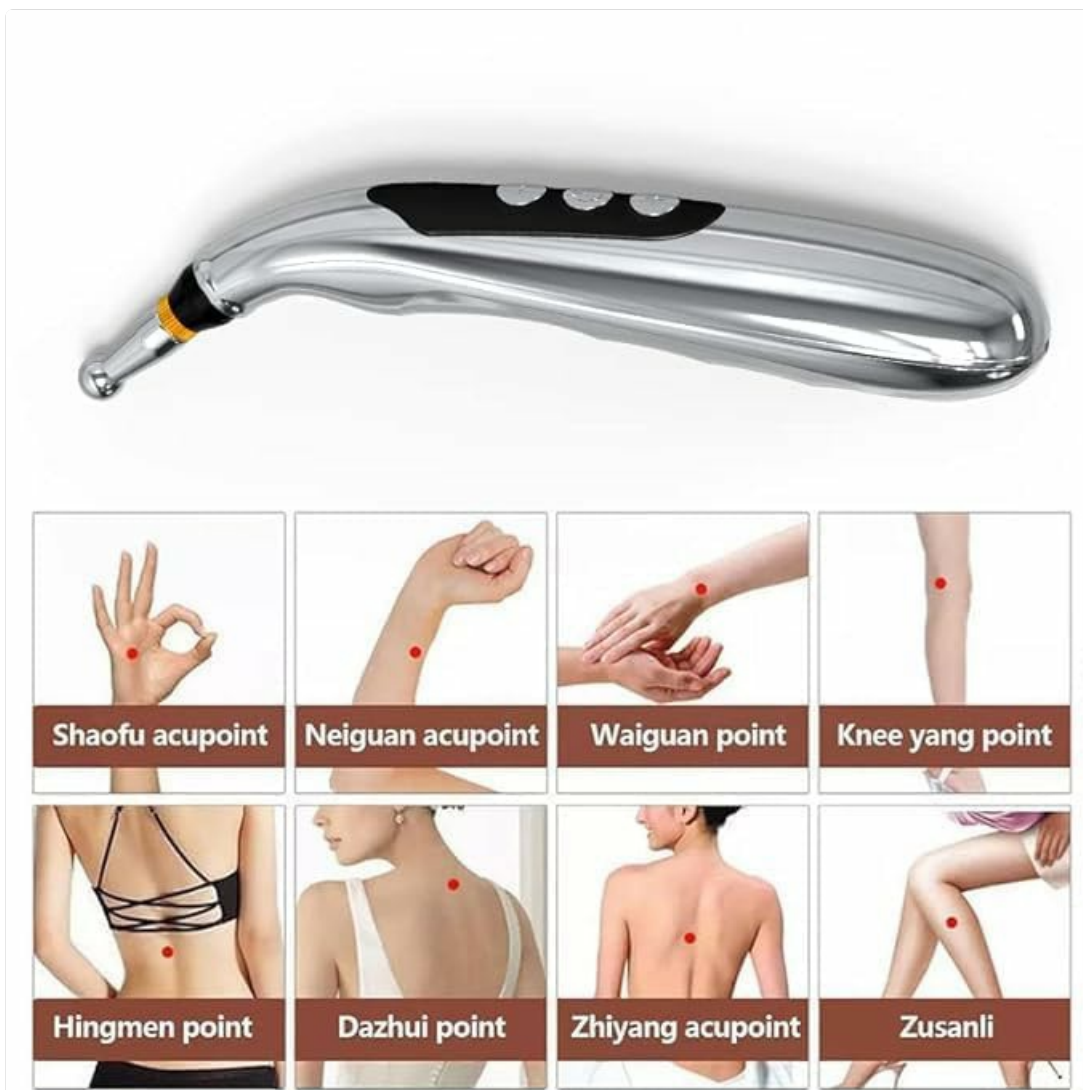
Image 6.2: Examples of specific acupoints that can be targeted with the device.