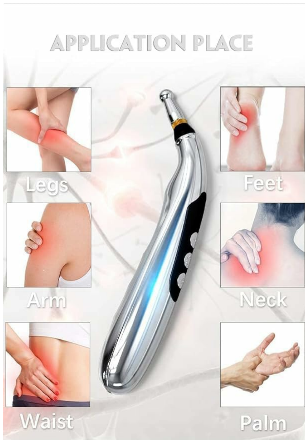
Image 6.1: Common application areas for the Meridian Energy Massage Pen.

The massage pen can be used on various parts of the body to stimulate meridian points and relieve discomfort. Ensure direct contact with the skin for optimal effect.