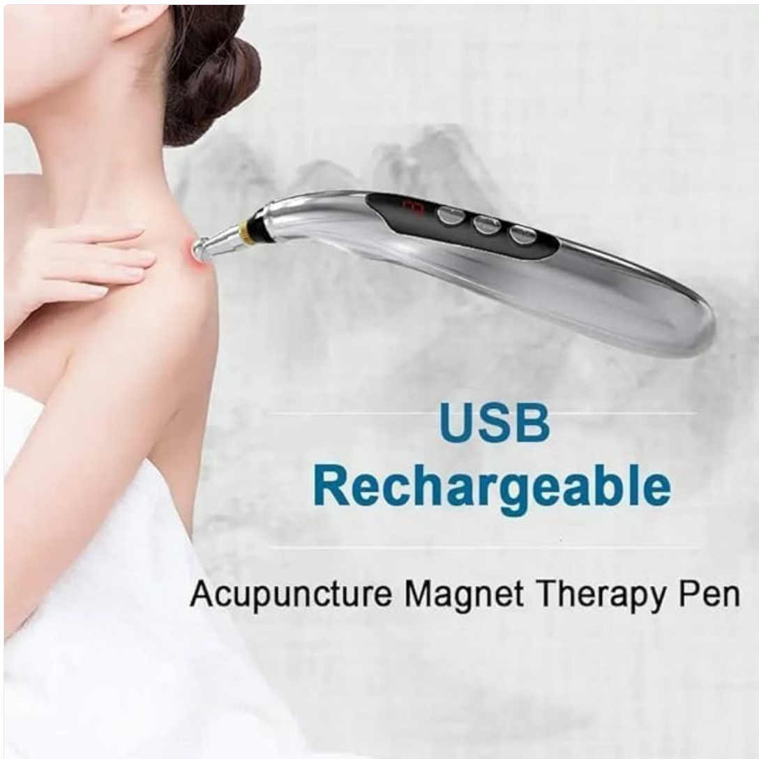
Image 4.1: The device is USB rechargeable, highlighting its convenience.