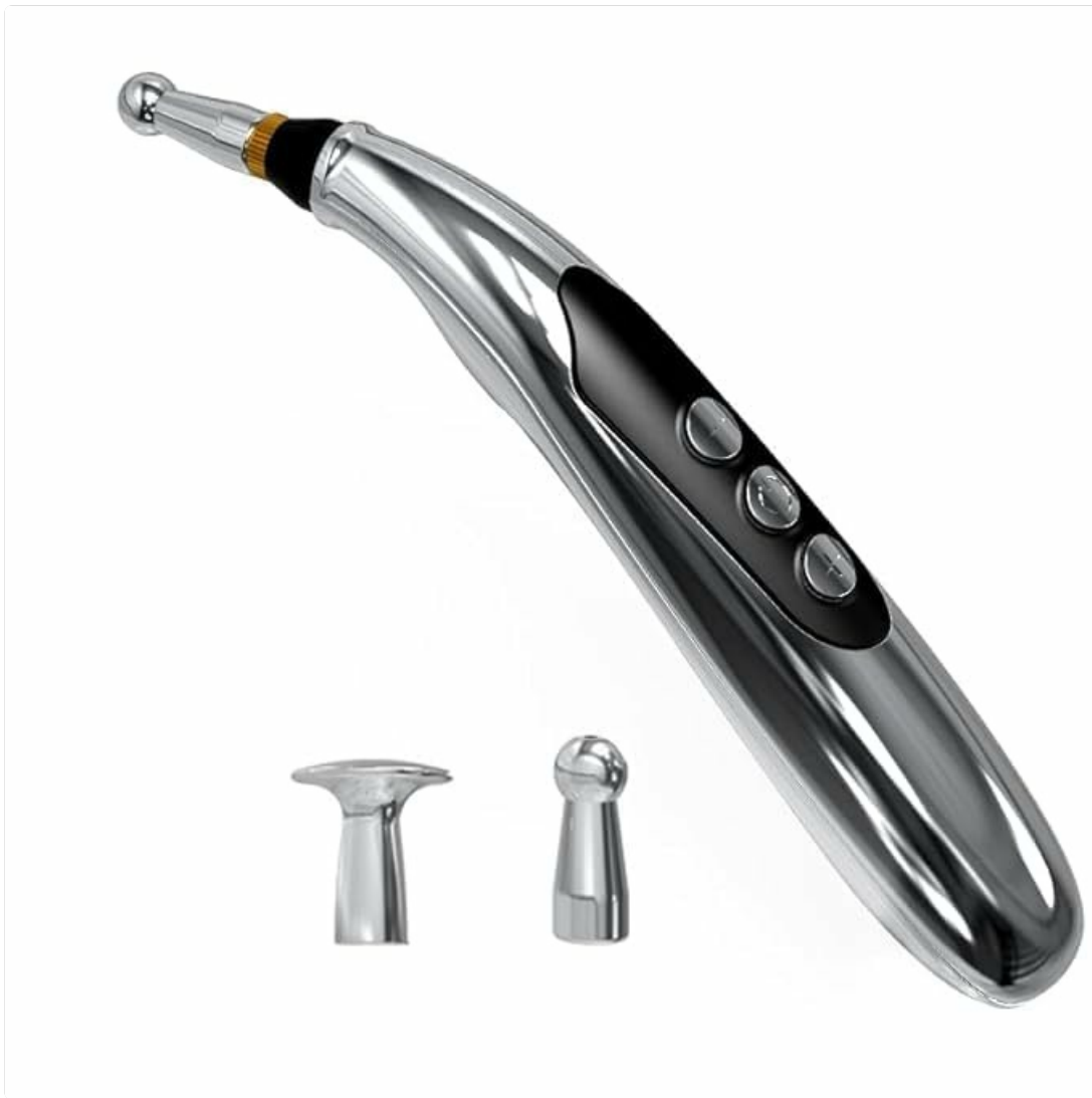
Image 1.1: The W-912r Meridian Energy Massage Pen, showcasing its sleek design and interchangeable massage heads.