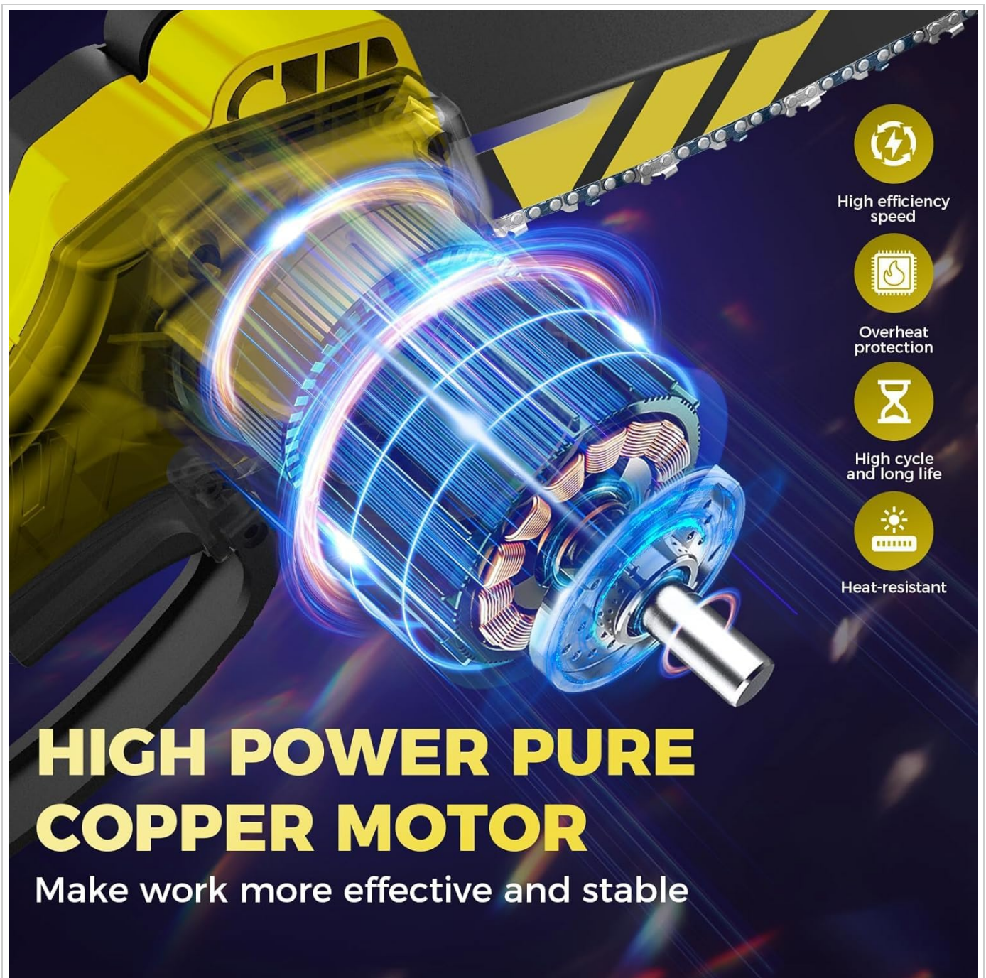
Image: An internal view of the chainsaw's motor, emphasizing its pure copper construction and features like high efficiency, overheat protection, and durability.