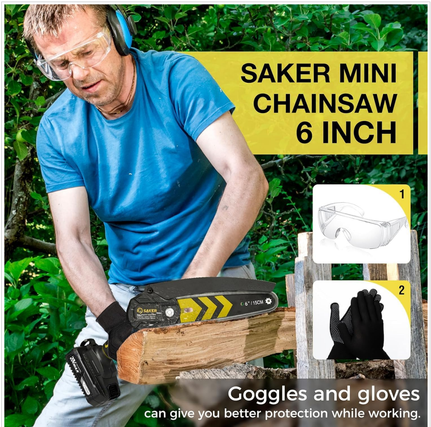
Image: A collage of images depicting the versatility of the Saker Mini Chainsaw for pruning, general wood cutting, and home DIY projects.