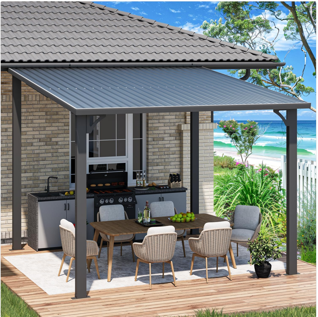
Image: A visual comparison highlighting the upgraded galvanized hardtop, emphasizing its robustness and better sun coverage compared to a pre-upgrade polycarbonate model.