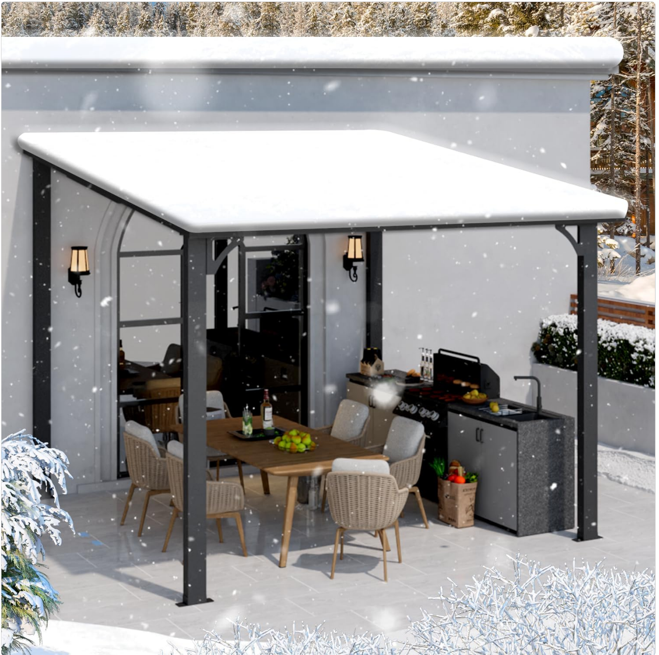
Image: The AECOJOY gazebo shown with a layer of snow on its roof, illustrating its capability to handle heavy snow conditions.