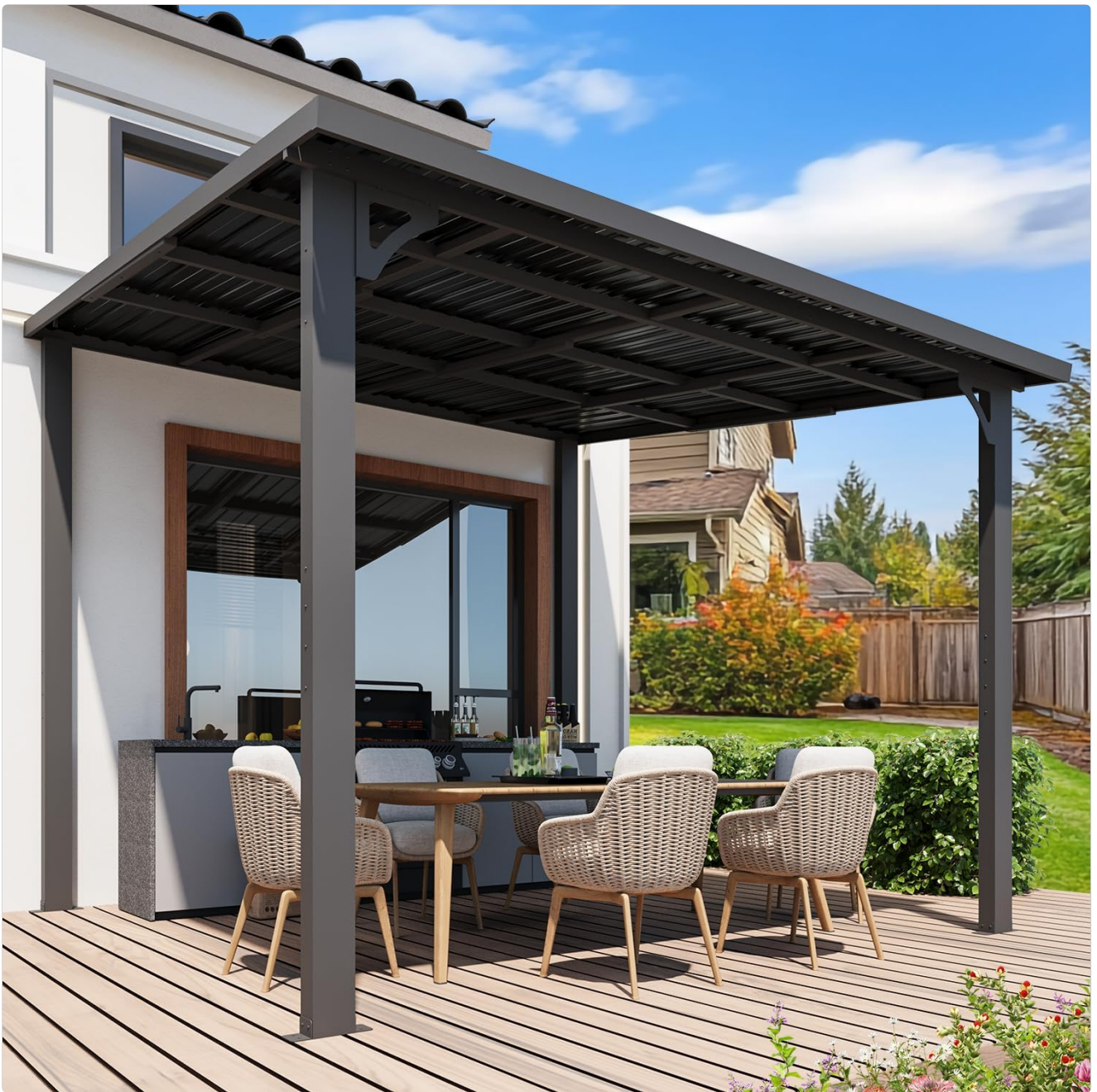
Image: The main product image of the AECOJOY 10' x 10' Hardtop Wall-Mounted Gazebo, showcasing its overall design and structure.