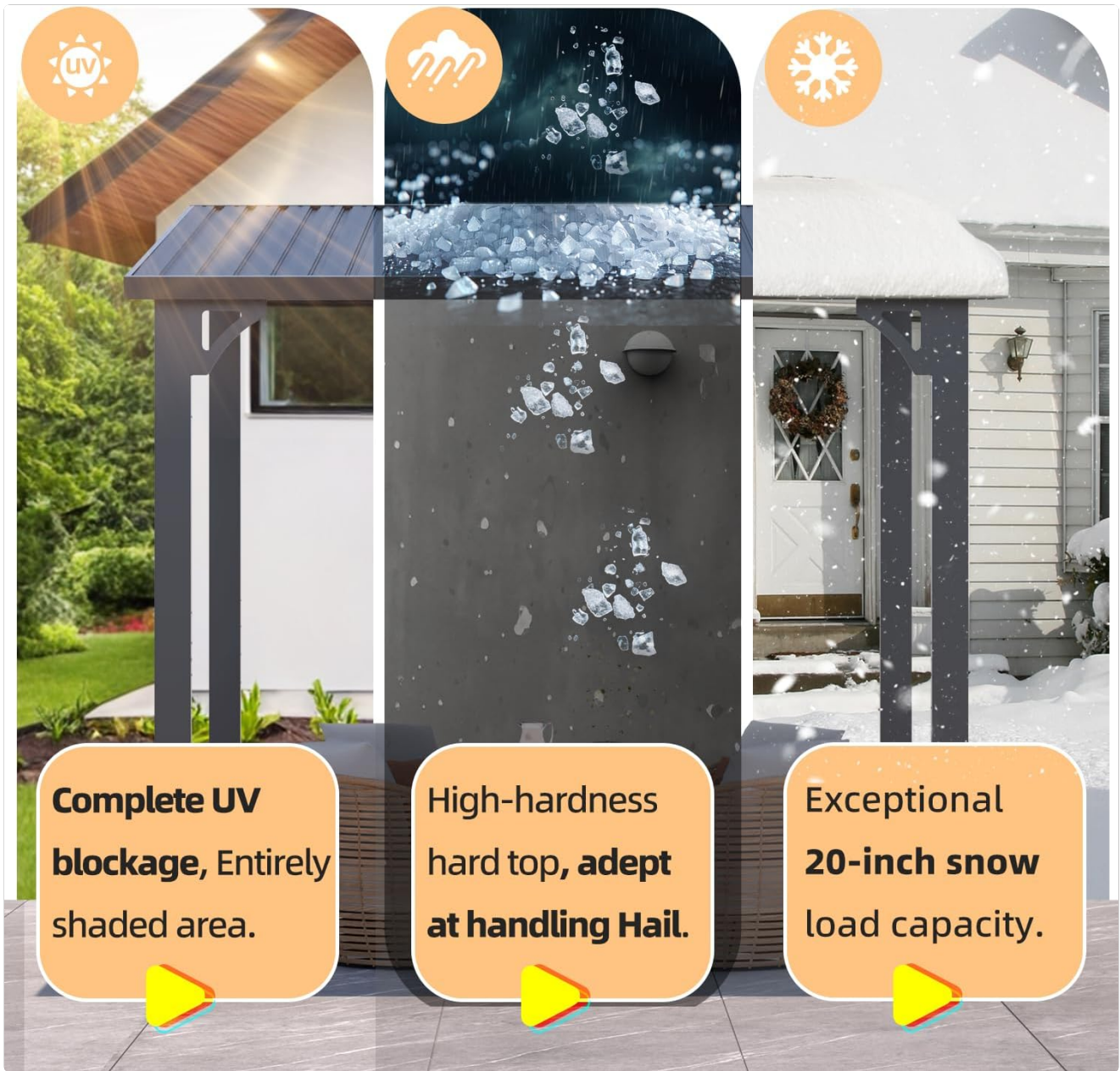
Image: Infographic detailing the gazebo's weather-resistant features, including complete UV blockage, high-hardness hardtop adept at handling hail, and an exceptional 20-inch snow load capacity.