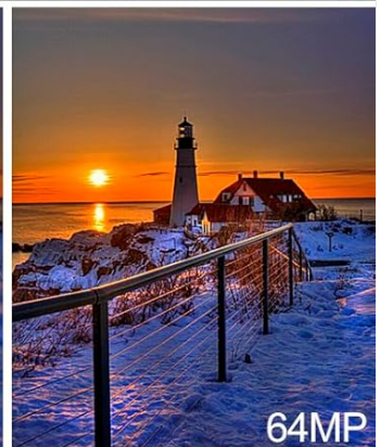
Image: Examples of various zoom levels and megapixel outputs from the camera.