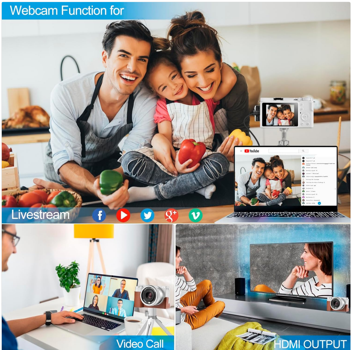
Image: The camera's versatility as a webcam for various online activities and HDMI output.