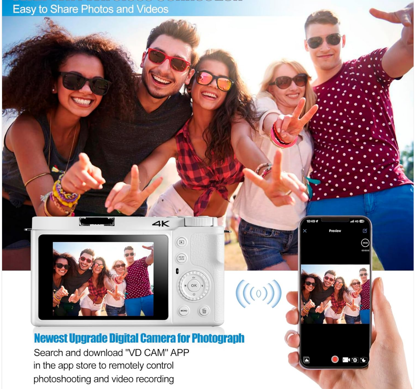
Image: Easy sharing and remote control via Wi-Fi wireless connection and the VD CAM app.