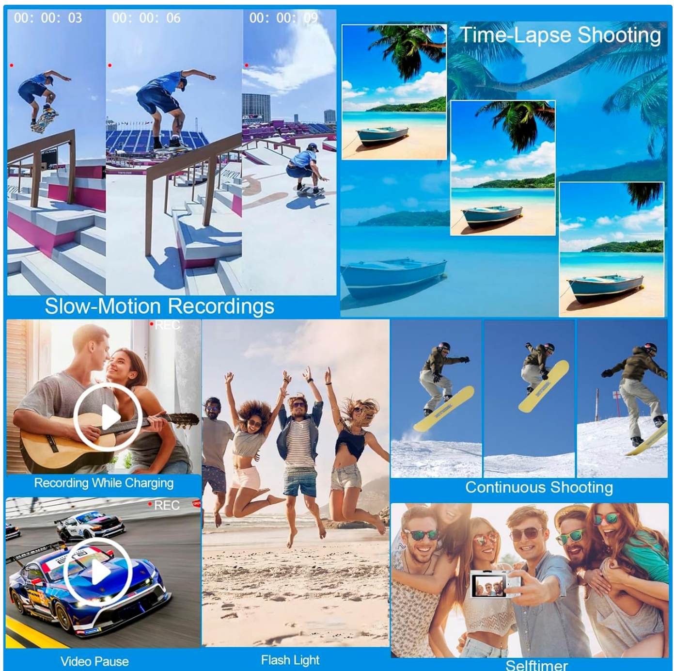
Image: Visual examples of advanced shooting modes like time-lapse, slow-motion, and continuous shooting.