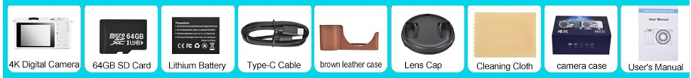
Image: All items included in the OIEXI 4K Digital Camera package.