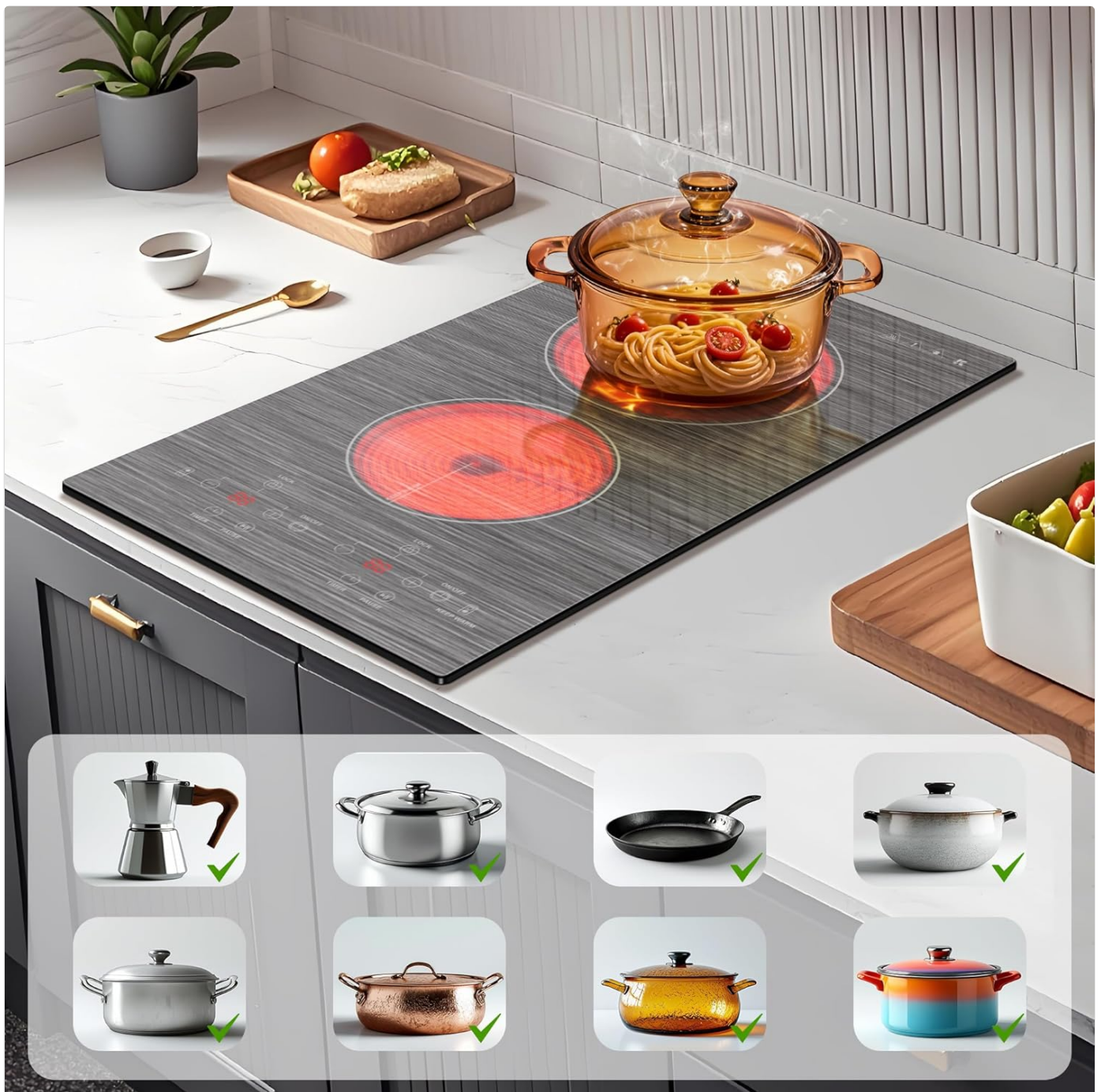
Image: The Karinear Electric Cooktop with various types of cookware, indicating compatibility with different materials such as stainless steel, cast iron, and ceramic, all with flat bottoms.