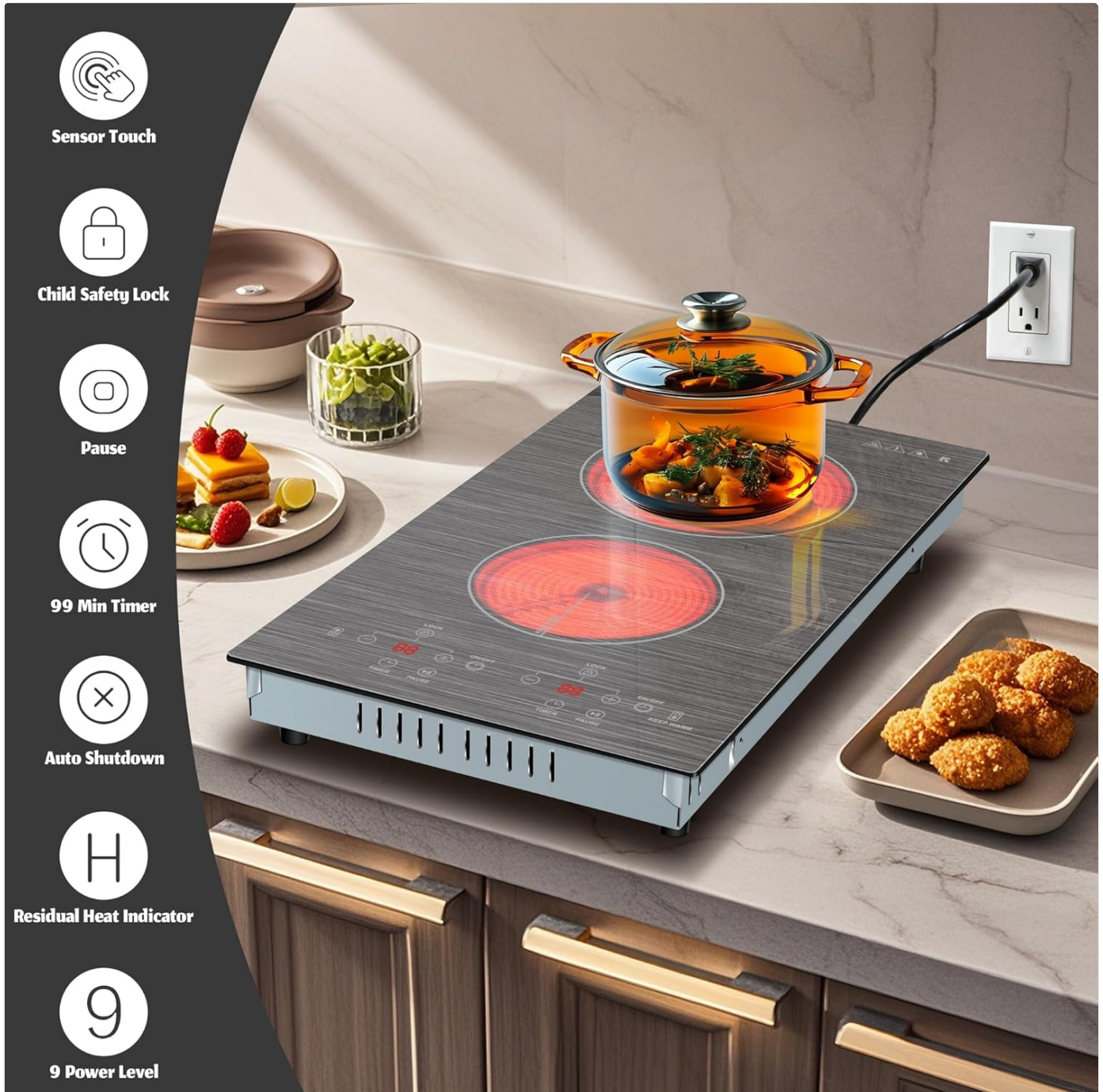
Image: Close-up of the Karinear Electric Cooktop highlighting its safety features and touch controls, including Sensor Touch, Child Safety Lock, Pause, 99 Min Timer, Auto Shutdown, Residual Heat Indicator, and 9 Power Levels.