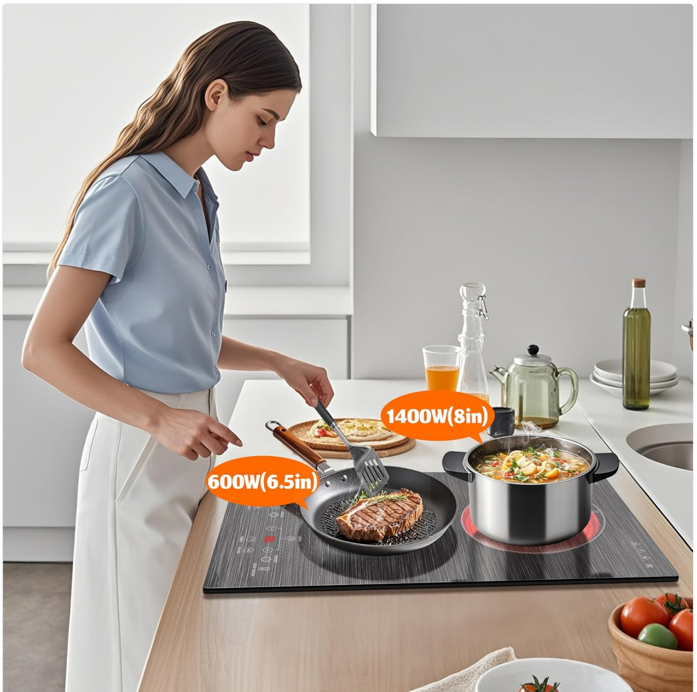
Image: A woman cooking on the Karinear Electric Cooktop, illustrating the two burners with their respective wattages and sizes: 1400W (8 inches) and 600W (6.5 inches).