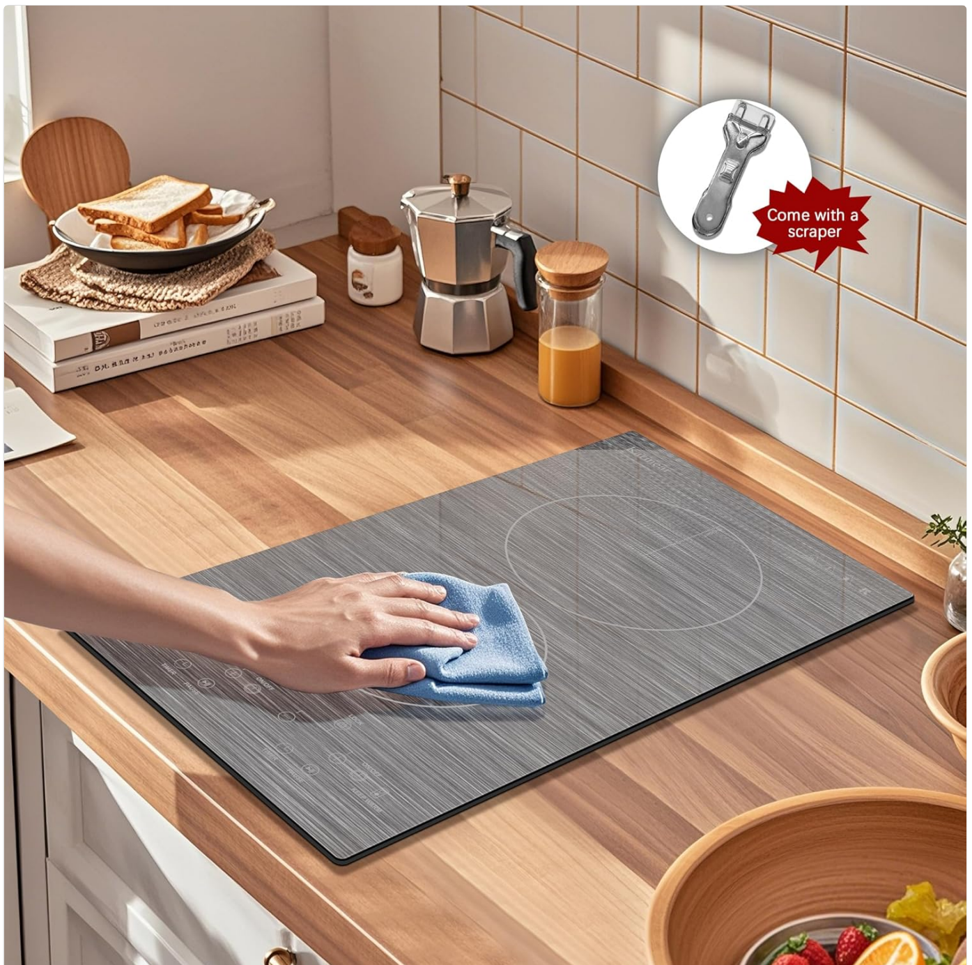
Image: A hand cleaning the smooth glass surface of the Karinear Electric Cooktop with a damp cloth, with a cleaning scraper shown in the background, emphasizing ease of cleaning.