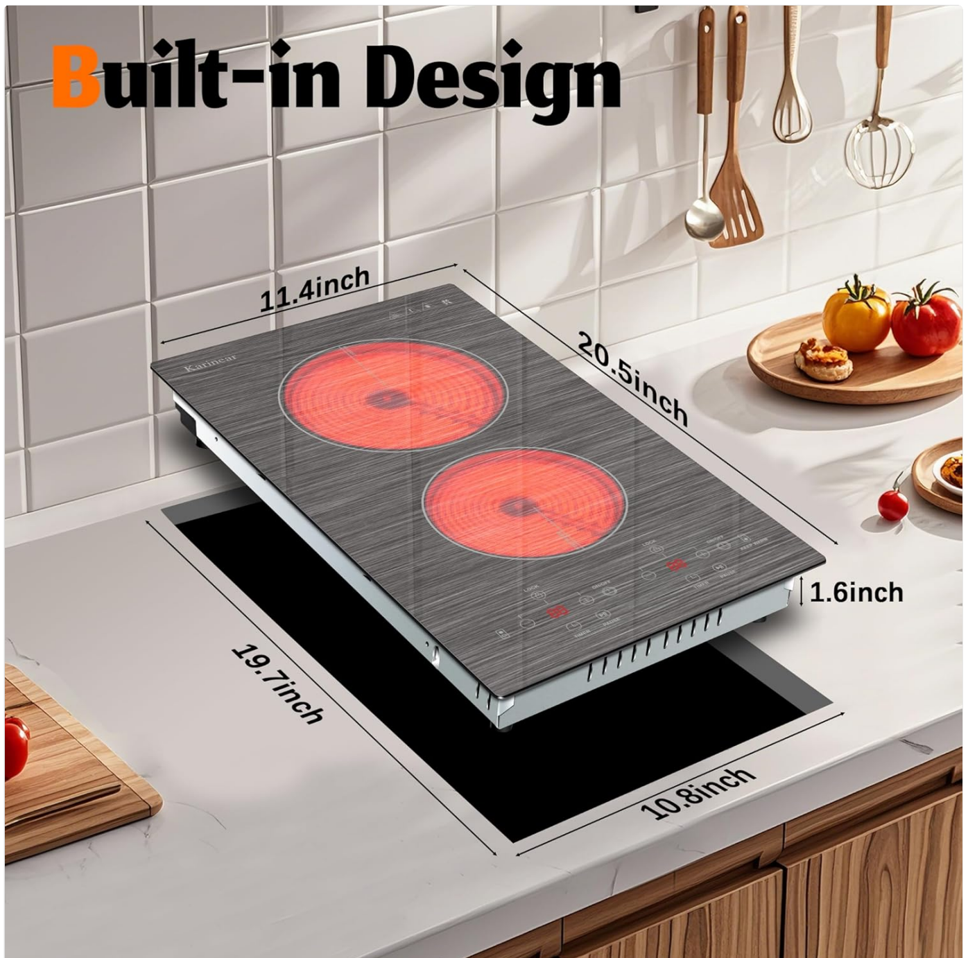
Image: Detailed diagram showing the dimensions of the Karinear Electric Cooktop and the required cutout size for built-in installation, including stovetop size (20.5 x 11.4 inches) and cut hole size (19.7 x 10.8 inches, with a depth of 1.6 inches).