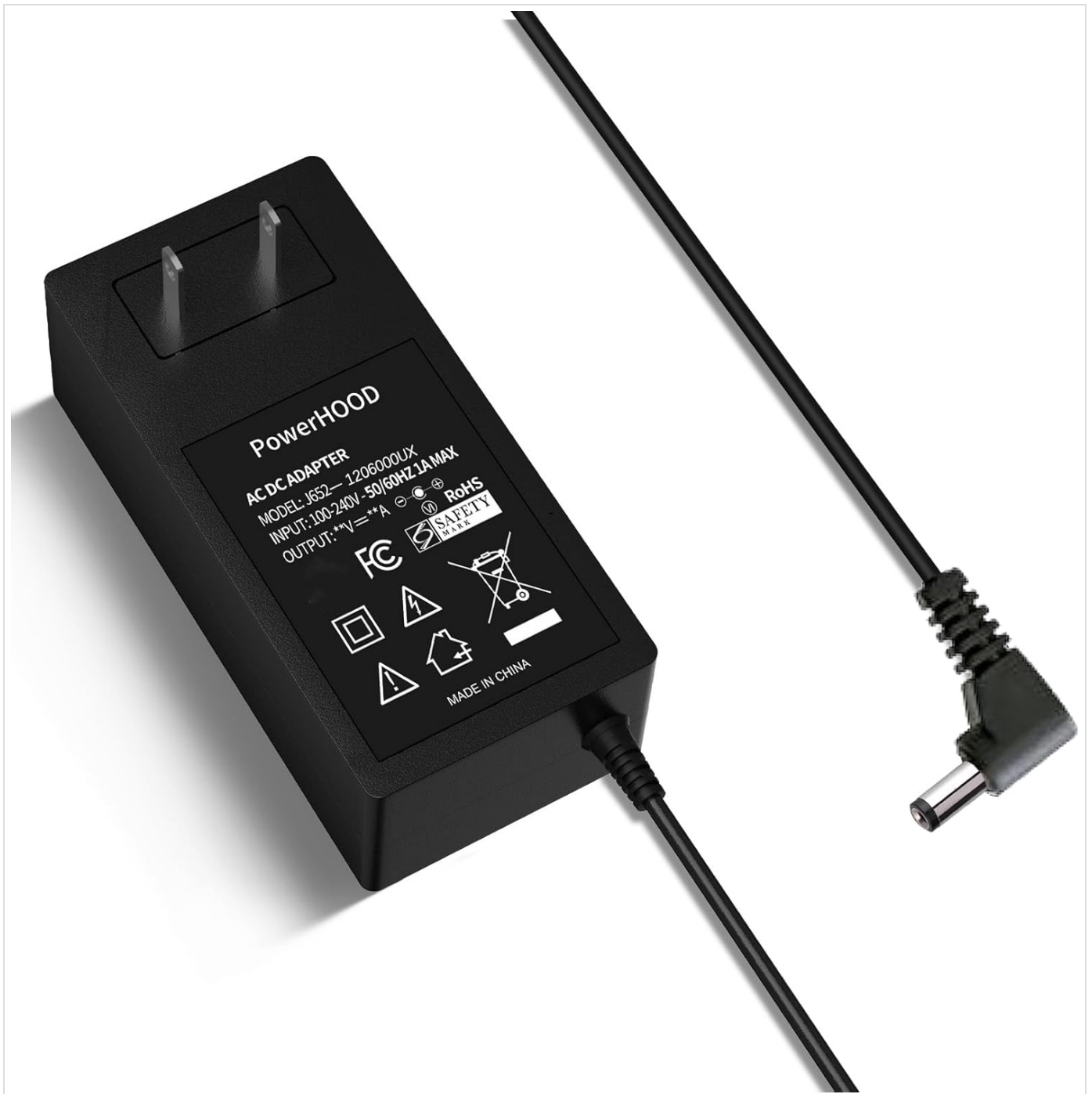
The PowerHOOD 24V AC/DC Adapter, featuring its main unit and the DC output cable with a barrel tip connector.