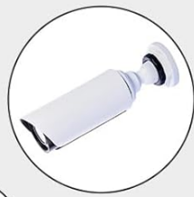
CCTV IP Camera