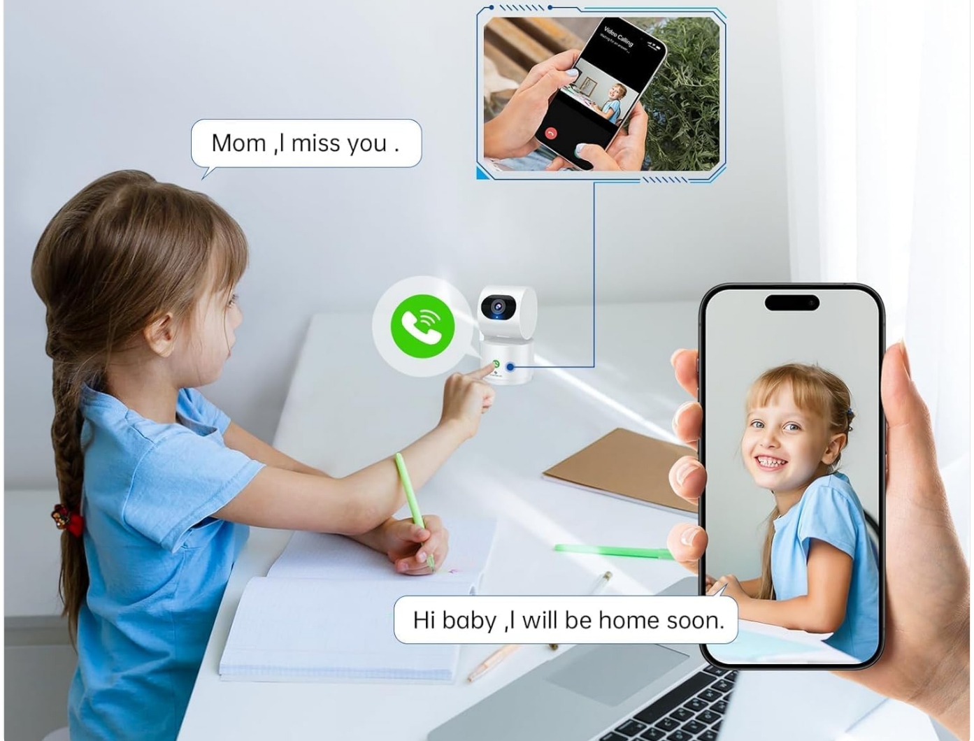
Figure 4: Demonstrating the One-Touch Call feature for rapid communication.

Enjoy real-time talk with your loved ones anytime & anywhere