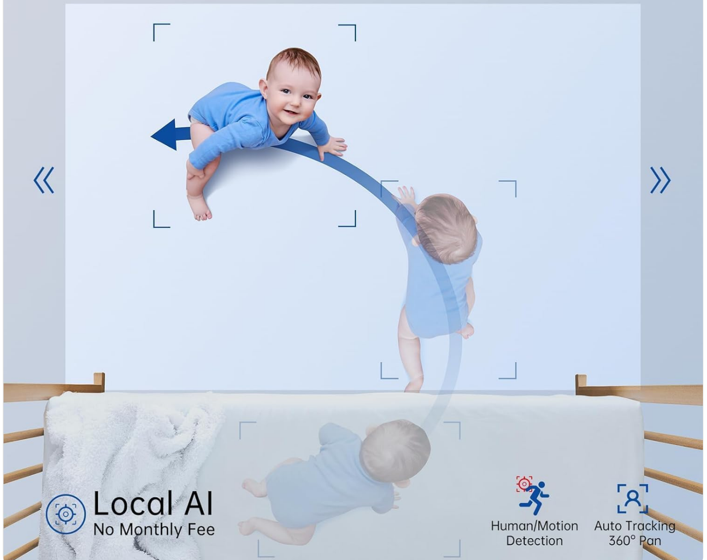
Figure 5: Automatic motion tracking and AI human detection.

Auto Locking and Tracking, Focus on What Matters