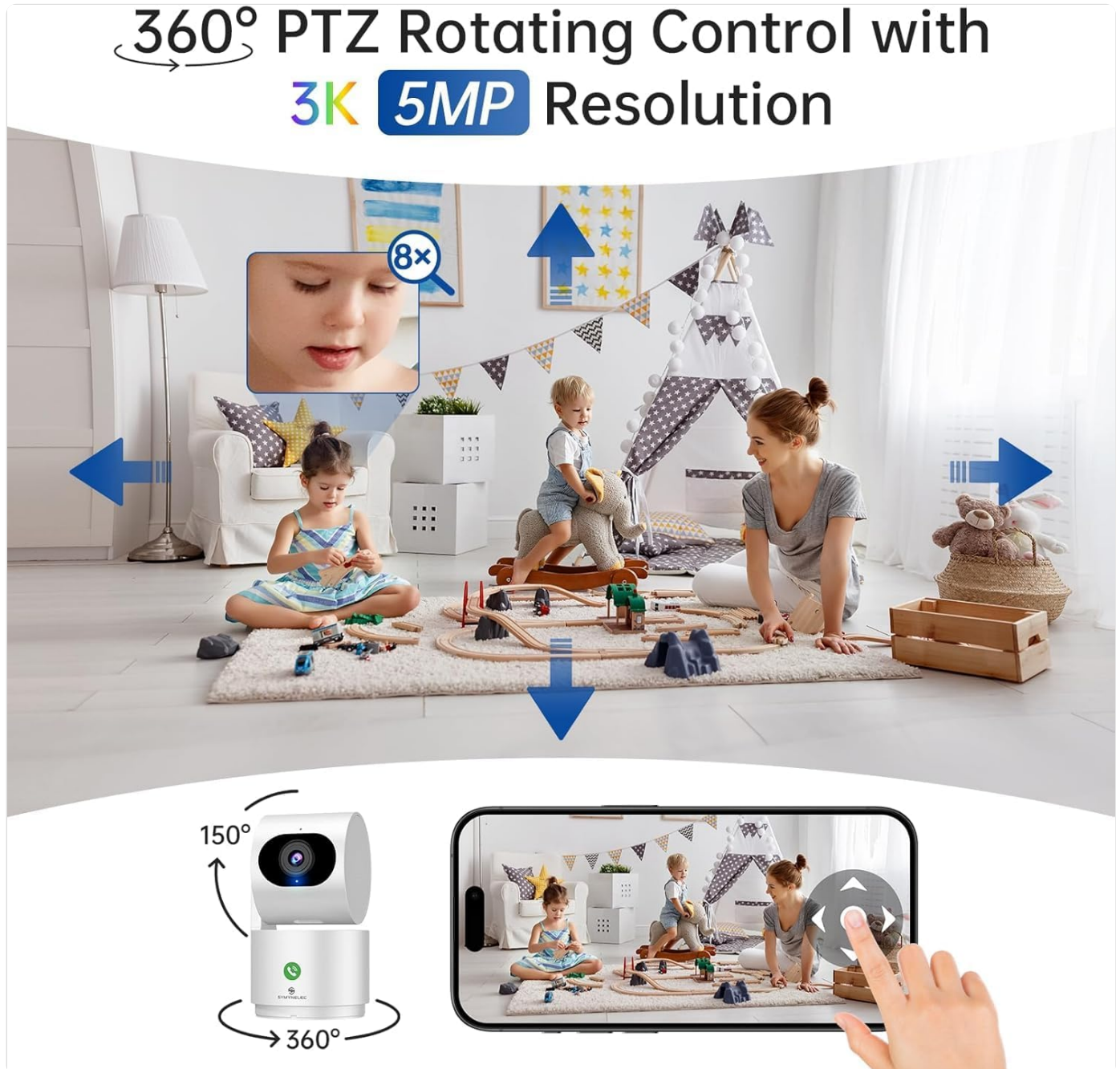
Figure 3: Remote Pan and Tilt control via the SYMYNELEC app.

The camera features 360° horizontal pan and 150° vertical tilt capabilities. Use the directional controls within the app's live view to remotely adjust the camera's angle. You can also set up to 6 preset viewing angles for quick navigation.