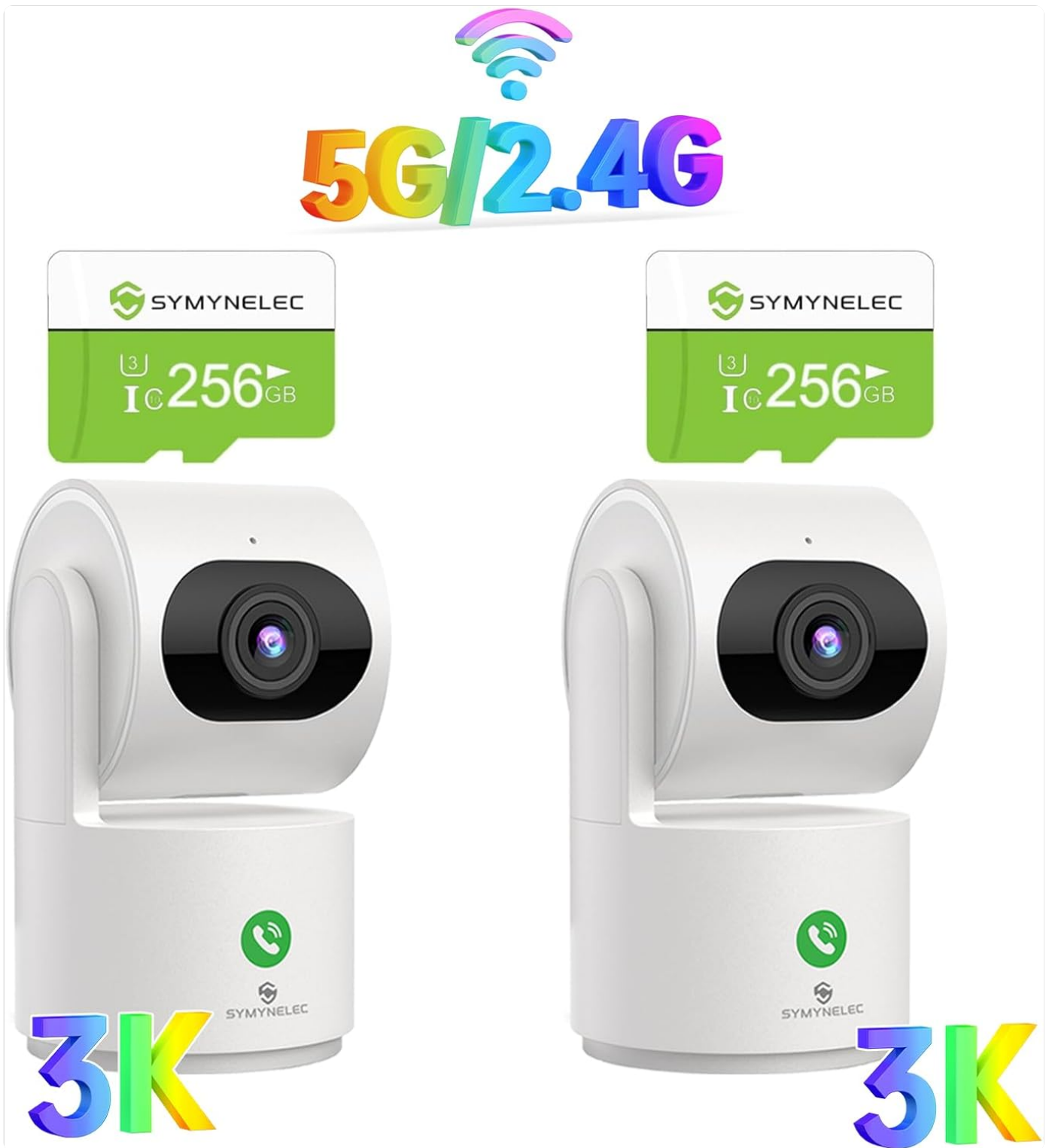
Figure 1: Overview of the SYMYNELEC Y3 camera package contents, including two cameras and two 256GB TF cards.