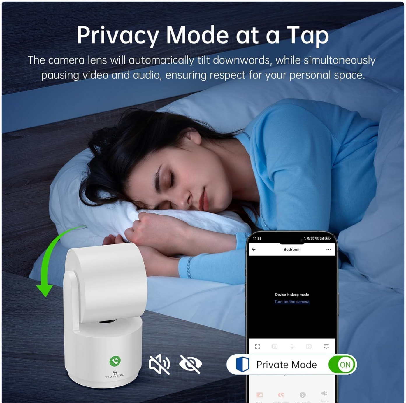
Figure 7: Activating Privacy Mode for personal space.

The camera lens will automatically tilt downwards, while simultaneously pausing video and audio, ensuring respect for your personal space.