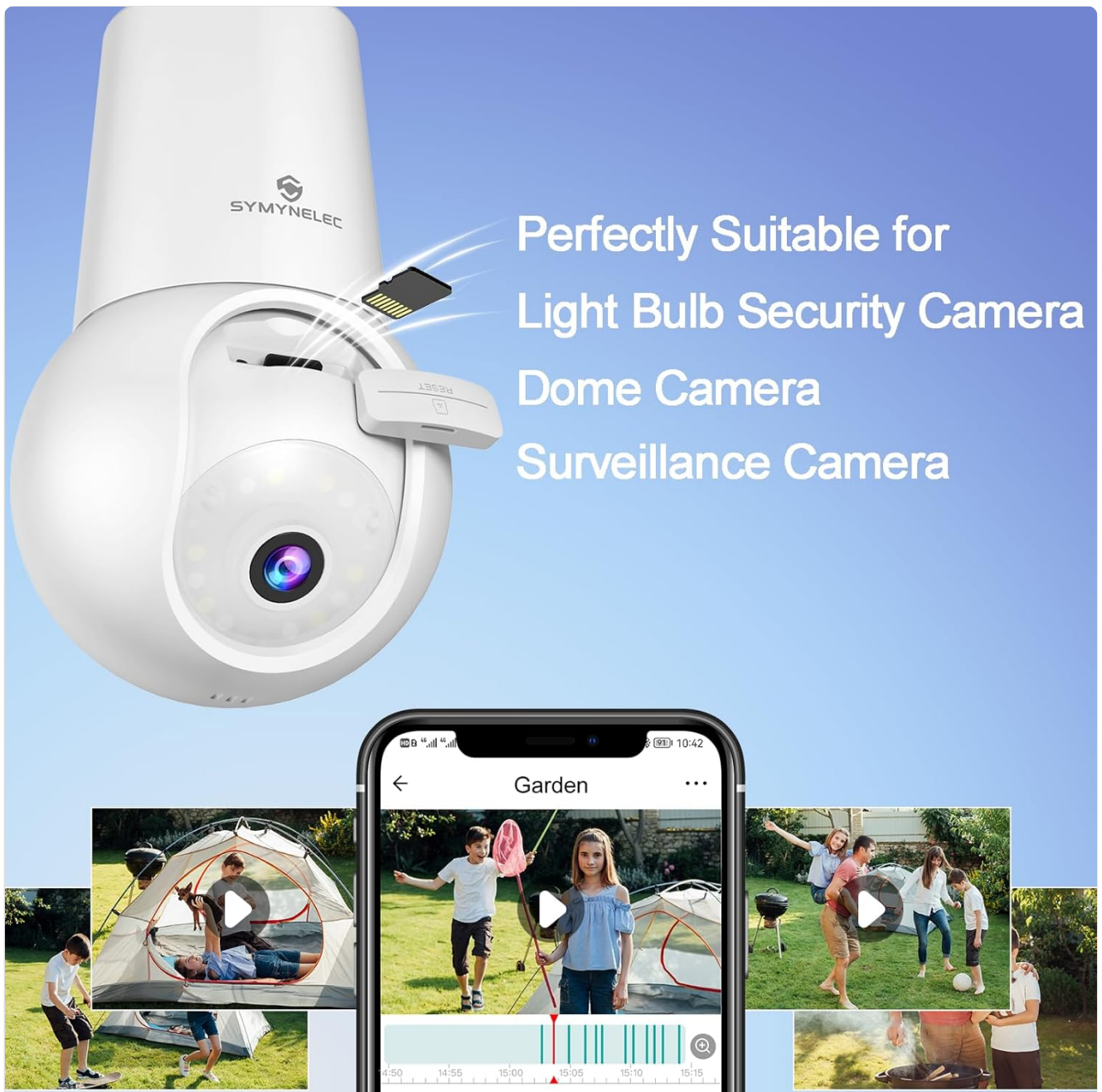
Figure 2: Location of the TF card slot on the SYMYNELEC Y3 camera.