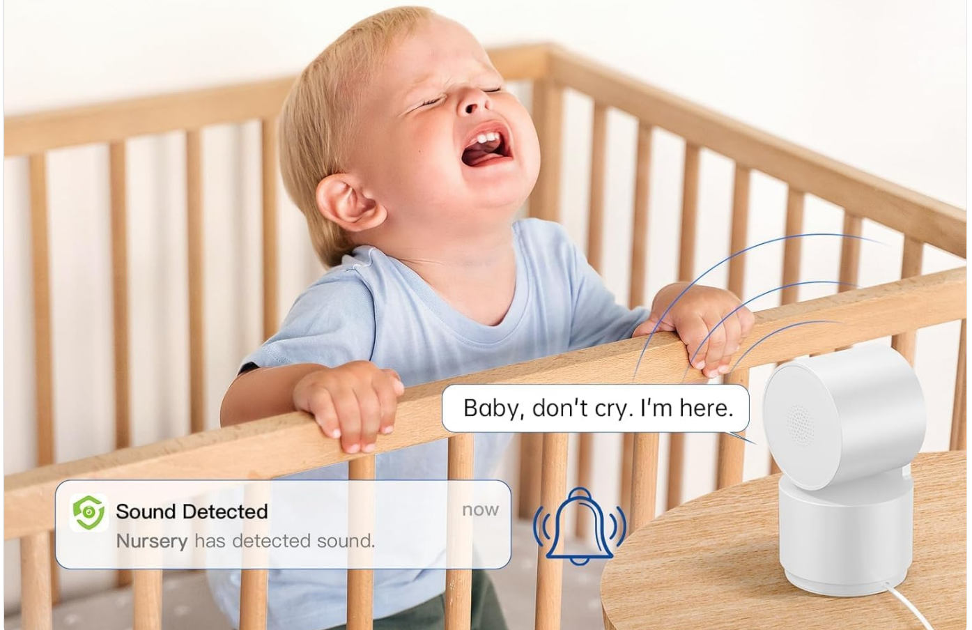
Figure 6: AI Sound Detection for monitoring audio events.