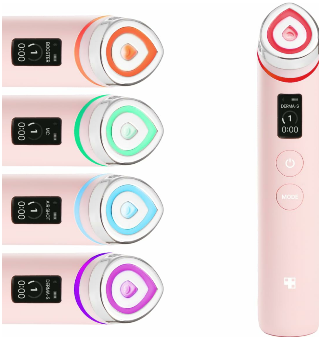
The Medicube Age-R Booster Pro device in pink, showcasing its sleek design and the various LED light modes.