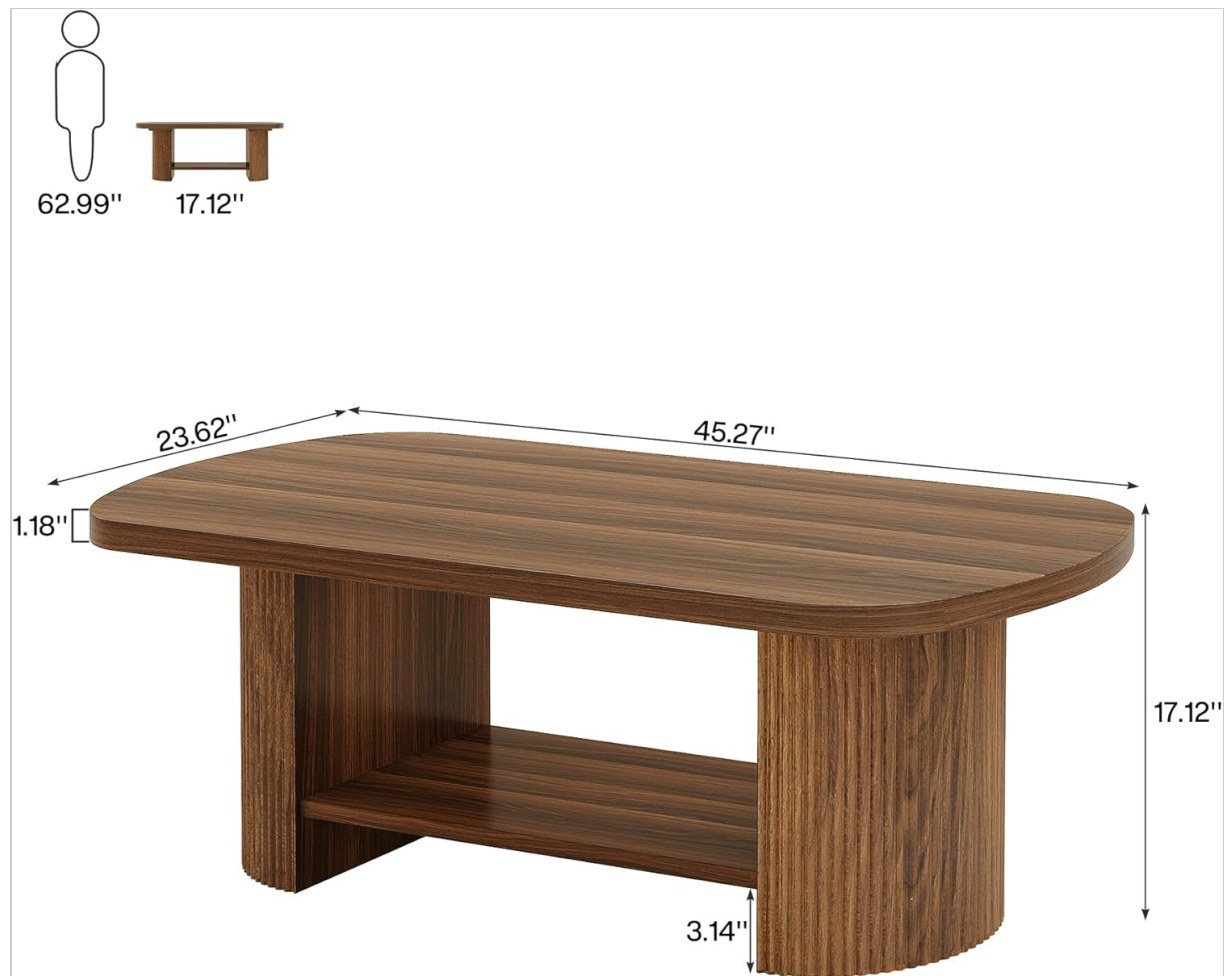
Image: Fully assembled Tribesigns Oval Coffee Table, showcasing its two-tier design and rustic brown finish.