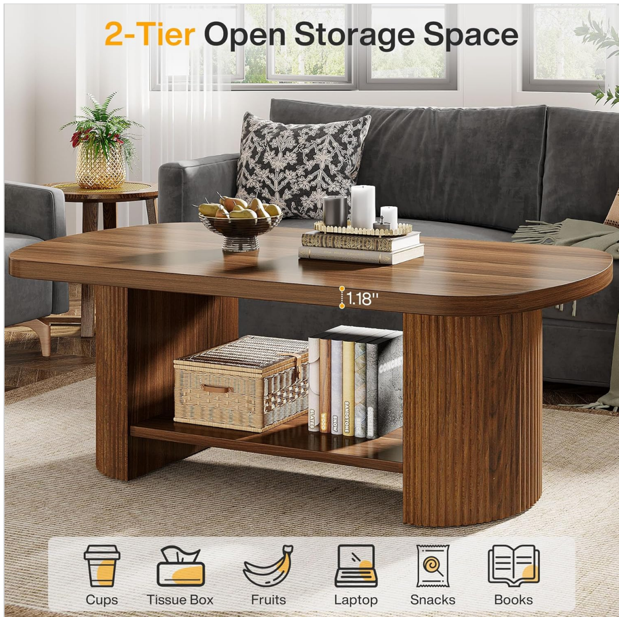
Image: The coffee table in a living room setting, demonstrating the use of the two-tier storage for books and a decorative basket.

Your browser does not support the video tag.