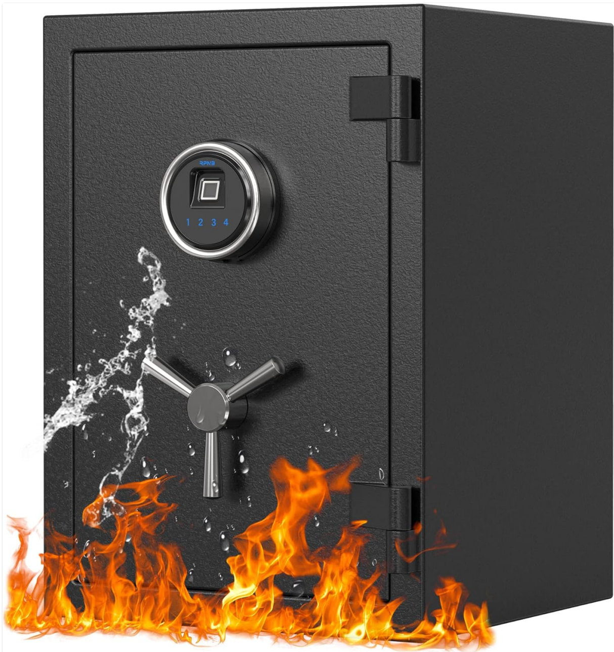
Image: The RPNB Smart Touchscreen Fireproof Safe, designed to protect valuables from both fire and water damage.