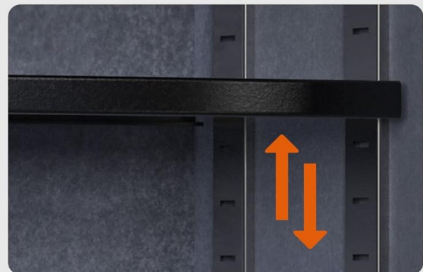
Image: Detail of the safe's handle, showing the battery compartment behind the touchscreen panel and the adjustable shelf inside.