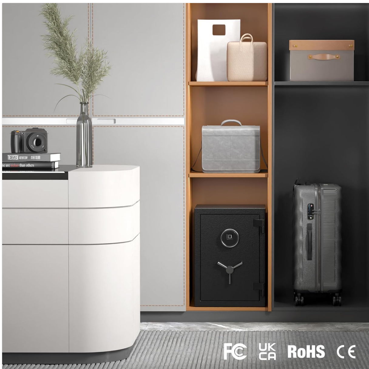
Image: The RPNB safe blends seamlessly into a home environment, providing secure storage without compromising aesthetics.

Your browser does not support the video tag.