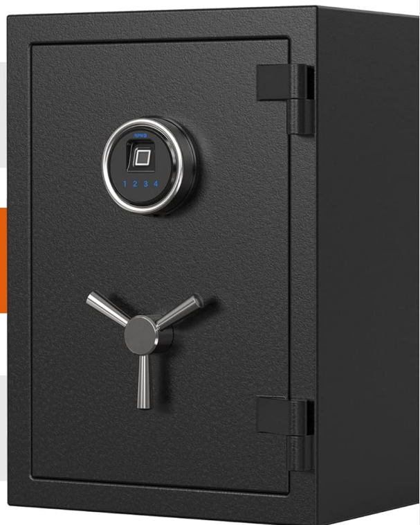
Image: A visual guide to the three unlocking methods: emergency key, biometric fingerprint, and 4-digit intelligent touchscreen keypad.