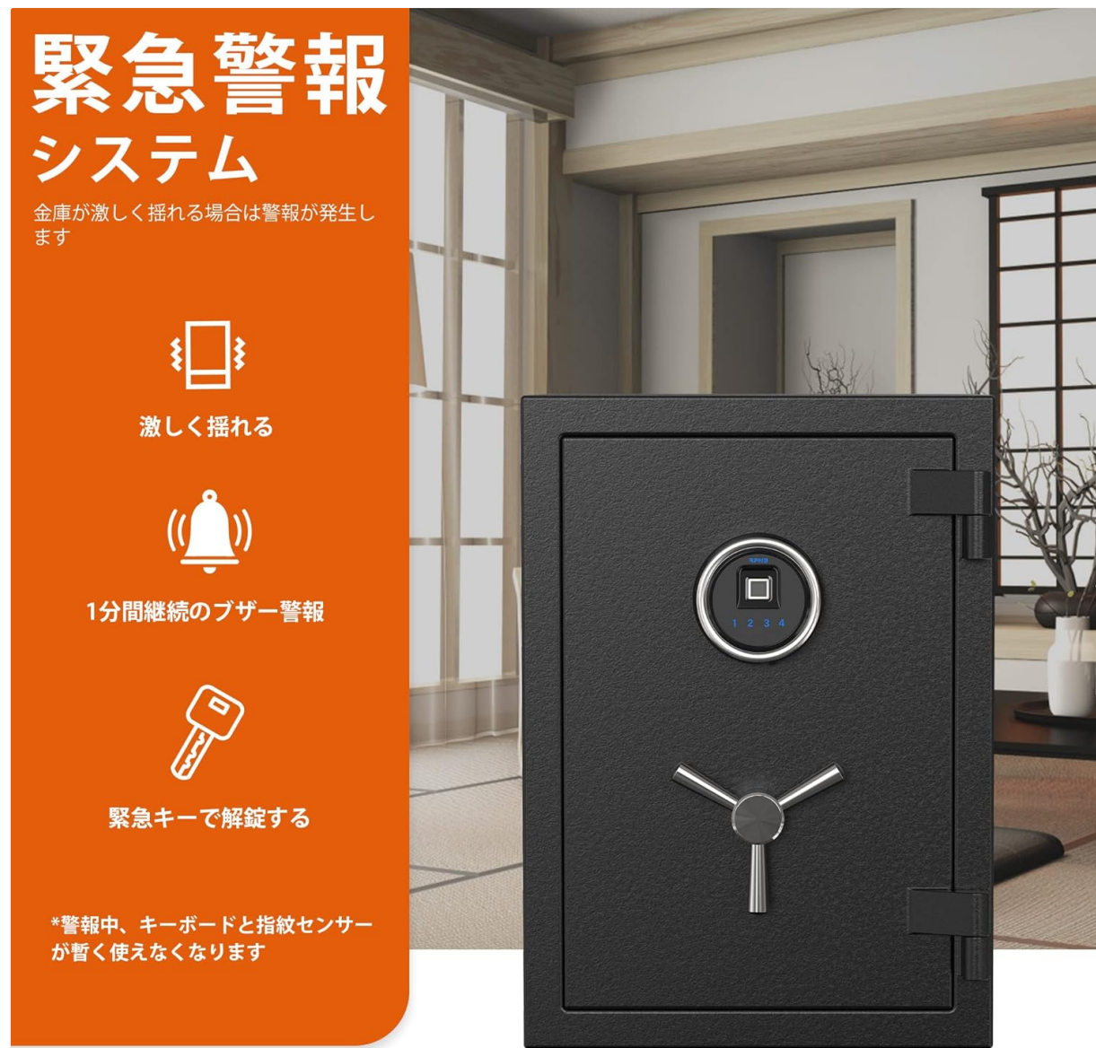
Image: The alarm system is activated by violent shaking, triggering a 1-minute buzzer. It can be deactivated using the emergency key.