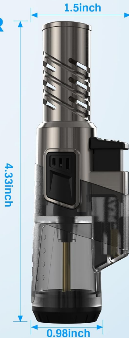
Figure 6: Dimensions of the TOPKAY K358 Mini Torch Lighter.