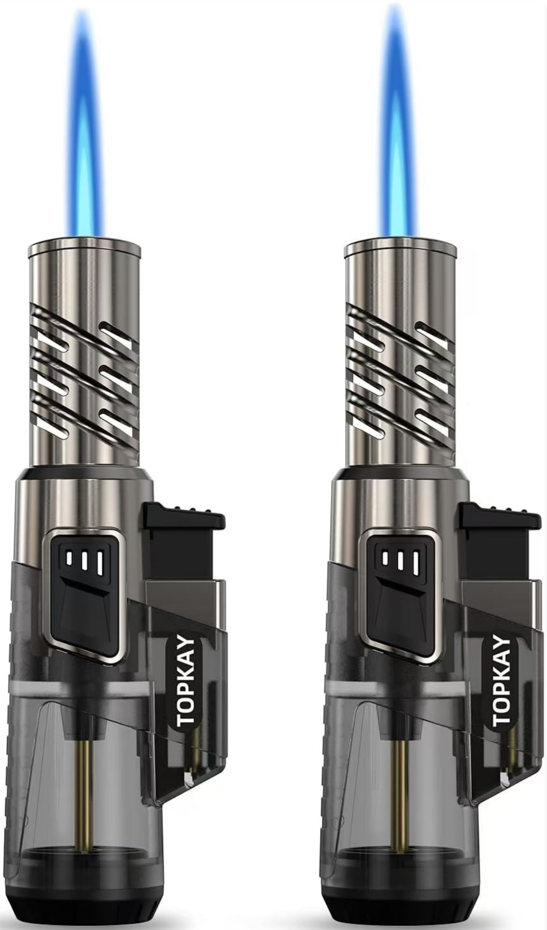
Figure 1: Two TOPKAY K358 Jet Flame Torch Lighters.