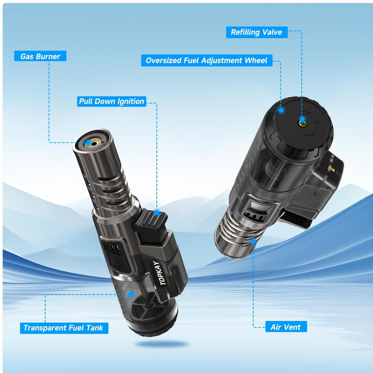
Figure 2: Key components of the TOPKAY K358 Torch Lighter.