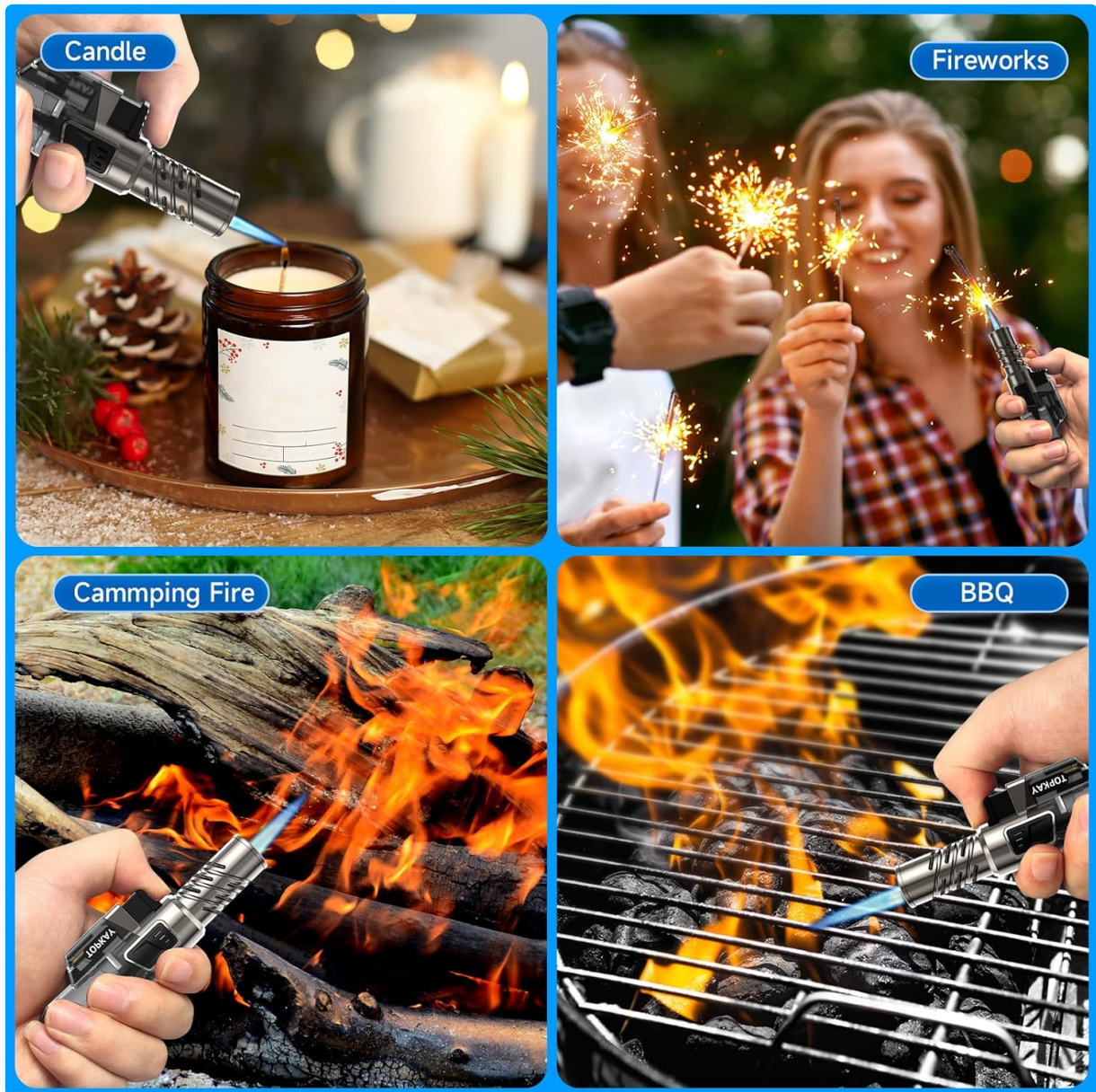
Figure 5: Versatile applications of the TOPKAY K358 lighter.