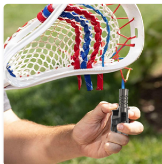
Step 2: Inserting the butane nozzle into the refill valve.