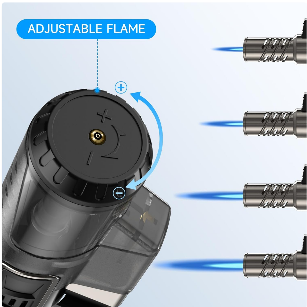
Figure 4: Adjusting the flame height using the wheel at the base.