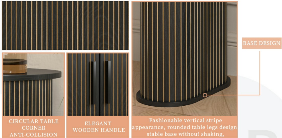
Image: A detailed view of the console table's features, including the circular table corner, elegant wooden handle, and the fashionable vertical stripe appearance of the legs with a stable base design.