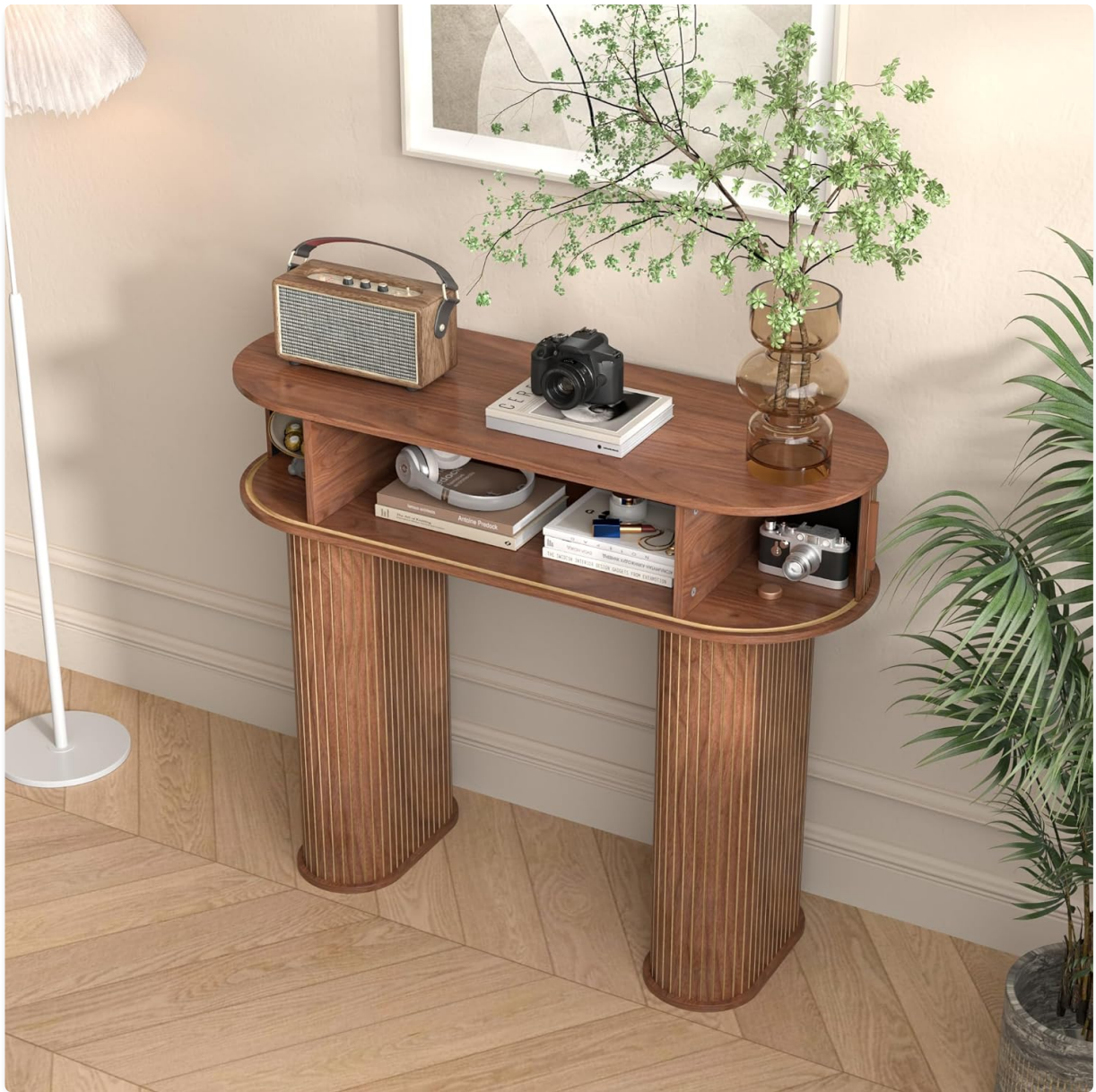
Image: The LUVIOHOME Round Console Table with its sliding doors open, revealing the internal storage compartments. Various items like books, headphones, and decorative objects are placed inside, demonstrating its utility.