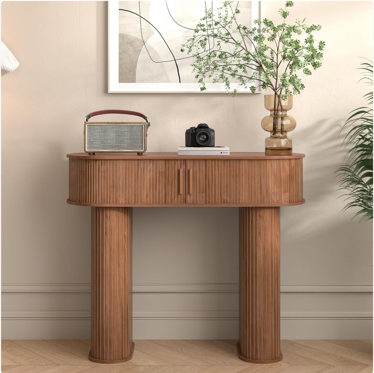
Image: The LUVIOHOME Round Console Table, featuring its unique design with a rounded top and two cylindrical legs, placed in a modern living room setting with decor.