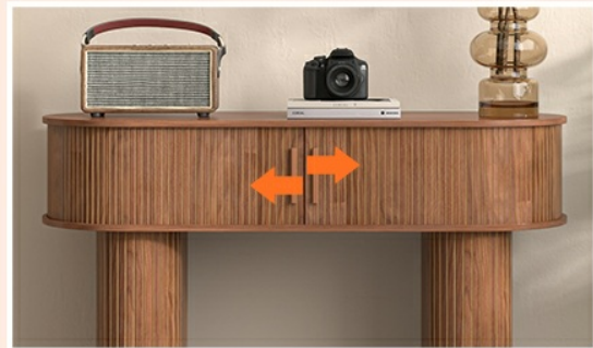
Image: A promotional image highlighting the large capacity storage and sliding door design of the console table, showing it in both open and closed configurations.