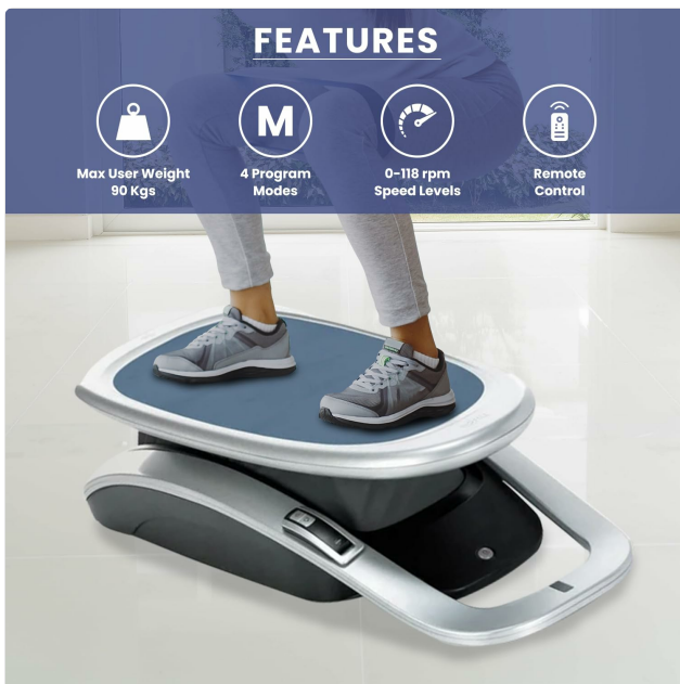
Image 4.2: Key features of the OSIM uSurf. This image illustrates a user standing on the uSurf, with icons indicating features such as maximum user weight (90 Kgs), 4 program modes, speed levels (0-118 rpm), and remote control functionality.