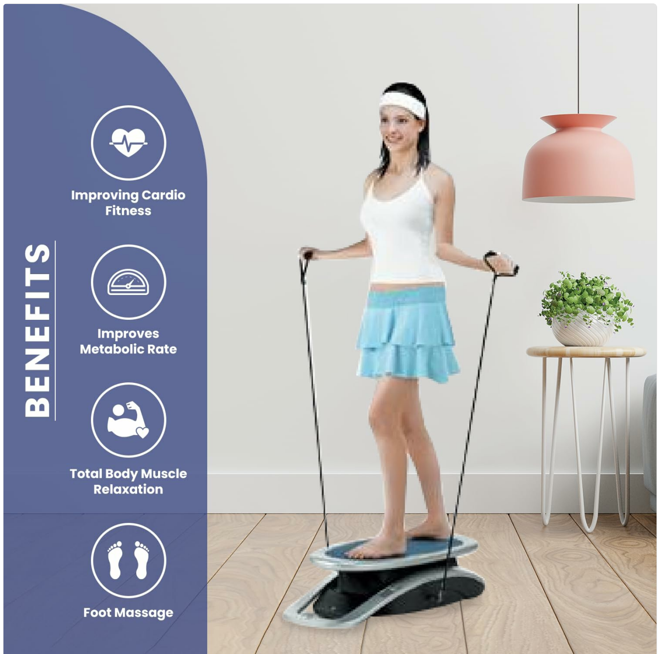
Image 7.1: Benefits of using the OSIM uSurf. This image shows a user on the device, accompanied by icons illustrating benefits such as improving cardio fitness, improving metabolic rate, total body muscle relaxation, and foot massage.