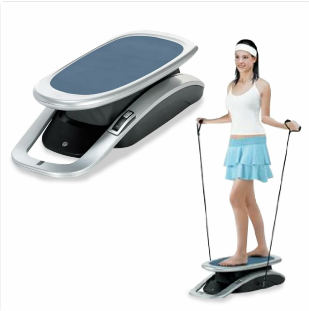
Image 4.1: The OSIM uSurf Wave Vibration Plate Massager. This image displays the compact design of the uSurf device, highlighting its main platform and base.

The OSIM uSurf is designed for ease of use and effective results. Familiarize yourself with its main components and features.