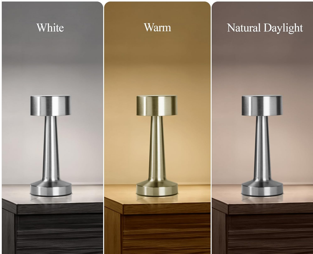
Image: Three Bell+Howell Chelsea Cordless LED Table Lamps, each displaying one of the three available light settings: White, Warm, and Natural Daylight.