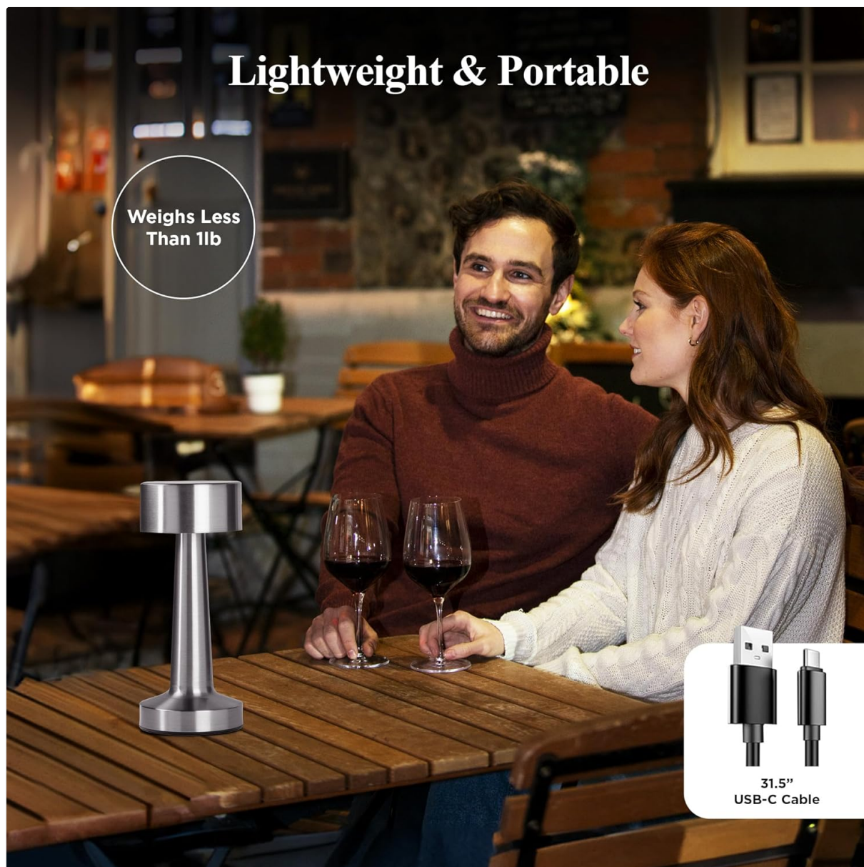
Image: A collage illustrating the versatility of the Bell+Howell Chelsea Cordless LED Table Lamp, shown in various indoor and outdoor settings such as a bedroom, bar, dining table, restaurant, living room, and patio.