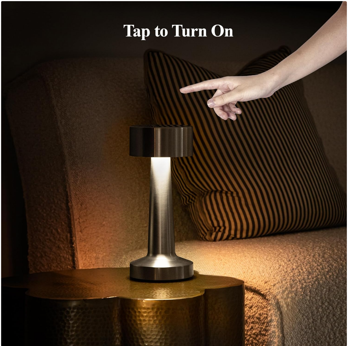
Image: A hand demonstrating the touch activation feature by tapping the top of the Bell+Howell Chelsea Cordless LED Table Lamp to turn it on.