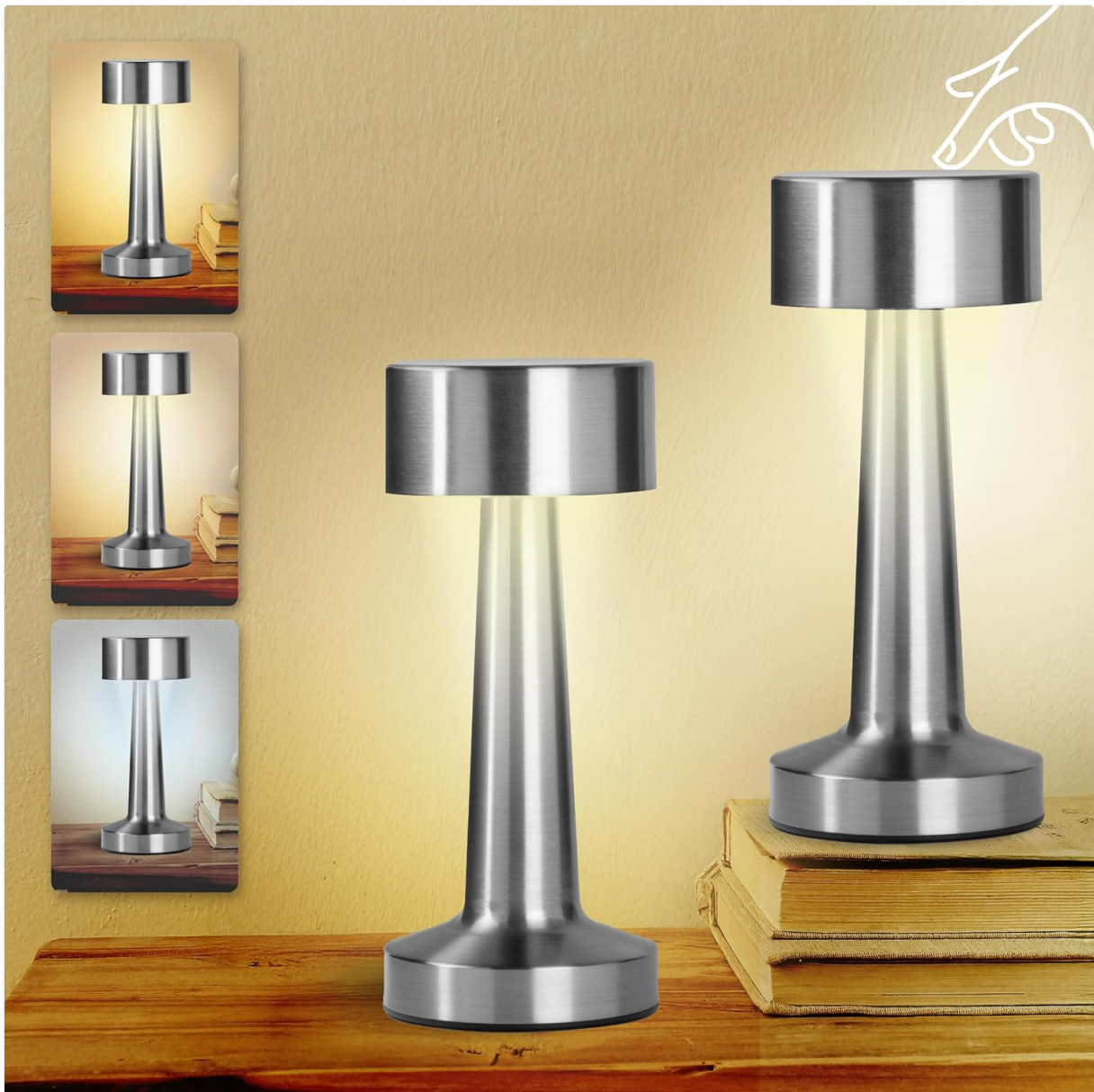
Image: The Bell+Howell Chelsea Cordless LED Table Lamp in silver finish, demonstrating its three light color settings: warm, white, and daylight.