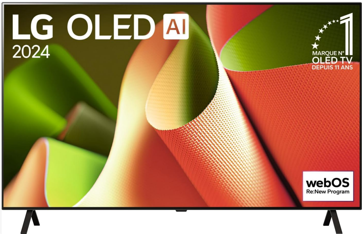
Image 3.1: Front view of the LG OLED48B4 TV, showcasing its slim bezel and display.