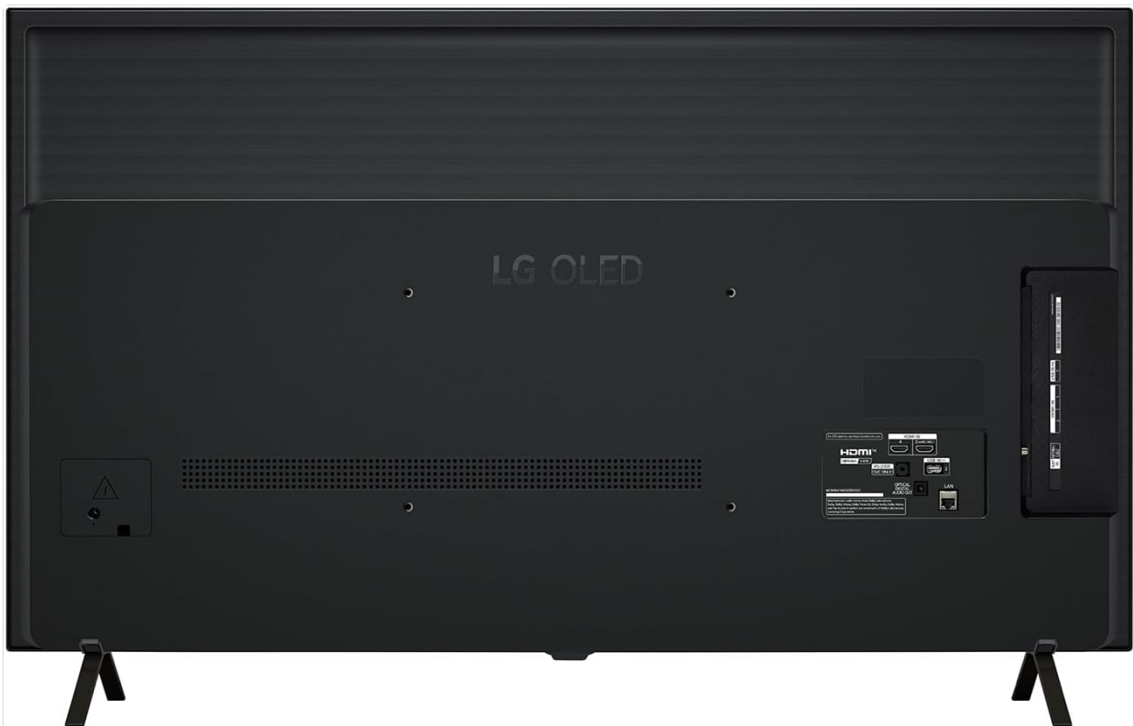
Image 4.2: Rear view of the LG OLED48B4 TV, highlighting the HDMI, USB, and Ethernet ports.