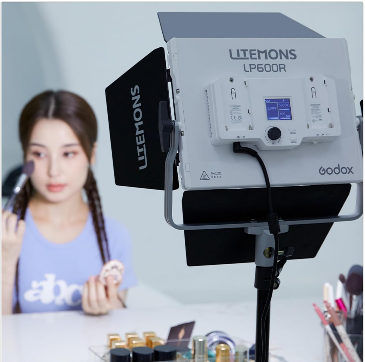
Image 6.2: The LP600R provides soft, uniform light, ideal for various applications like live streaming or portraiture.