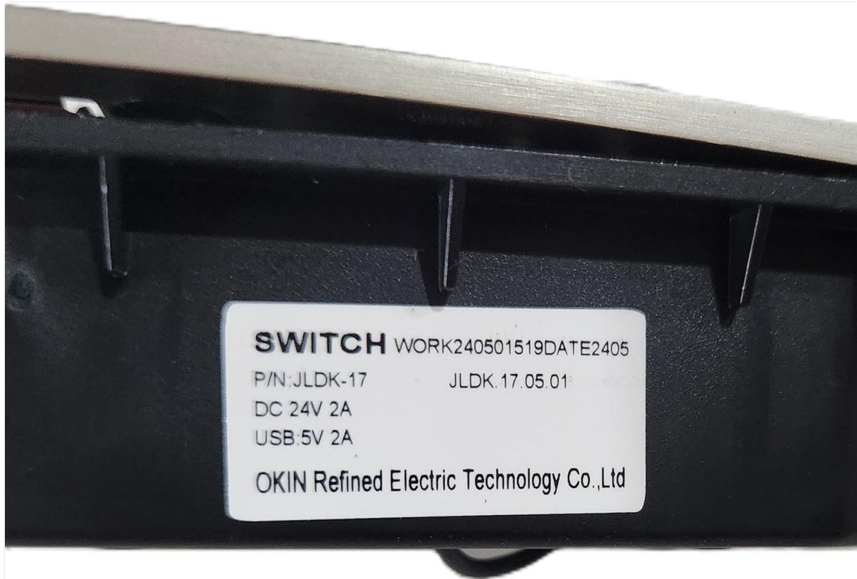
Figure 2: Product Label. A close-up view of the label on the switch, displaying the model number (P/N JLDK.17.05.01), DC 24V 2A, and USB 5V 2A specifications, along with the manufacturer's name.