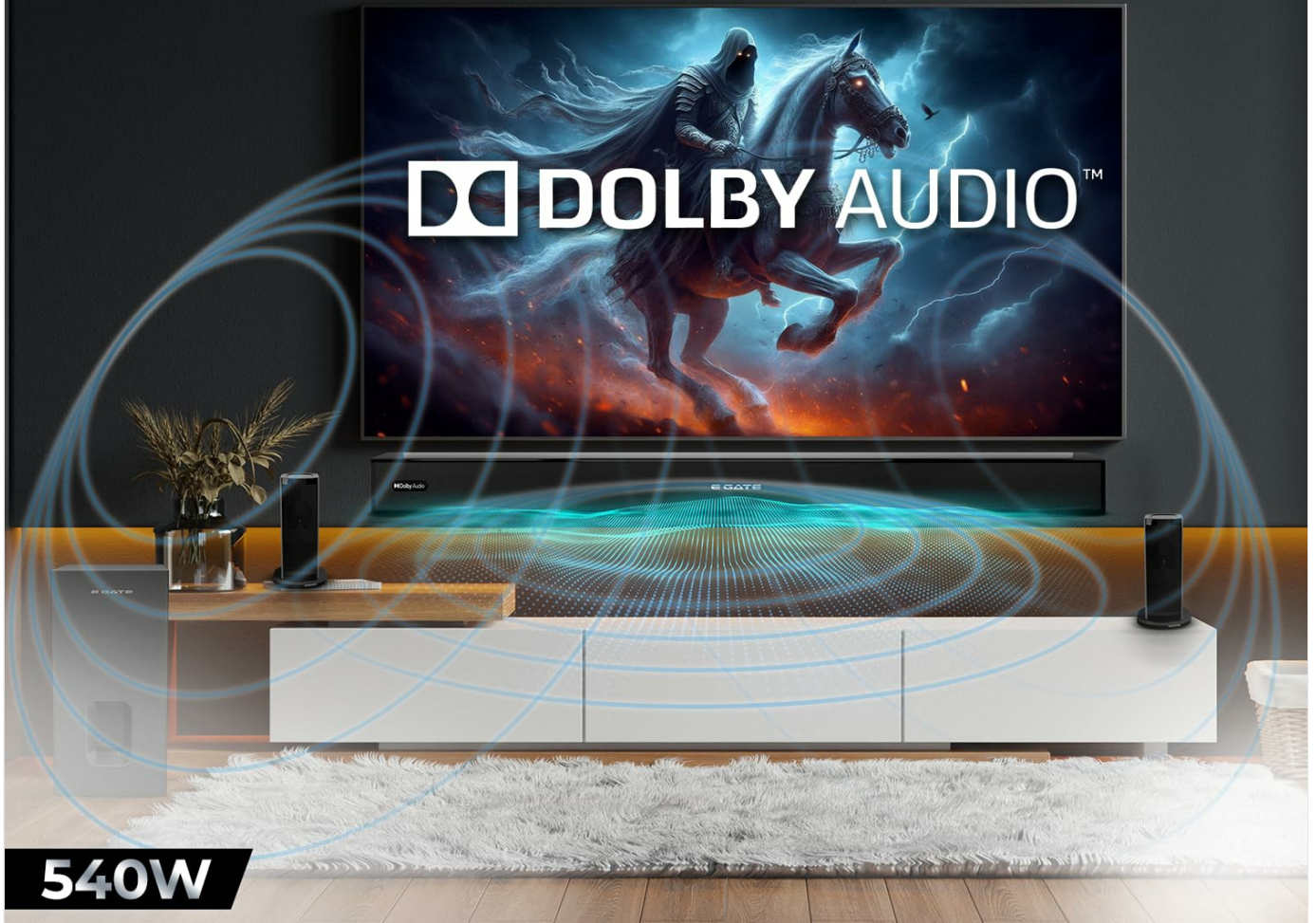
Image: The E GATE Phantom 630D soundbar and subwoofer system, highlighting its 5.1 surround sound capability and Dolby Audio support for an immersive experience.