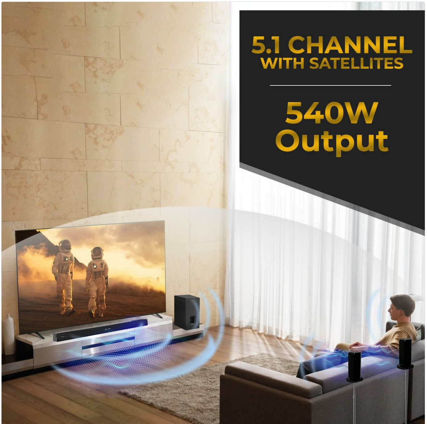
Image: A typical living room setup showing the soundbar positioned below a television, the subwoofer to the side, and satellite speakers placed behind the seating area for 5.1 channel audio.