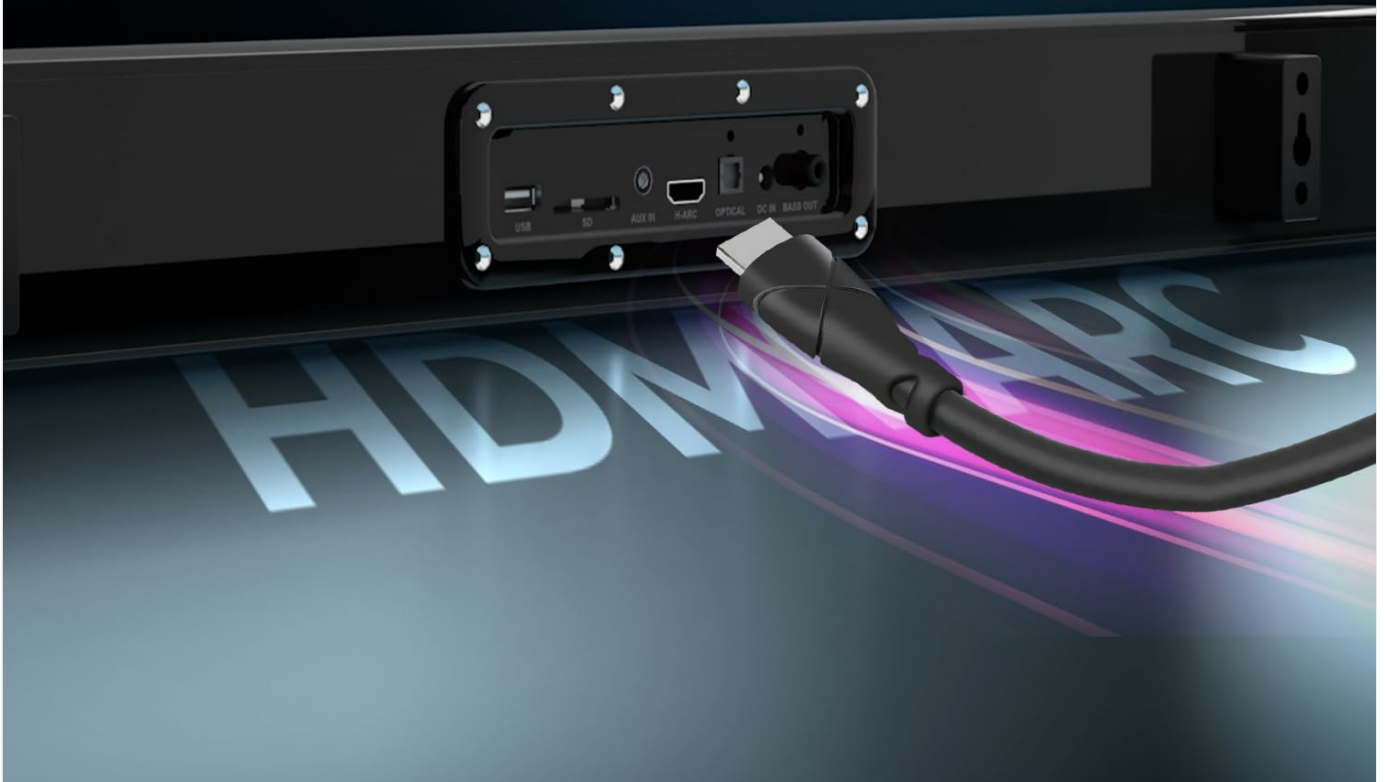
Image: Close-up of the soundbar's rear panel, highlighting the USB, AUX In, Optical, HDMI ARC, and DC In ports for various connectivity options.