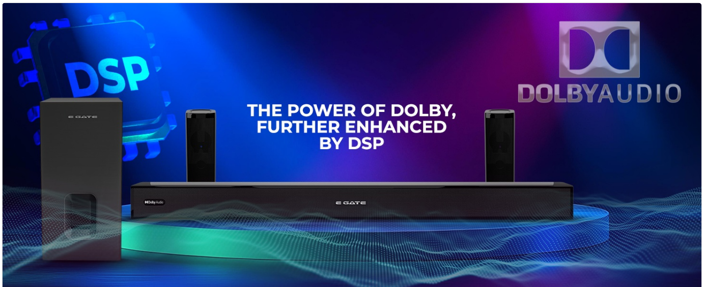
Image: The E GATE Phantom 630D soundbar system, illustrating the integration of a DSP chip to enhance Dolby Audio performance.