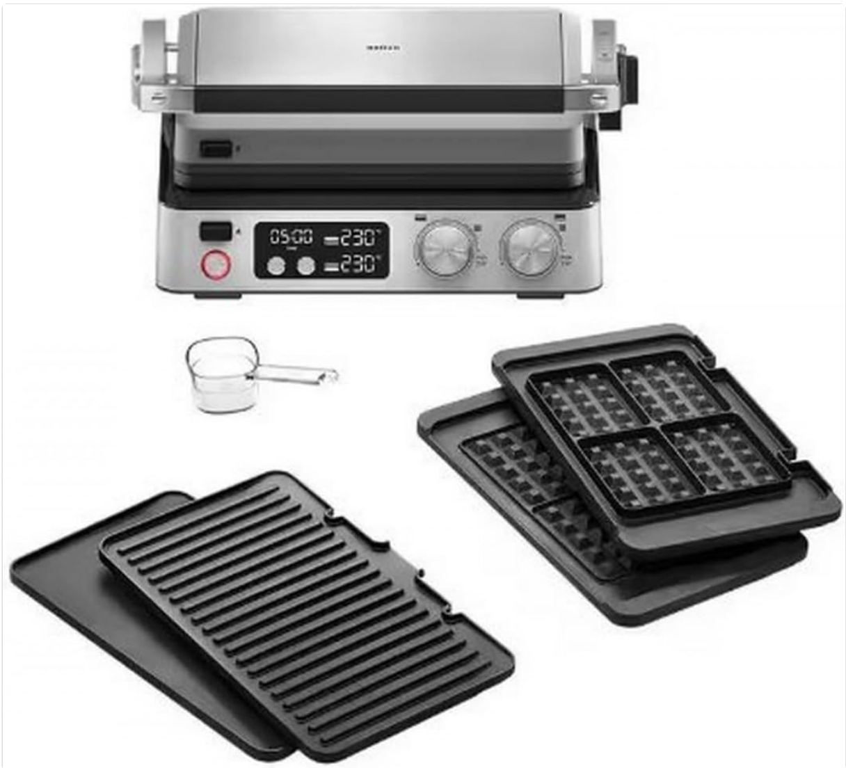
Figure 1: The Braun MultiGrill 7, showcasing its main unit, interchangeable grill plates, waffle plates, and a measuring cup.