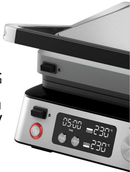
Figure 2: Visual representation of the MultiGrill 7's key features: 3-in-1 grilling positions, integrated grease tray, locking system, and dishwasher-safe parts.