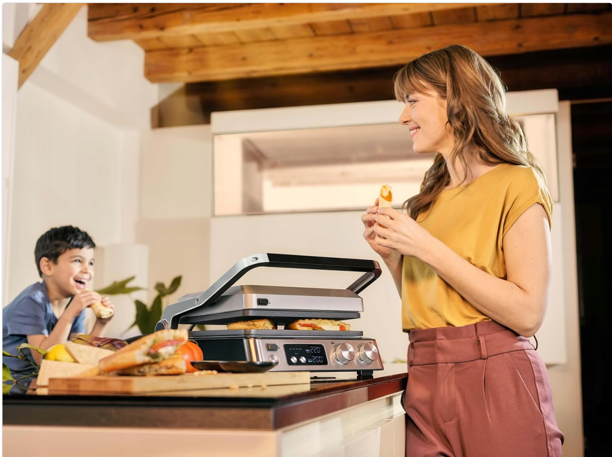
Figure 3: The MultiGrill 7 in its open (BBQ) position, ideal for grilling steaks, corn, and other vegetables simultaneously.