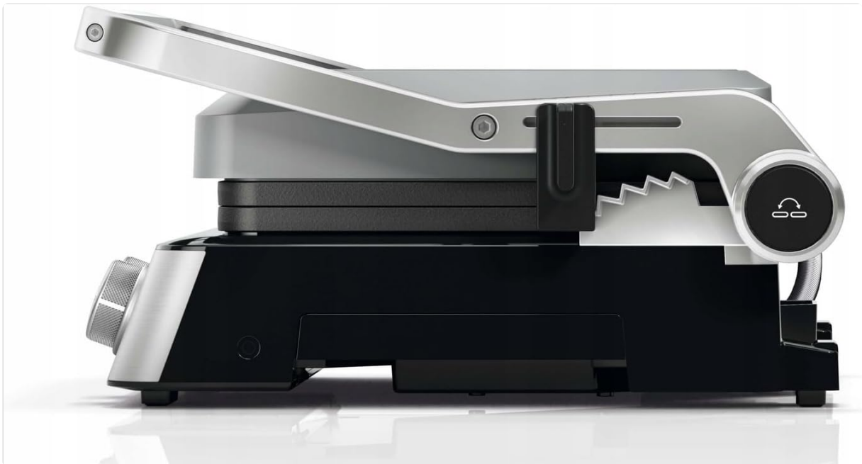
Figure 6: Side view of the MultiGrill 7, highlighting its robust hinge and the mechanism for adjusting or locking the plates for storage.