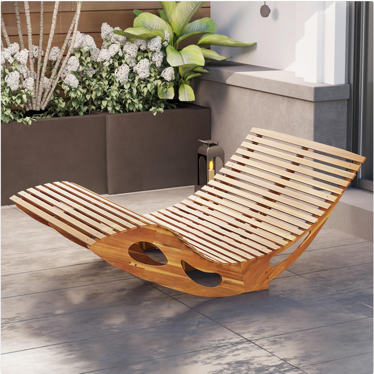
Image 4.1: Diagram highlighting the safe and smooth rocking motion of the chaise lounge, with anti-tipping stoppers for stability.