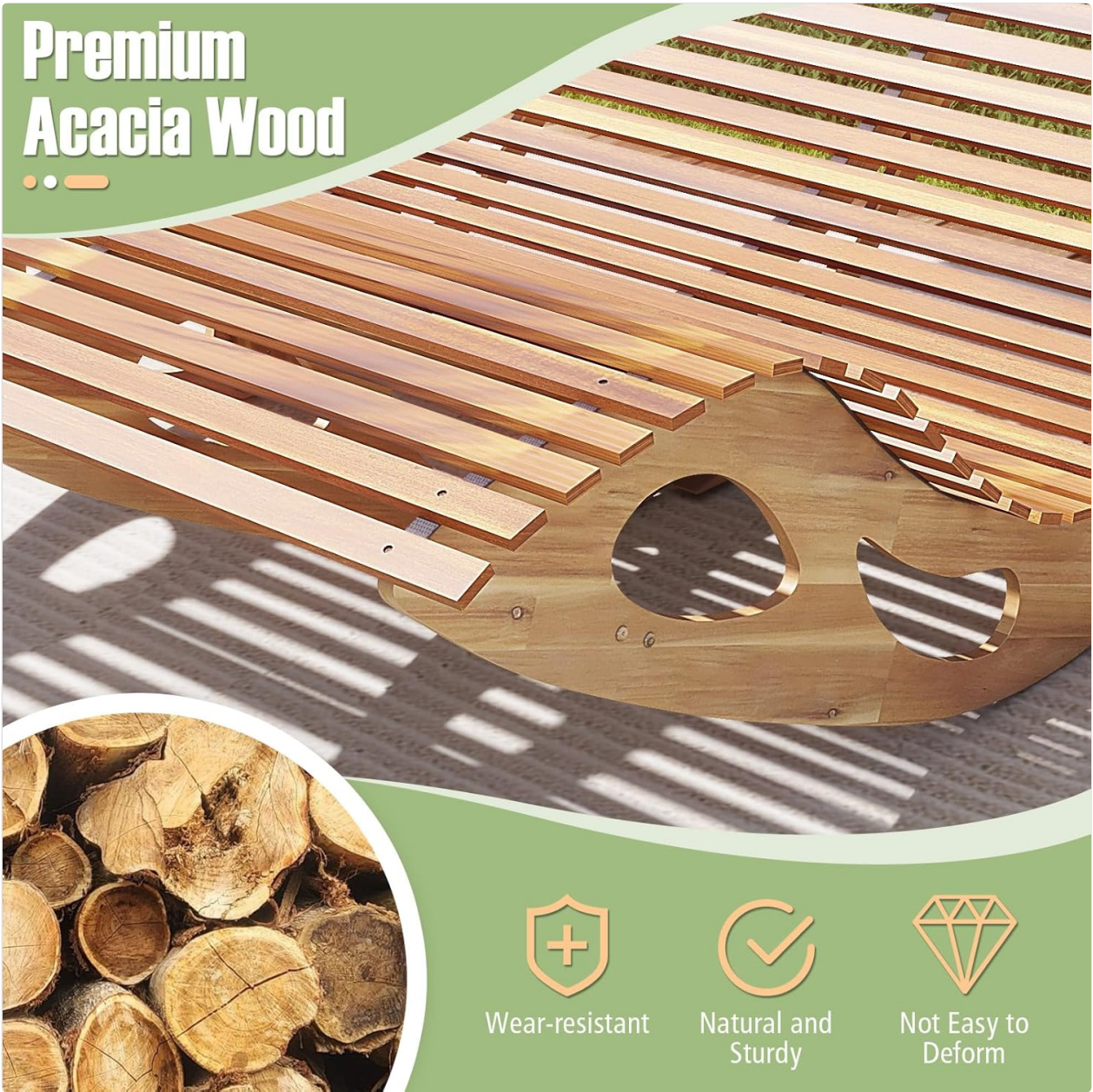
Image 5.1: Close-up view of the premium acacia wood, highlighting its wear-resistant, natural, sturdy, and non-deforming qualities.