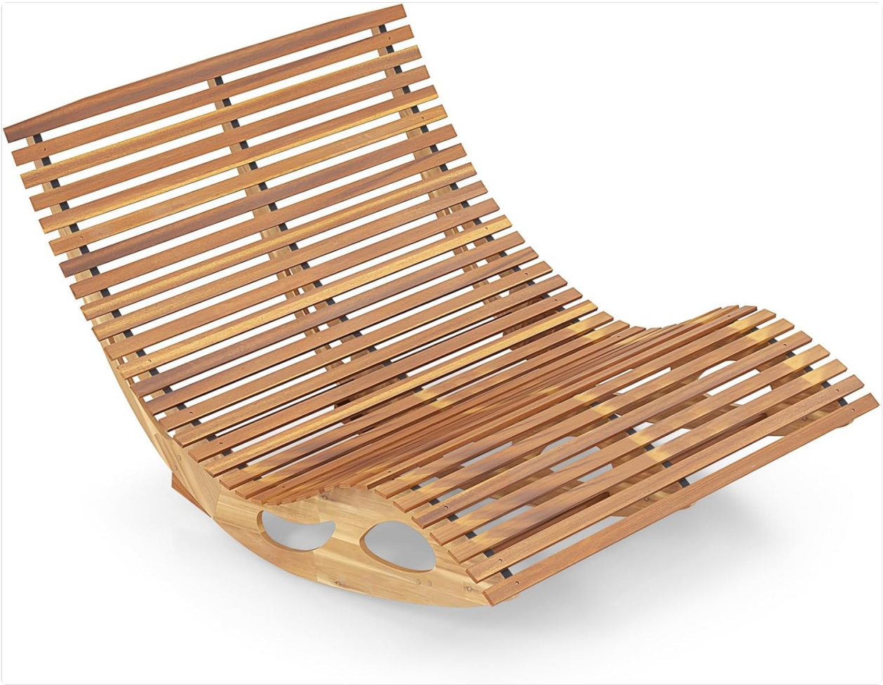
Image 1.1: The Tangkula Outdoor Double Chaise Lounge Chair, showcasing its natural wood finish and curved design.