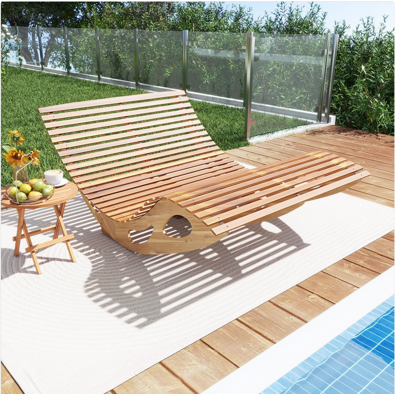
Image 3.1: The assembled chaise lounge positioned on a patio next to a pool, demonstrating its outdoor use.