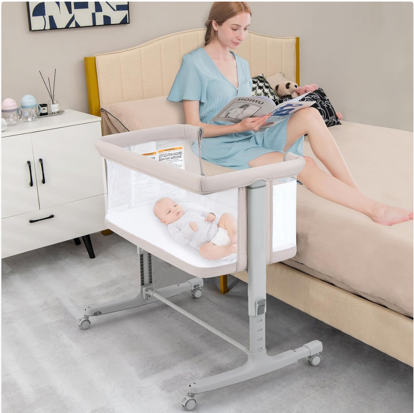
Image: The INFANS 3-in-1 Baby Bassinet positioned next to a bed, with a mother reading nearby and a baby sleeping peacefully inside. This illustrates the bedside sleeper functionality.