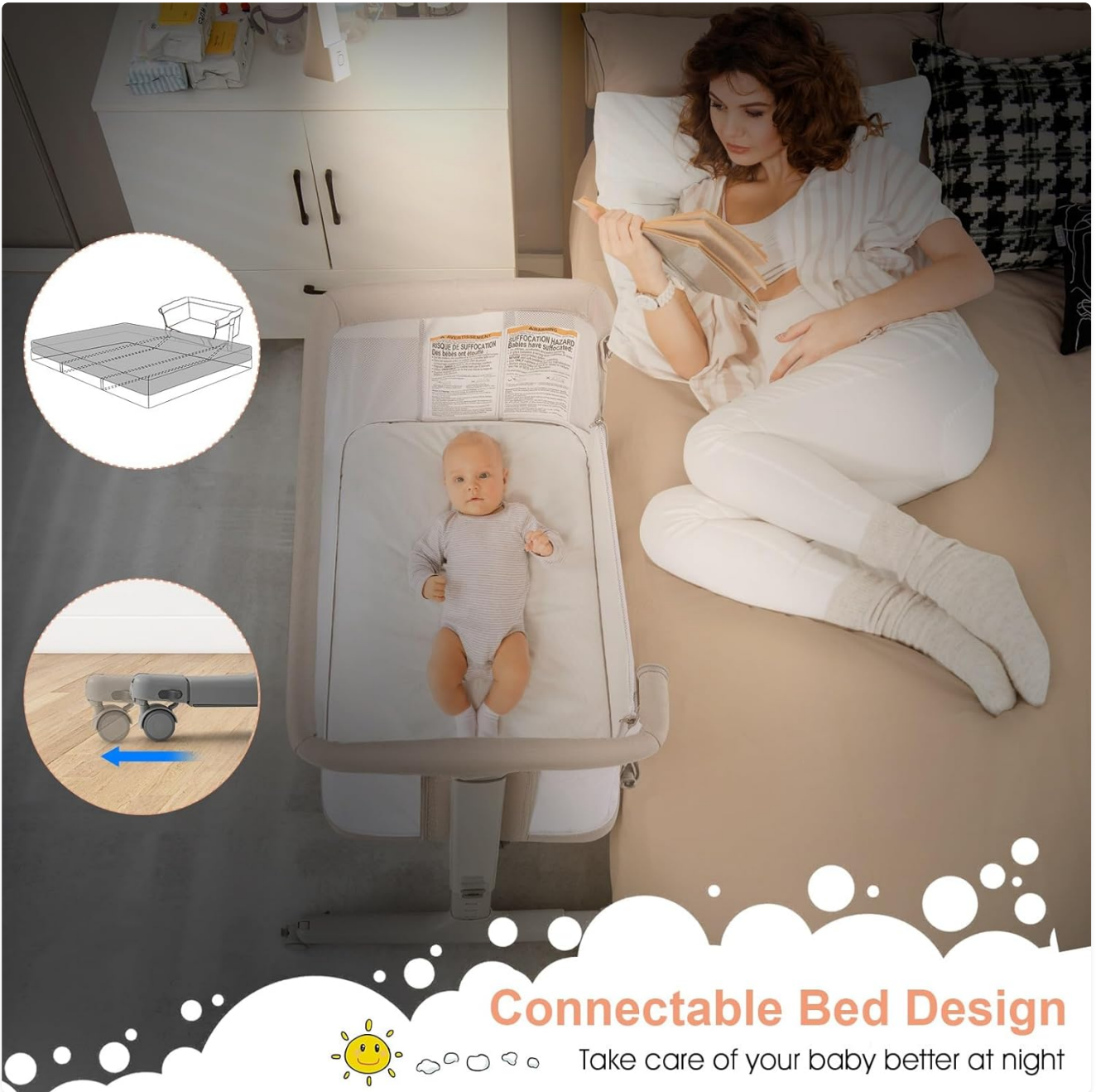
Image: The bassinet configured as a bedside sleeper, securely attached to an adult bed, illustrating the convenience for nighttime feeding and care.