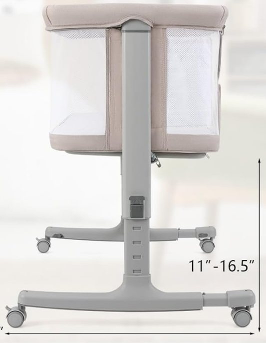
Image: A comprehensive diagram detailing the dimensions of the bassinet, its mattress, and the recommended age and weight limits for safe use.