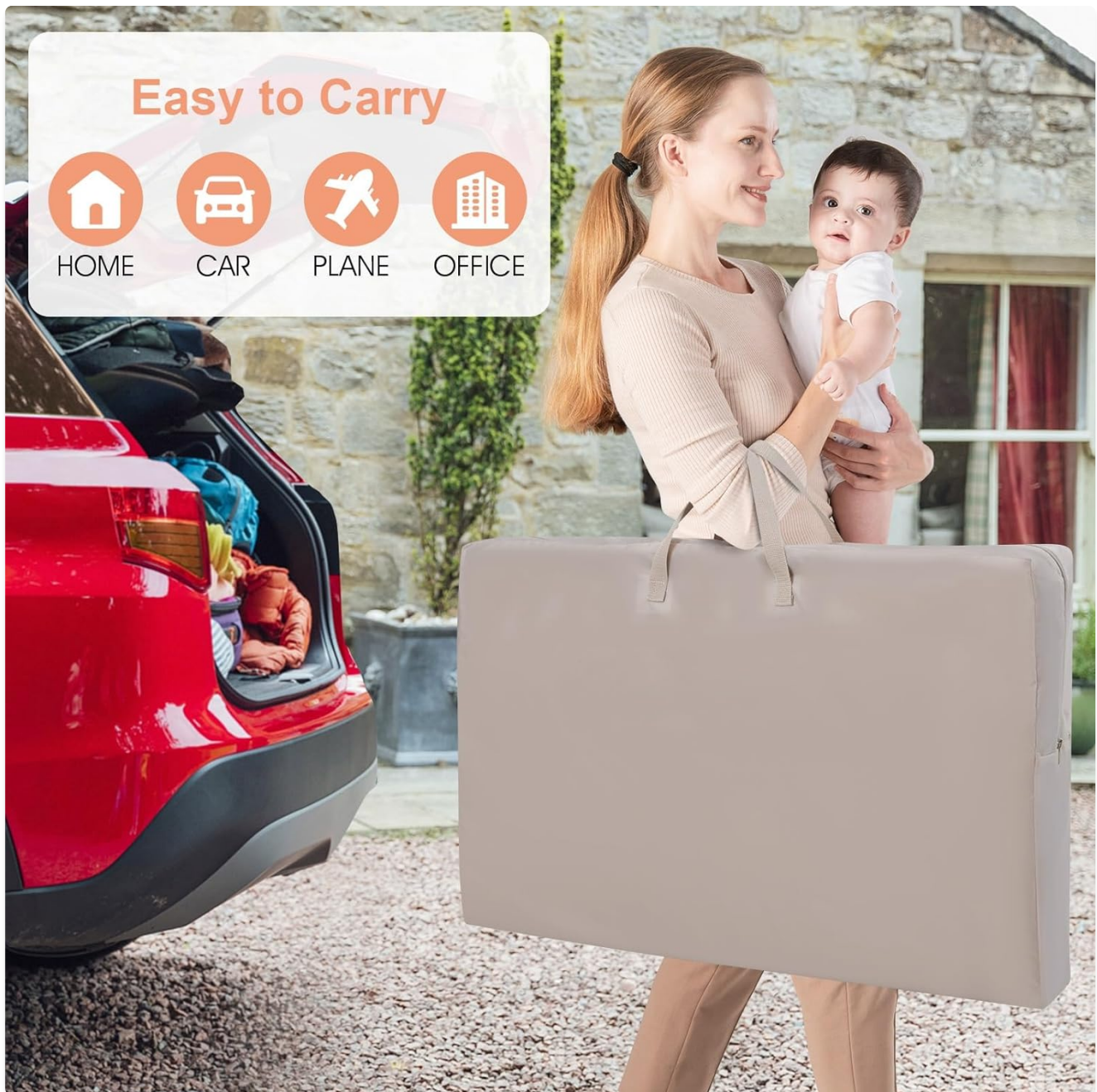
Image: A woman easily carrying the INFANS bassinet in its compact travel bag, demonstrating its portability for various locations.