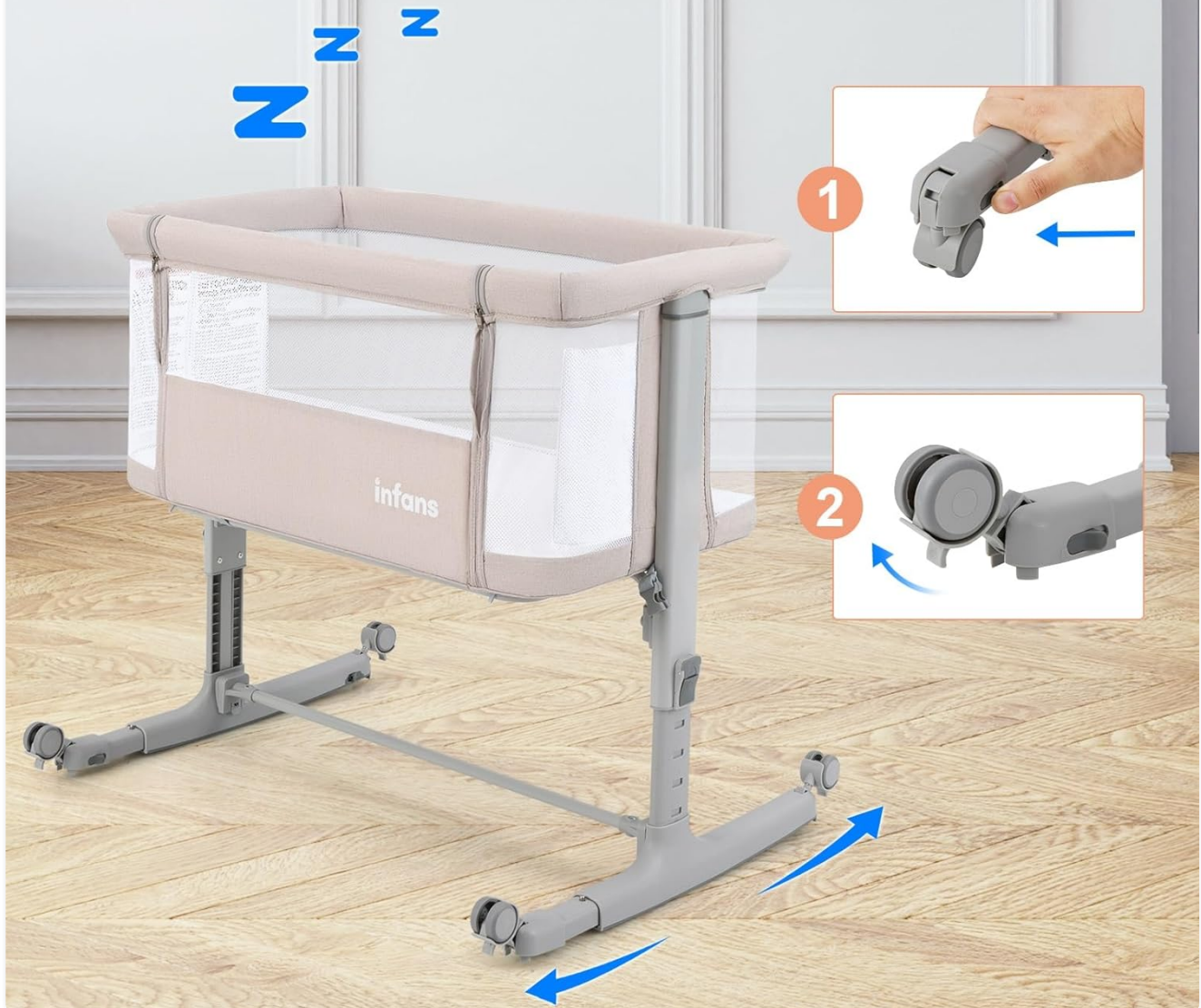
Image: A visual guide showing the transformation of the bassinet into a cradle by adjusting the wheels, with a graphic indicating a sleeping baby.

The wheels turned upward to form a cradle