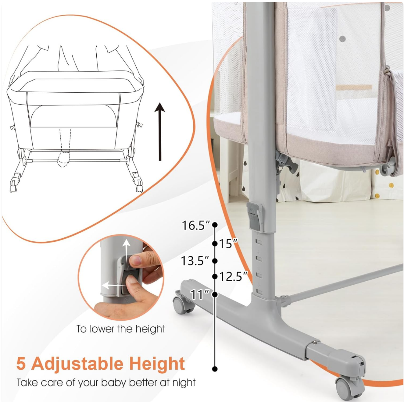
Image: A detailed diagram showcasing the five different height adjustments available for the bassinet, allowing it to align with various bed heights.