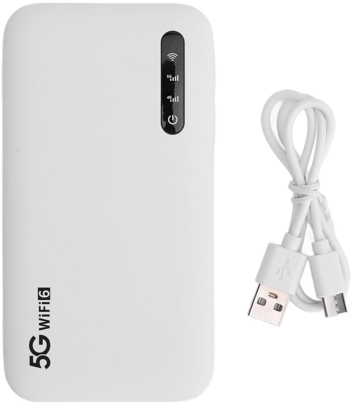
Image: The GOWENIC 5G Wi Fi 6 Mobile Hotspot shown alongside its included USB charging cable.