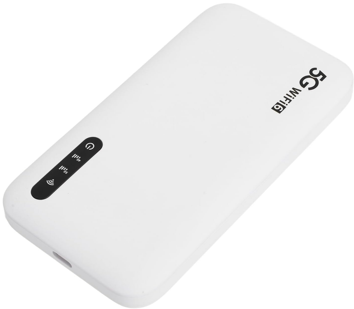
Image: Angled view of the GOWENIC 5G Wi Fi 6 Mobile Hotspot, highlighting the LED indicators for signal strength and network status.