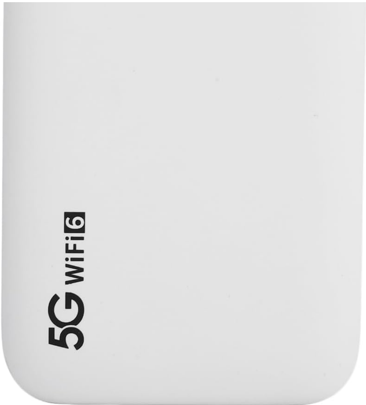
Image: Front view of the GOWENIC 5G Wi Fi 6 Mobile Hotspot, showing the power button and signal indicators.