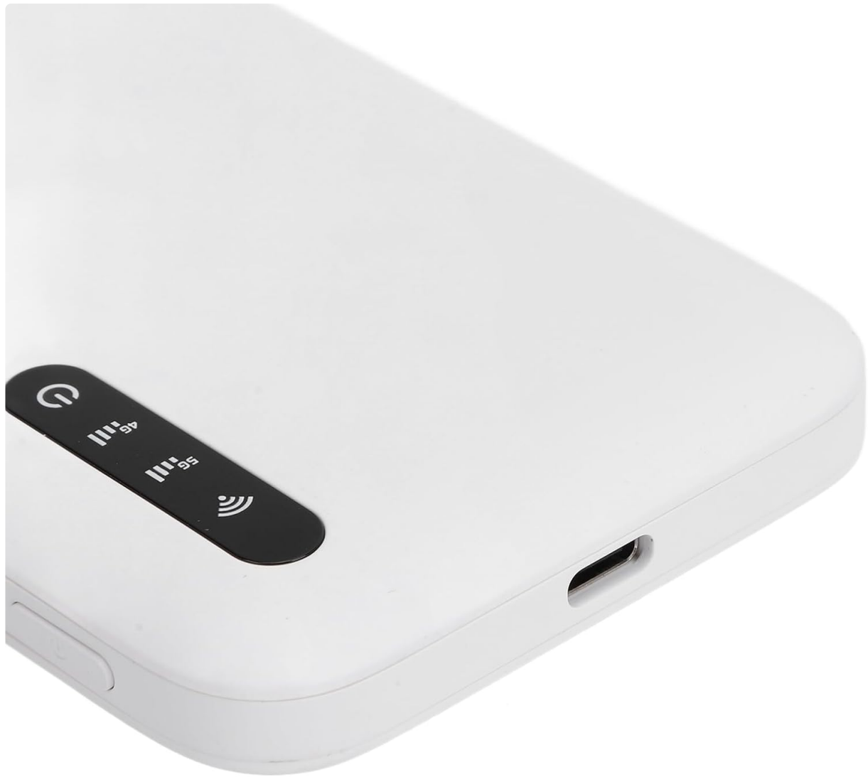
Image: A close-up view of the GOWENIC 5G Wi Fi 6 Mobile Hotspot, showing the USB-C charging port.