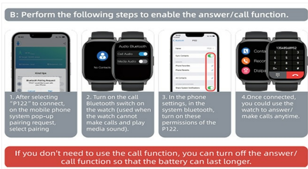
Image: Visual guide detailing four steps to enable the smart watch's call function: confirming pairing, turning on call Bluetooth on the watch, granting phone permissions, and confirming readiness for calls.

Note: If you do not require the call function, you can disable it to conserve battery life.