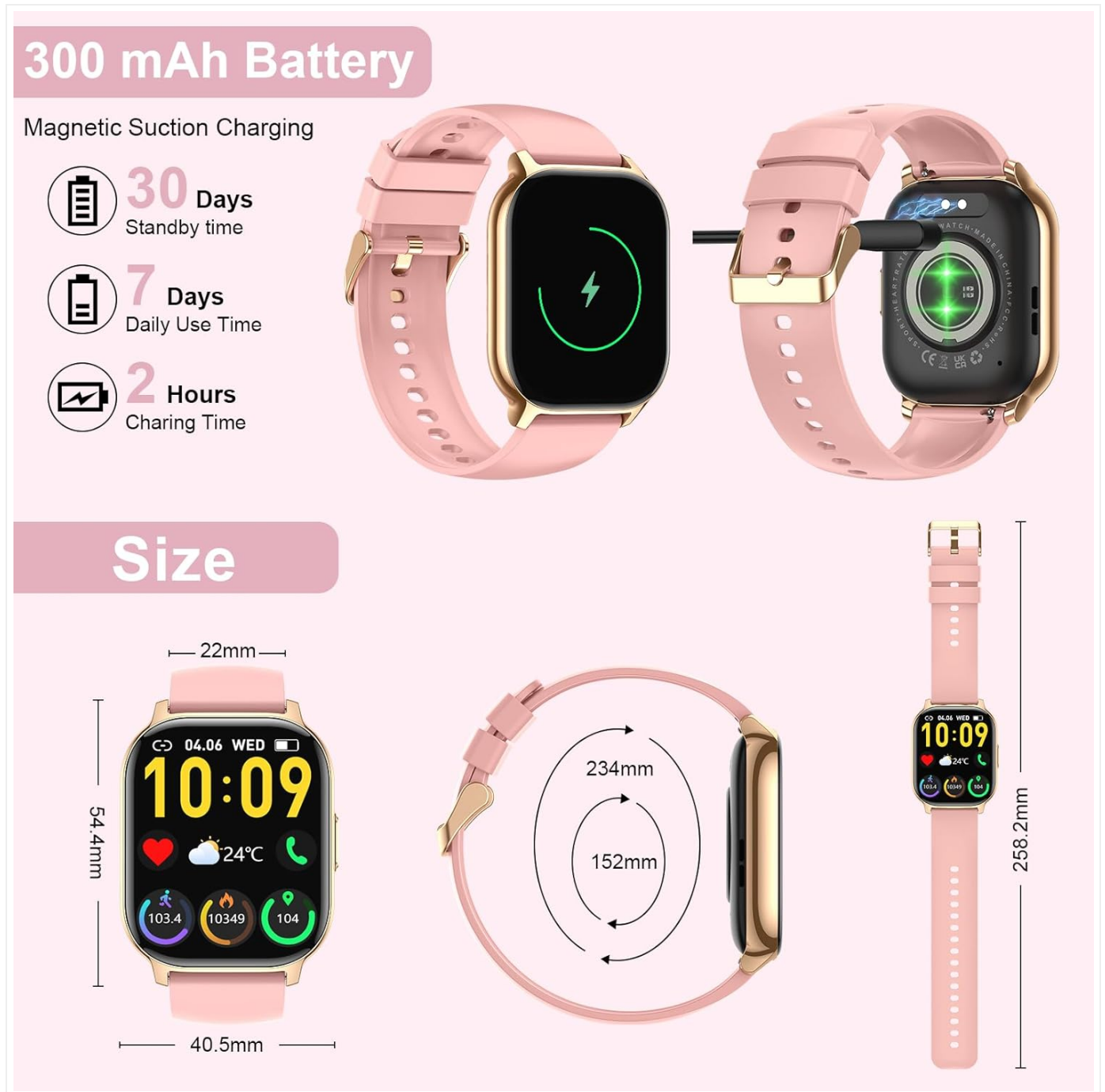
Image: Illustration of the magnetic charging process for the smart watch, showing the charger connecting to the watch's back. Also displays battery life estimates: 30 days standby, 7 days daily use, 2 hours charging time.