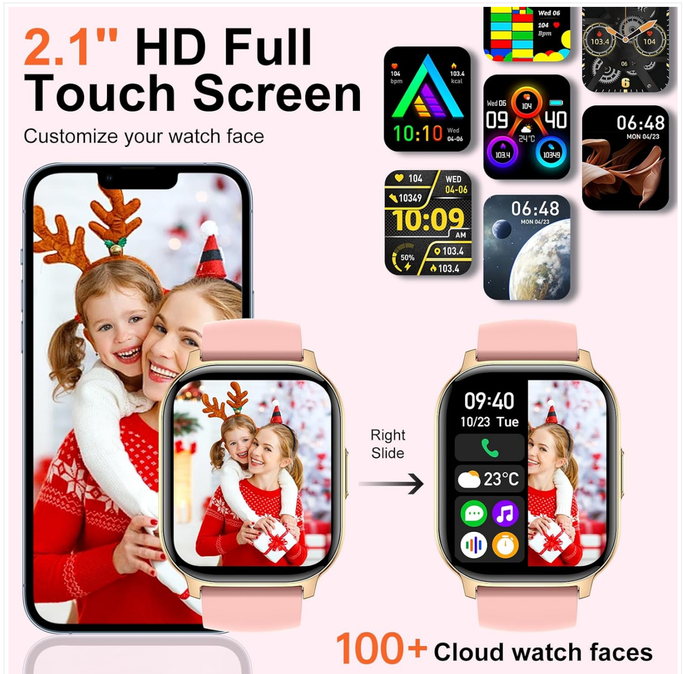
Image: The smart watch displaying different watch faces, including a custom photo background. A smartphone screen illustrates how to customize the watch face with personal images.