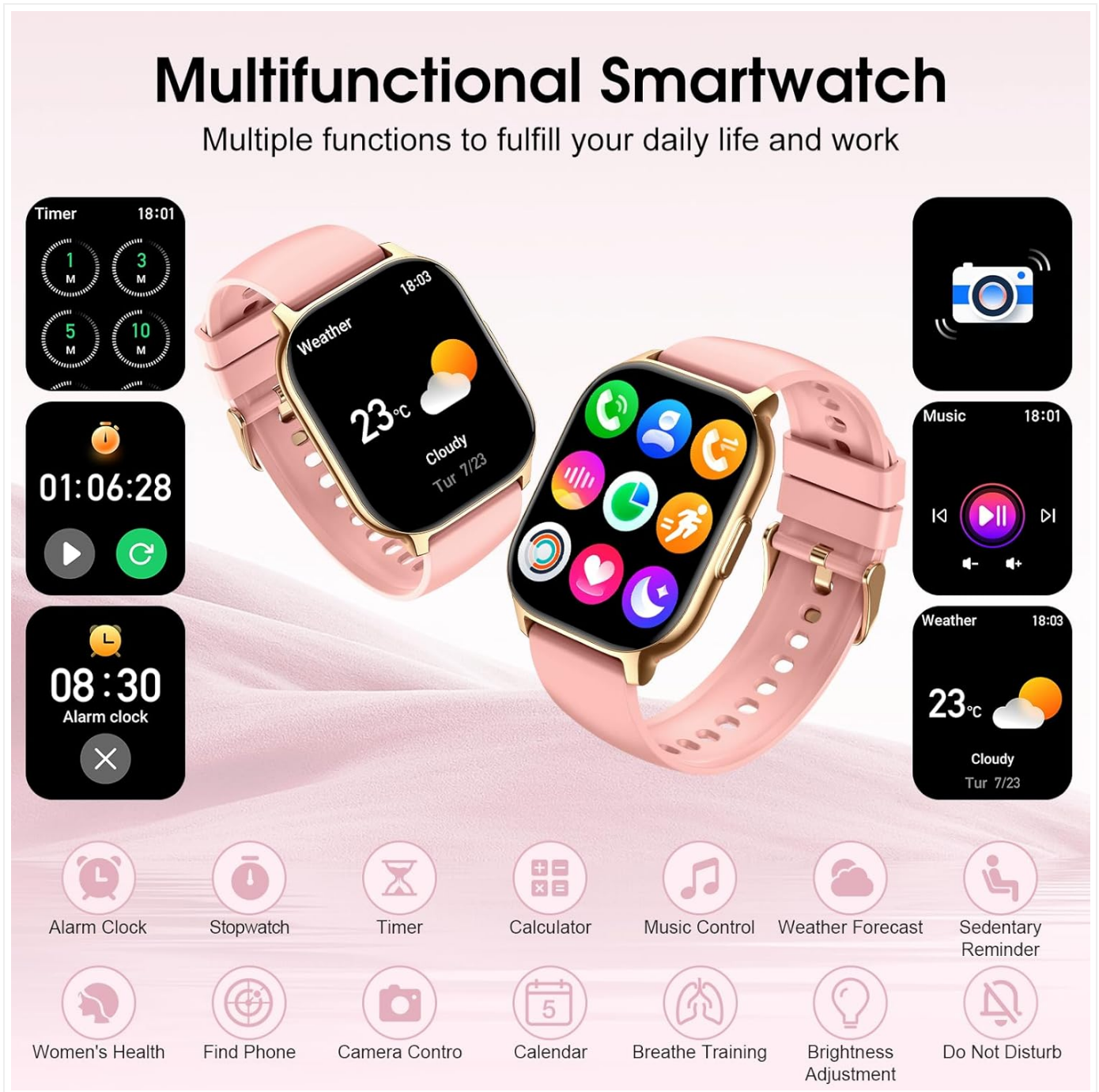
Image: A smart watch showcasing multiple functions including timer, weather forecast, alarm clock, music control, and remote photo control. Icons for other features like calculator, find phone, and brightness adjustment are also visible.