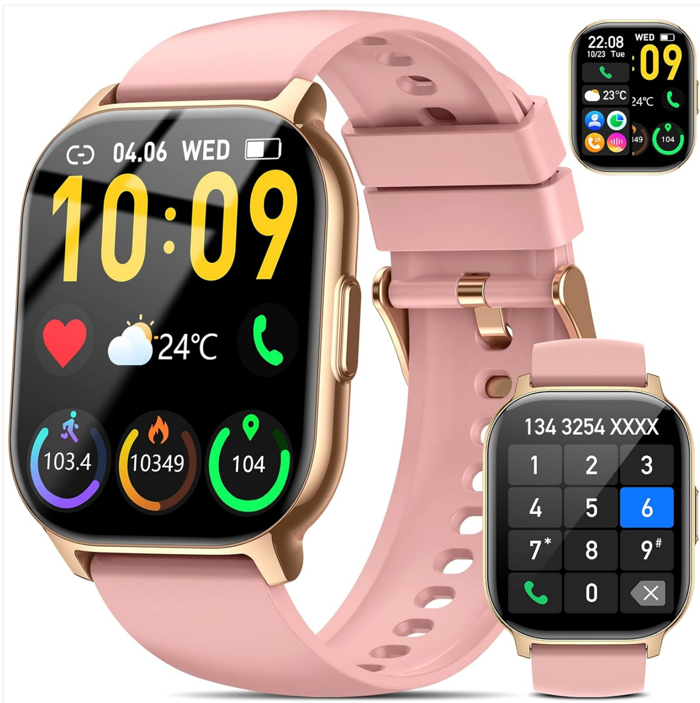
Image: Front view of the BP Doctor P122 Smart Watch, displaying time, date, temperature, and activity metrics. The watch features a pink band and a gold-colored casing.