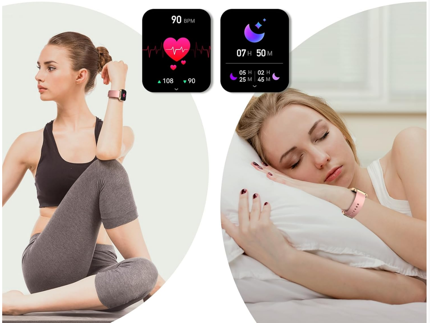
Image: A smart watch displaying heart rate data (BPM) and sleep duration with different sleep stages (light, awake, deep sleep). Two individuals are shown, one meditating and one sleeping, illustrating the health monitoring features.