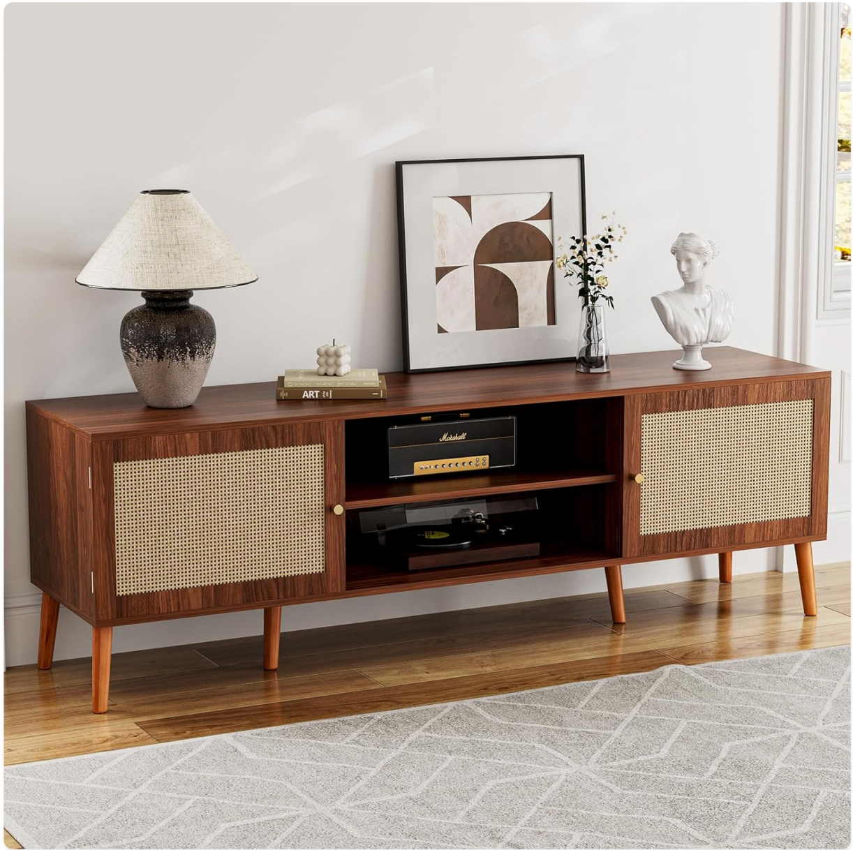
Figure 1: ZttRiee TV Stand (Walnut)