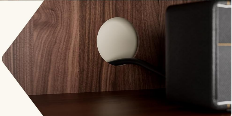
Figure 4: Rattan Door, Golden Handle, and Cable Management

The large management cable holes allow tidy and convenient passage of cables.