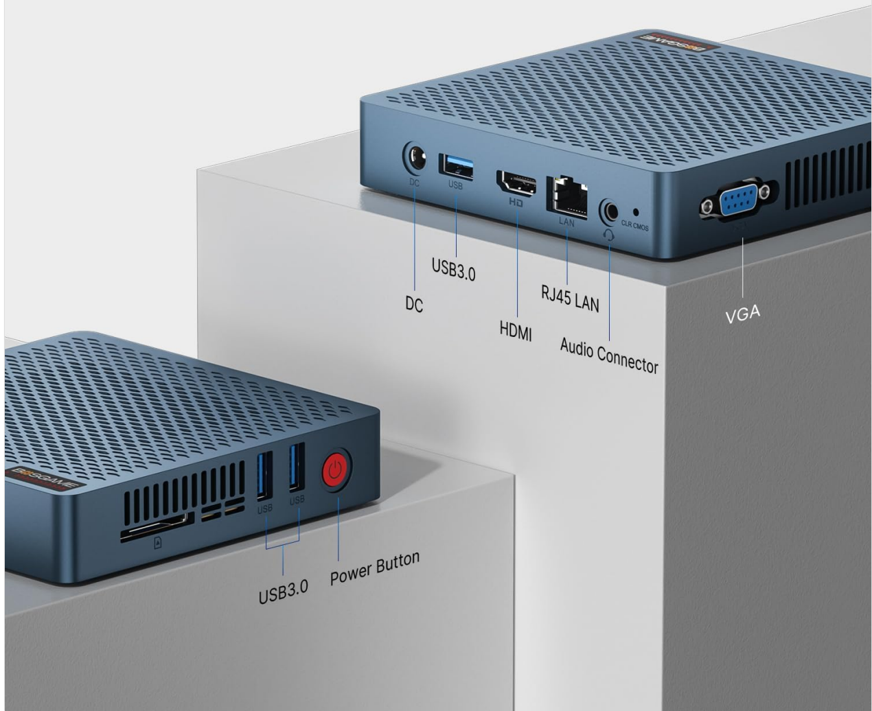
Image: Detailed view of the BOSGAME Mini PC's ports, including DC power input, USB 3.0, HDMI, RJ45 LAN, Audio Connector, VGA, and Power Button.