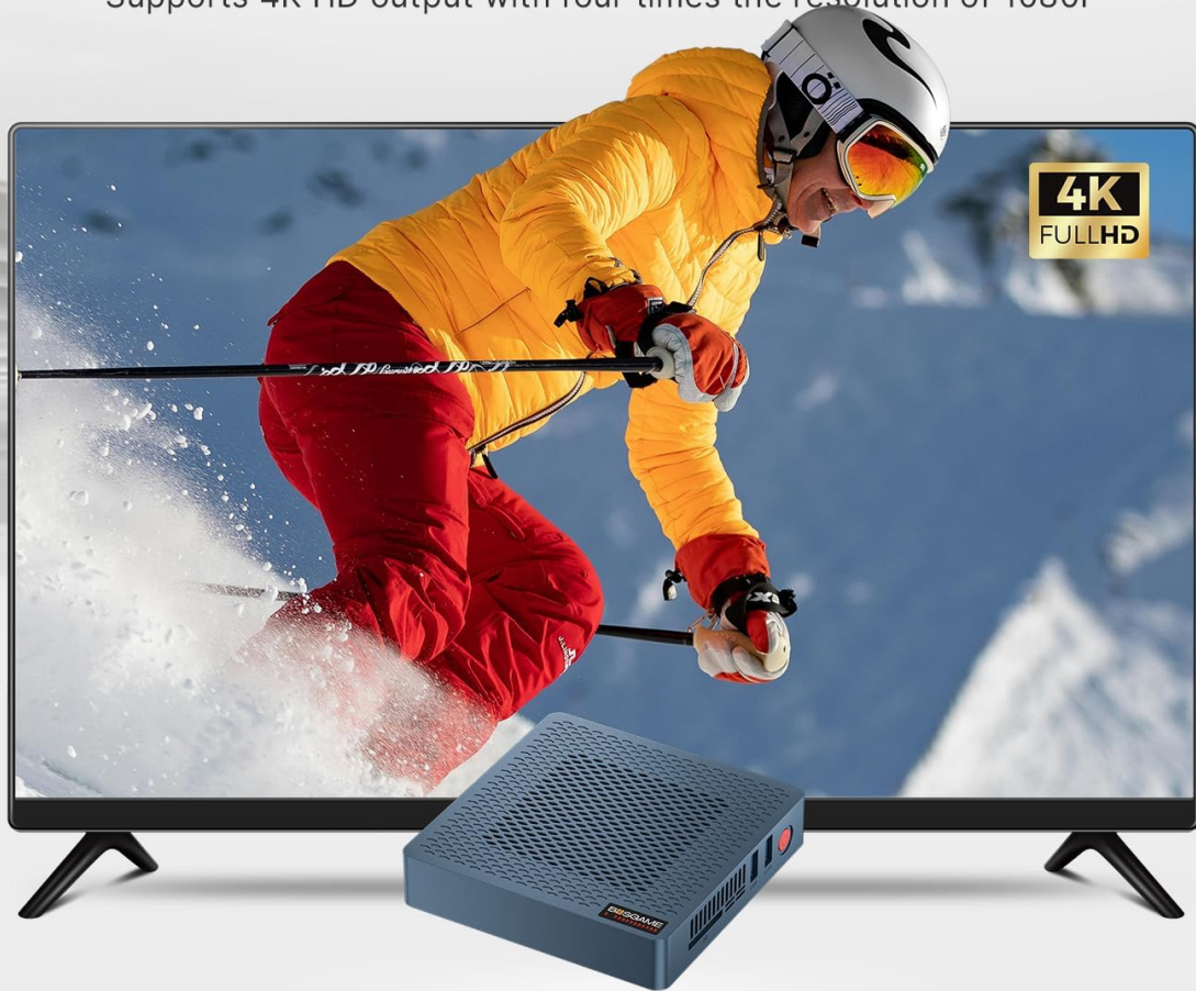
Image: The BOSGAME Mini PC connected to a television displaying 4K content, highlighting its 4K@60Hz UHD output capability.

Supports 4K HD output with four times the resolution of 1080P