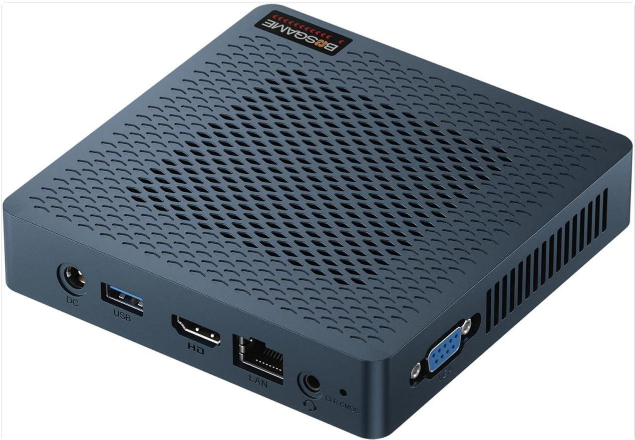
Image: The BOSGAME Fanless Mini PC AG40 N4020, showcasing its compact design and various ports.