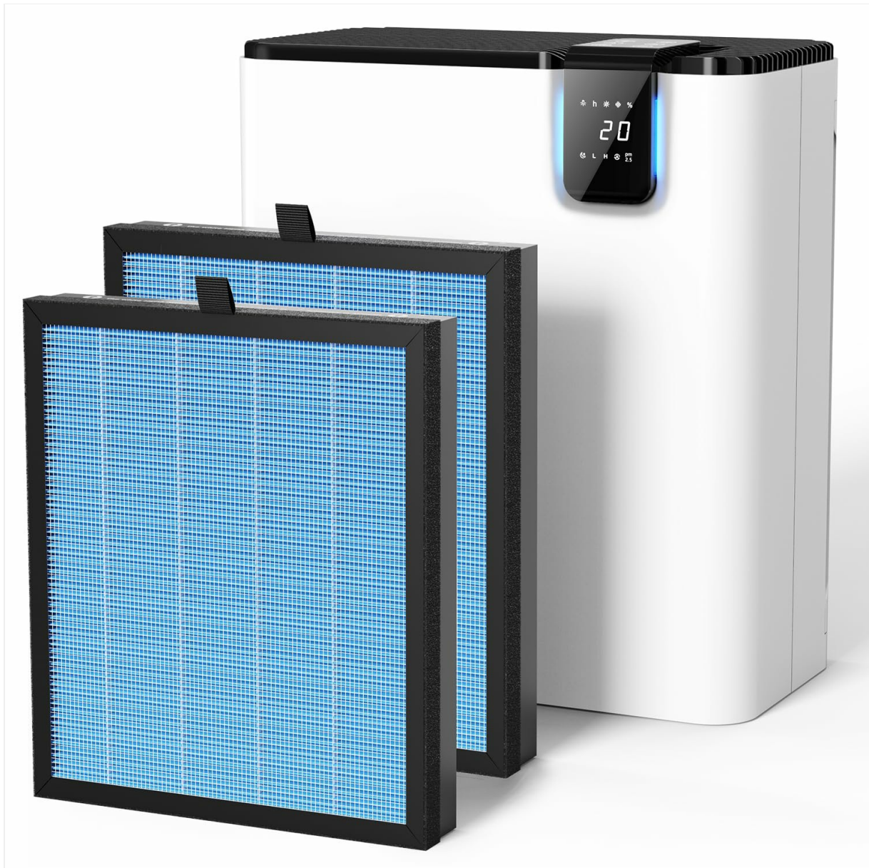
Figure 2.1: POMORON MJ005H Air Purifier