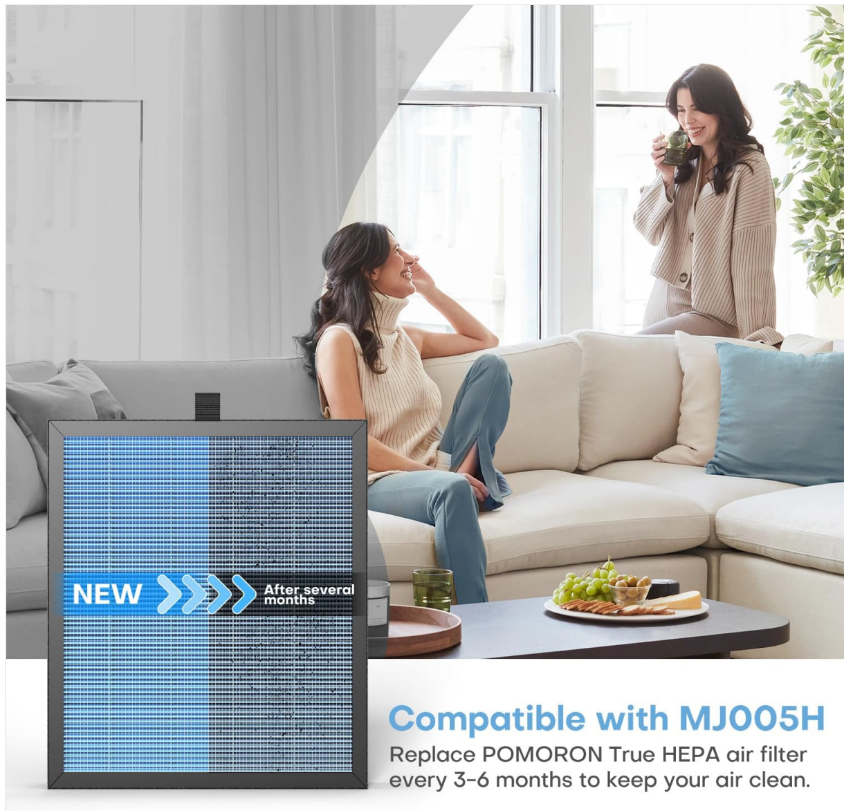
Figure 5.1: Filter condition comparison (New vs. Used)

The air filter should be replaced every 3-6 months. This interval may vary depending on usage frequency and air quality in your environment. The unit will typically indicate when a filter change is due.