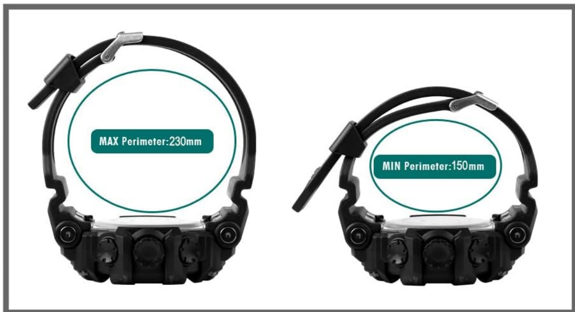
Image: Detailed product parameter diagram, including dimensions and material information.