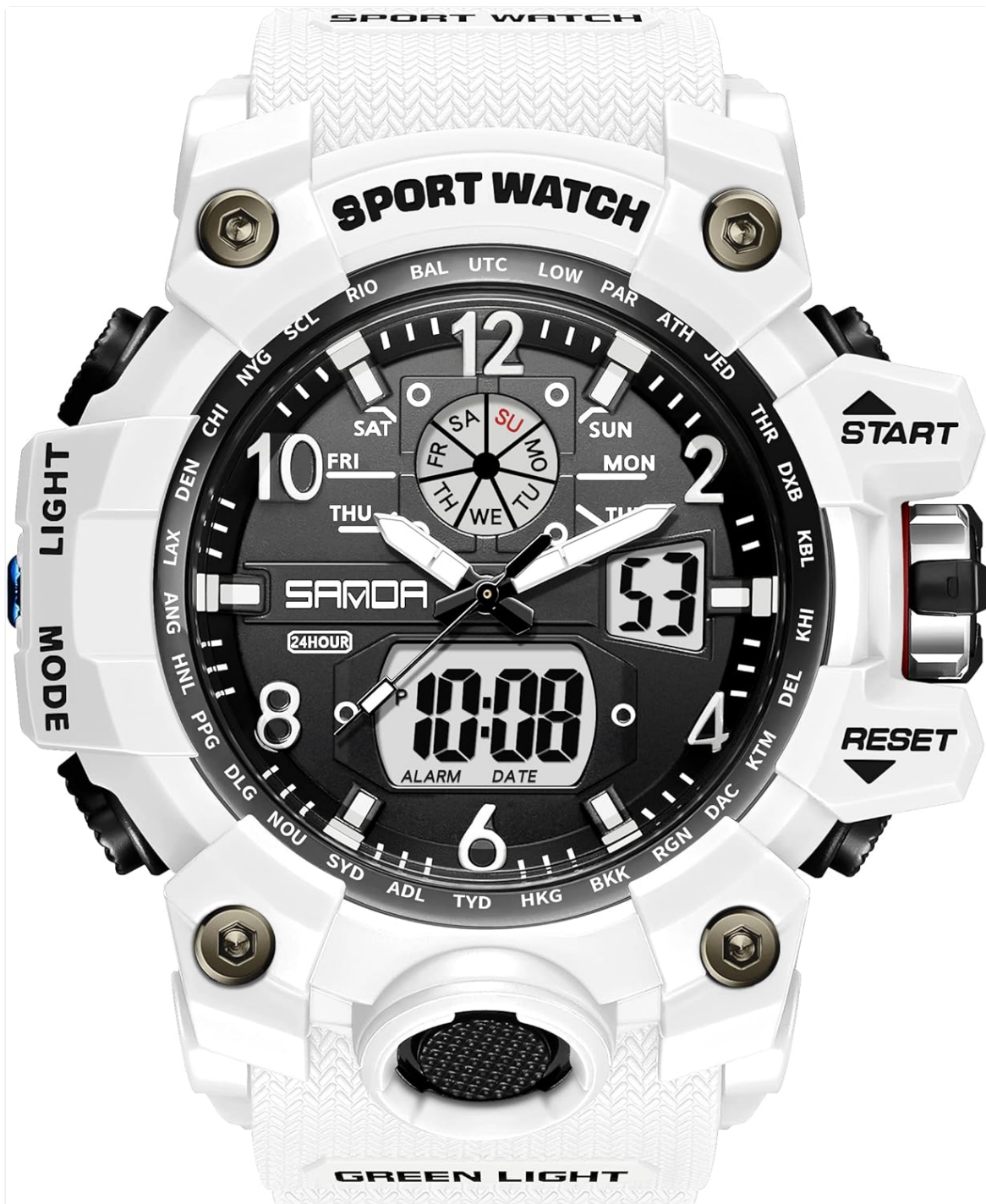
Image: Front view of the KXAUTO Sports Watch, highlighting its large dial and rugged design.