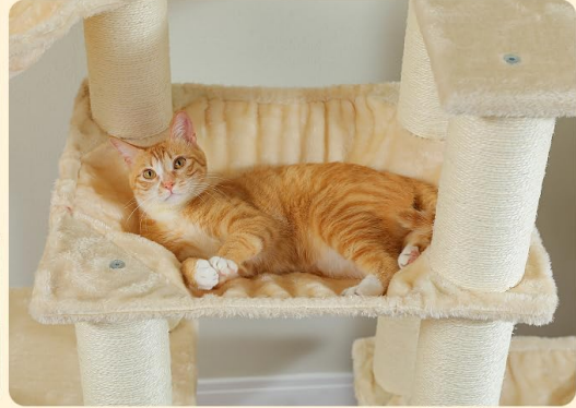
Image 5.1: Cats utilizing the enlarged resting spots, such as the spacious condo, comfortable hammocks, and elevated perches.