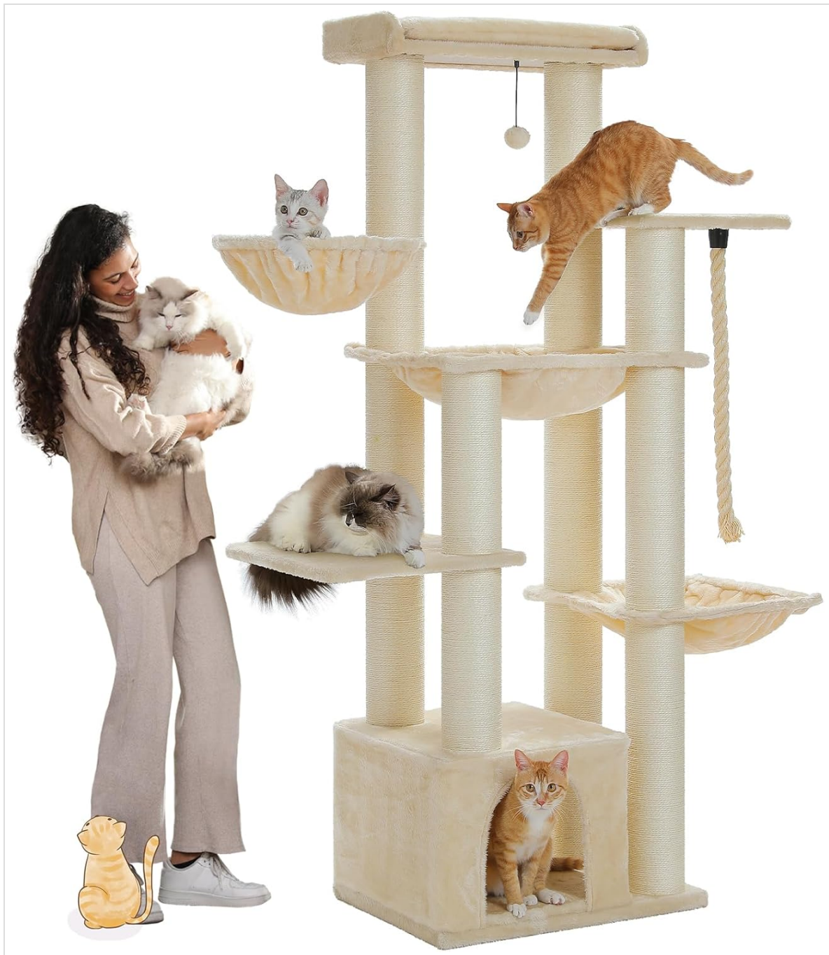
Image 1.1: Overview of the MUTTROS 67-Inch Tall Cat Tree, showcasing its multi-level design and various features for cats.