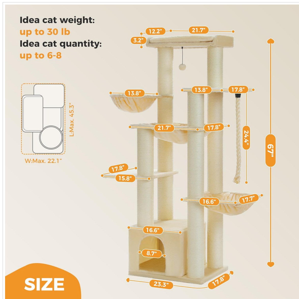
Image 4.1: Dimensional diagram of the cat tree, indicating height, width, and depth of various components.

fastened before allowing your cats to use the tree. The anti-tip kit should be installed as directed in the assembly manual to prevent accidental tipping.