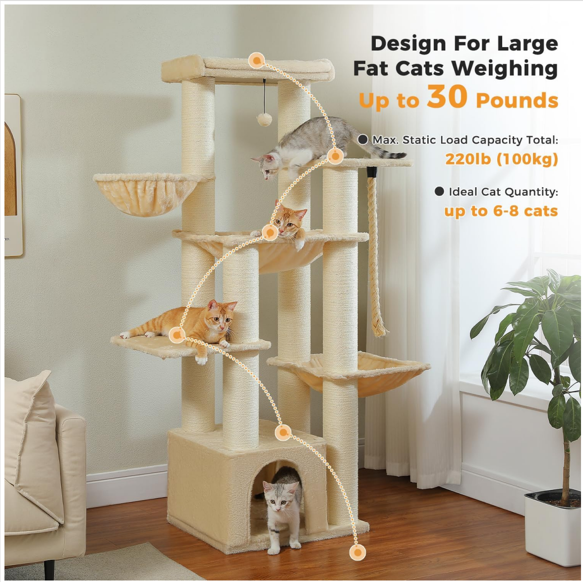
Image 8.1: Visual representation of the cat tree's capacity, designed for large cats and supporting a total weight of 220 lbs.