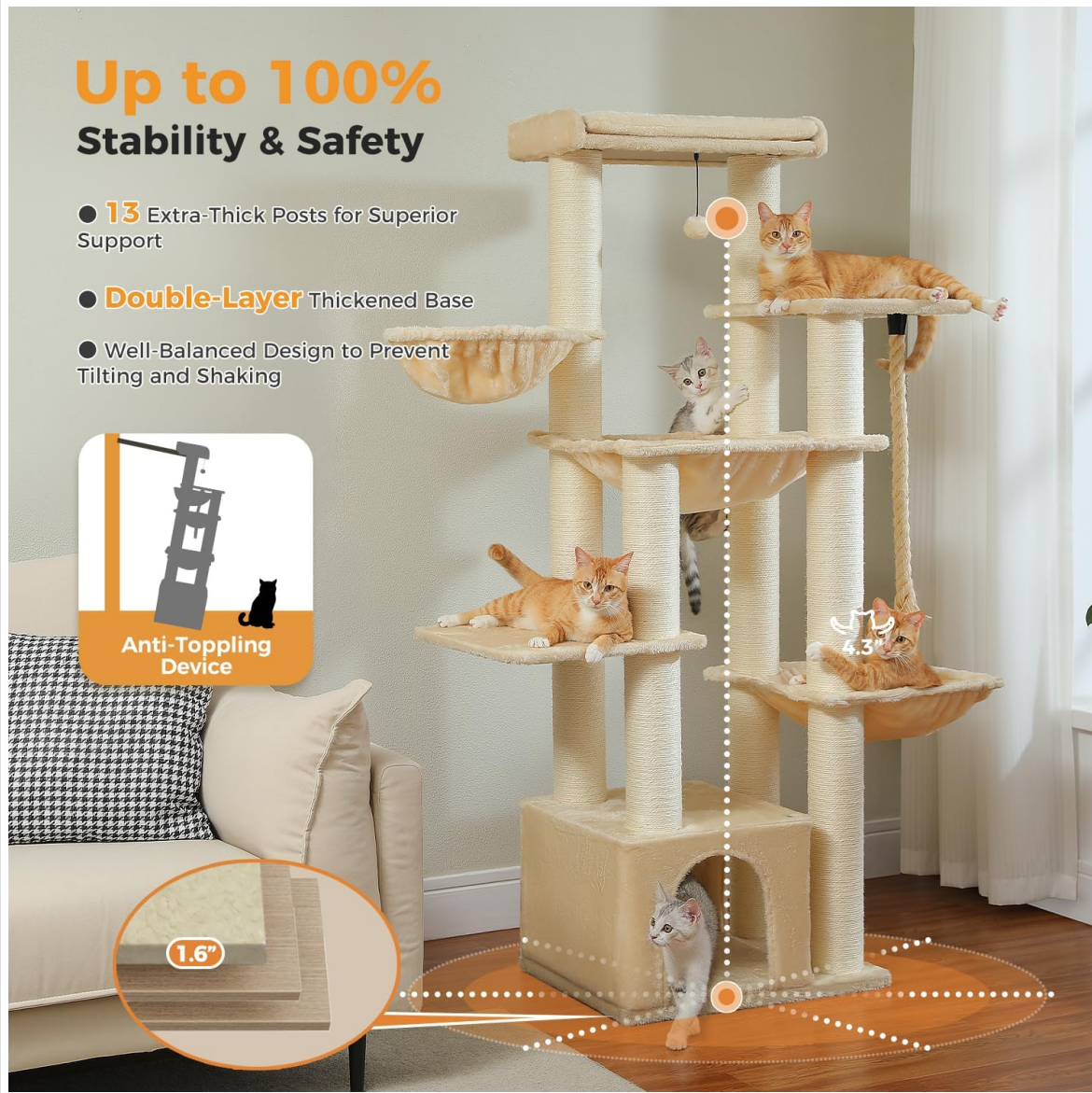
Image 2.1: Illustration of the cat tree's stability features, including 4.3-inch thick sisal posts, a double-layered base, and the anti-toppling device for secure installation.