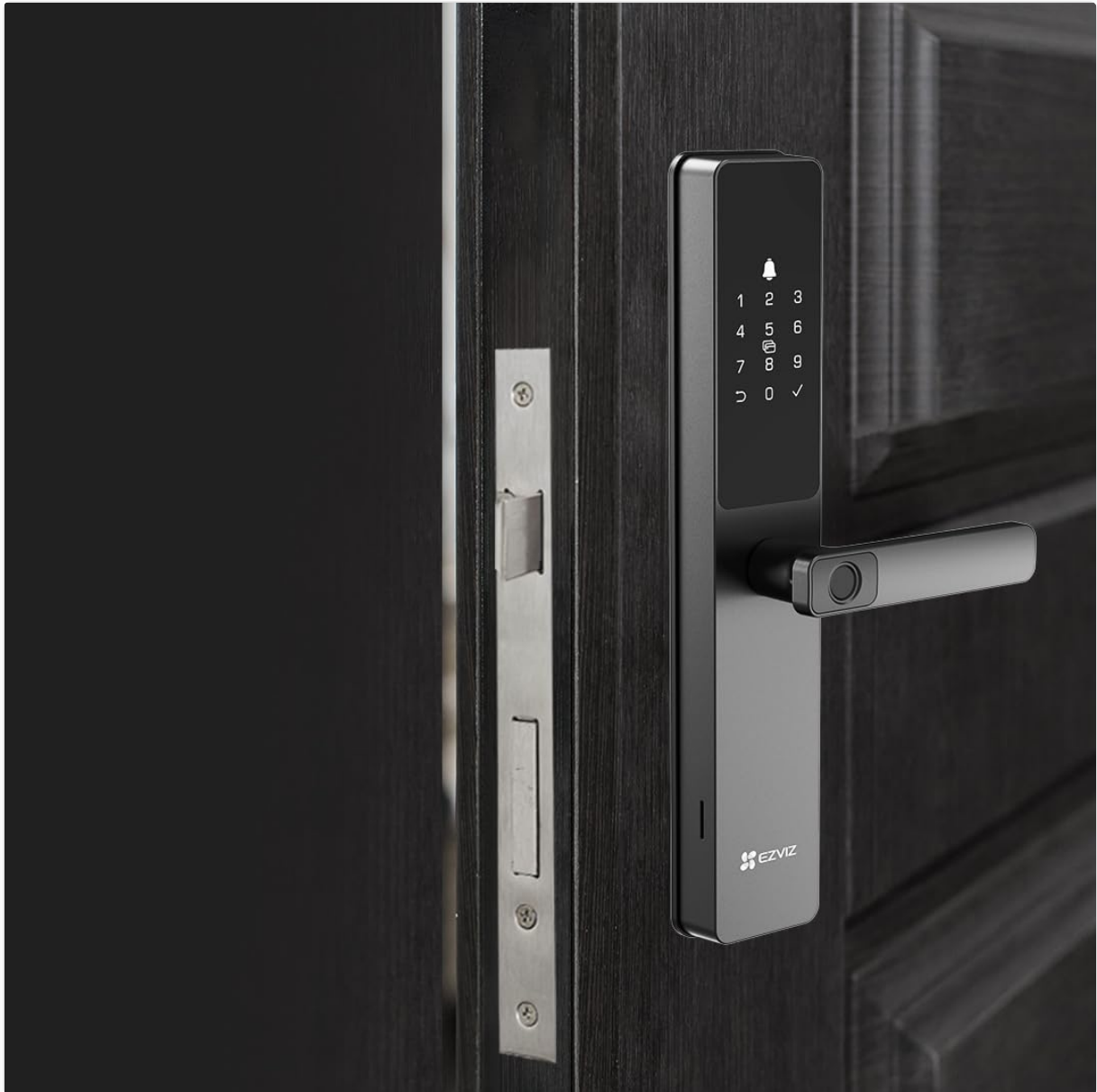
Image: The EZVIZ DL05 Smart Digital Lock installed on a dark wooden door, highlighting its modern aesthetic.