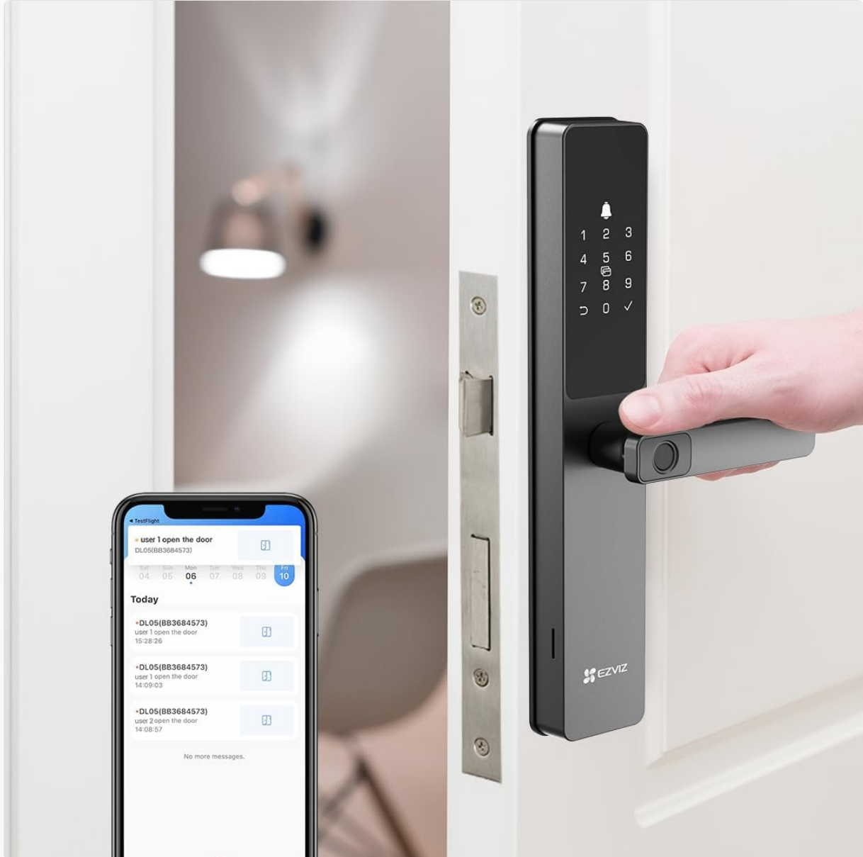
Image: The EZVIZ DL05 lock installed on a door, with a smartphone displaying real-time notifications from the EZVIZ app, showing door open events.

Download the EZVIZ app from your smartphone's app store. Follow the in-app instructions to pair your DL05 lock with your account via Wi-Fi (2.4GHz) or Bluetooth. The app allows for easy user management, adding fingerprints, passwords, and proximity cards.