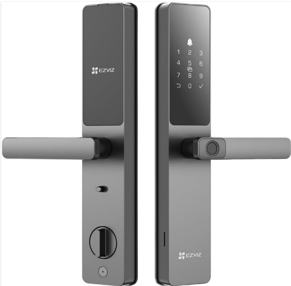
Image: The EZVIZ DL05 Smart Digital Lock, showcasing its sleek front and rear panels.