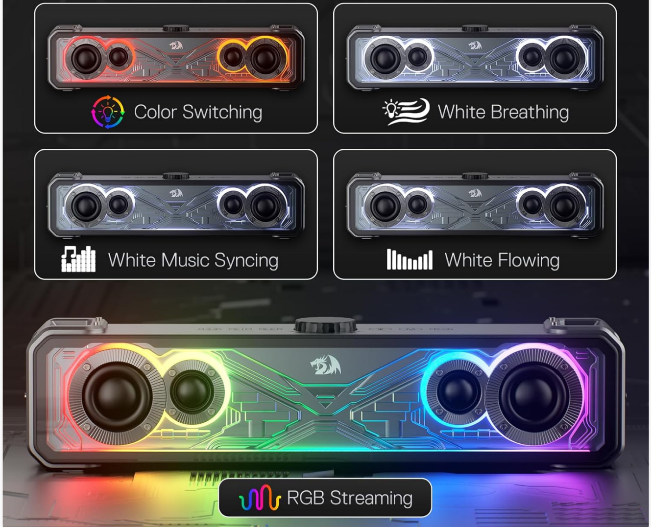
Image 5.2: Examples of the touch-control backlit modes, including static colors, breathing effects, music synchronization, and flowing RGB patterns.