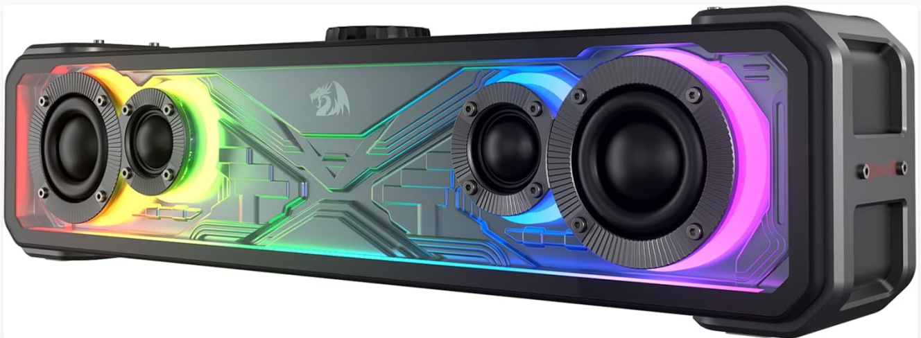
Image 1.1: Front view of the Redragon GS817 RGB Desktop Soundbar, showcasing its design and vibrant RGB lighting.

Thank you for purchasing the Redragon GS817 RGB Desktop Soundbar. This manual provides essential information for setting up, operating, and maintaining your soundbar to ensure optimal performance and longevity. Please read these instructions carefully before use.