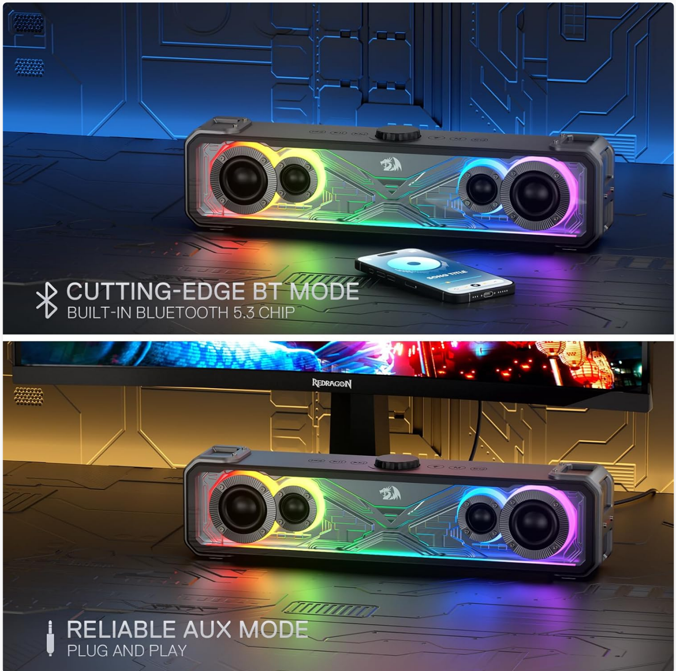
Image 4.1: Visual representation of Bluetooth and AUX connectivity options for the soundbar.

The Redragon GS817 supports two audio input methods: Bluetooth 5.3 and 3.5mm AUX.