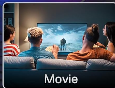
Image 5.1: The three available EQ modes: Games, Music, and Movie, designed to enhance specific audio content.