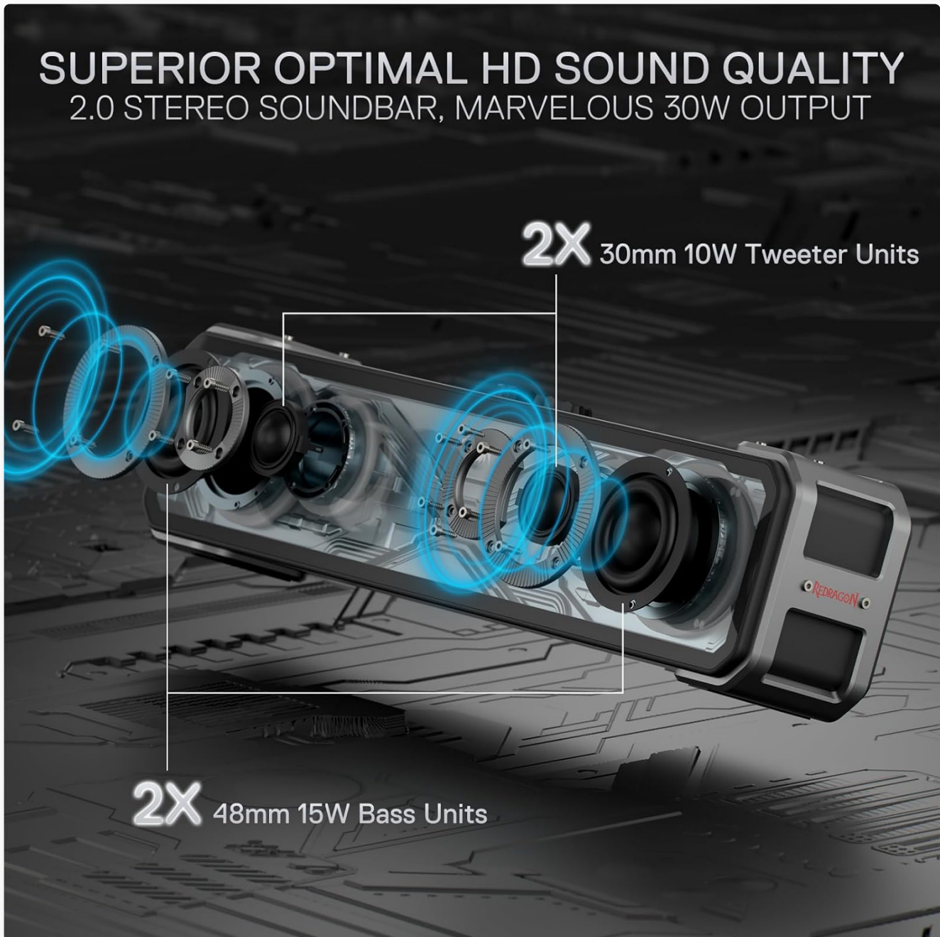
Image 8.1: Internal speaker configuration of the Redragon GS817, detailing tweeter and bass unit specifications.

Below are the technical specifications for the Redragon GS817 RGB Desktop Soundbar: