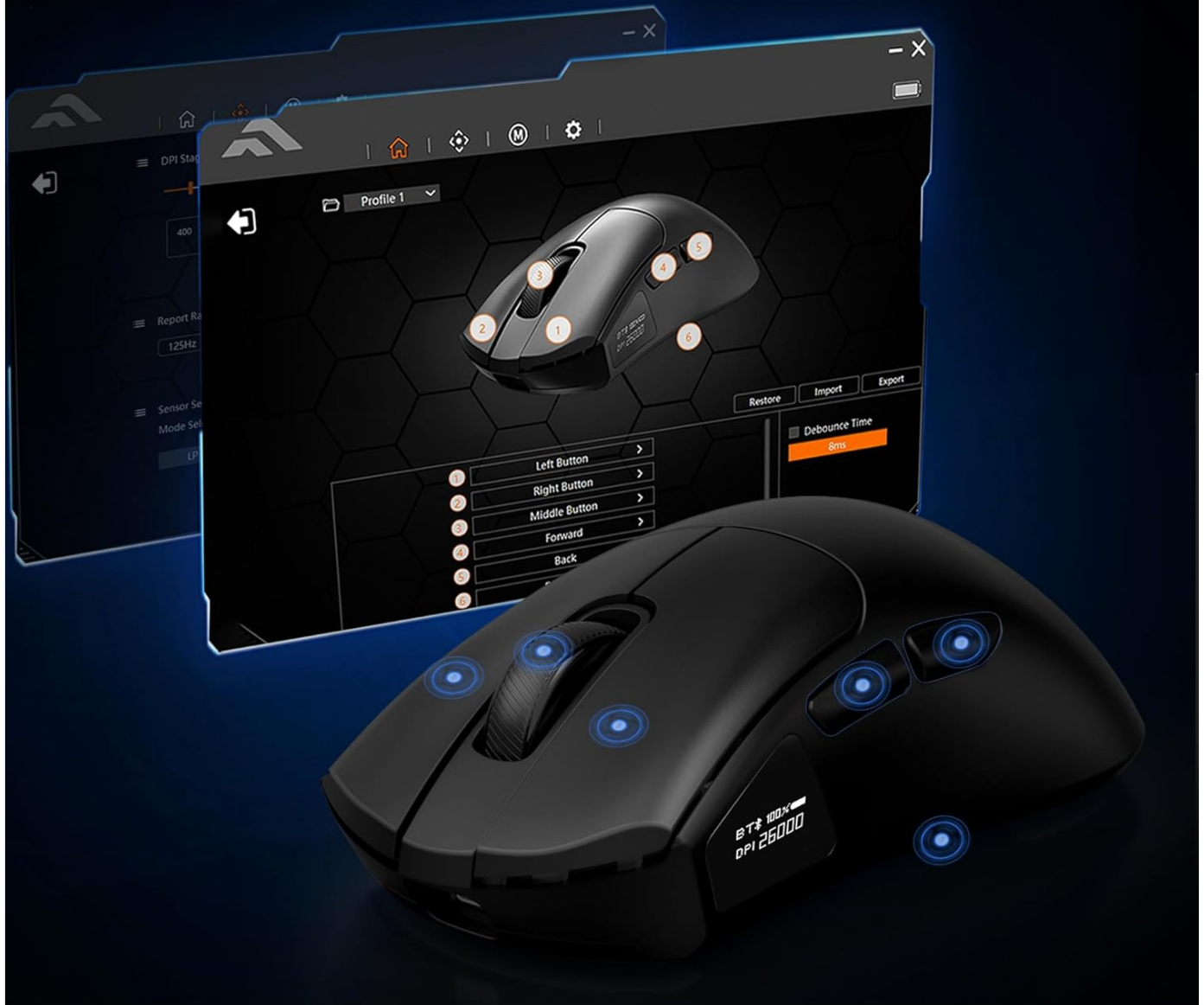
Image: The Elite10 software interface for customizing the 6 programmable buttons.

Easily tailor your personal mouse to your needs