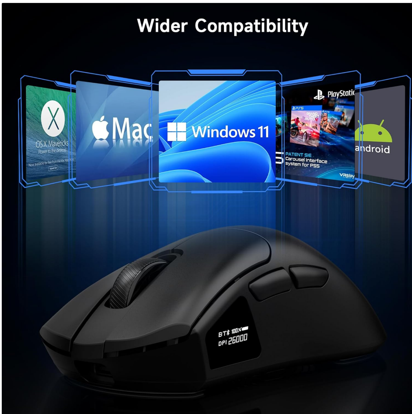
Image: The mouse is compatible with a wide range of operating systems and devices.