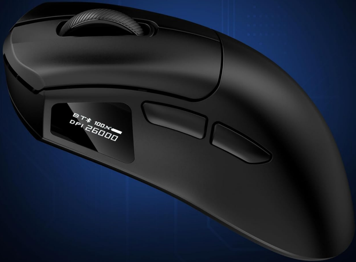
Image: A visual guide to the 8 adjustable and customizable DPI levels.