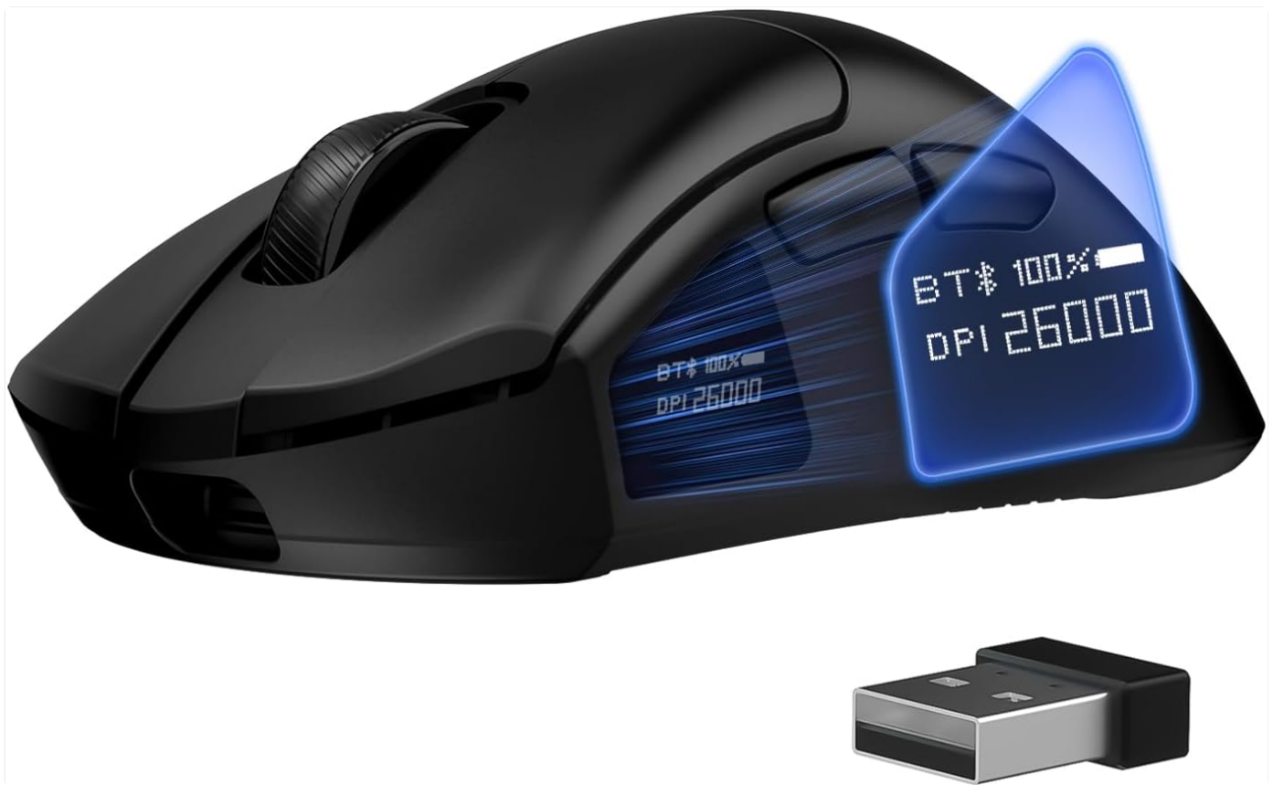
Image: The FFJ Elite10 Wireless Gaming Mouse shown with its USB receiver.