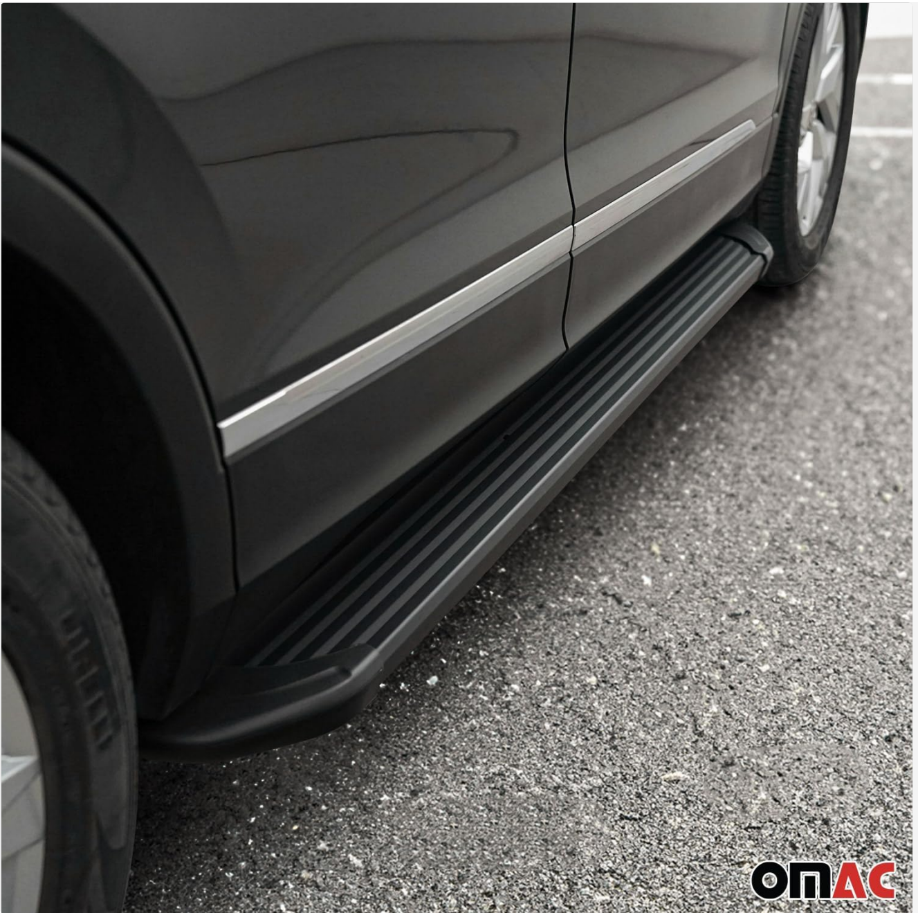
Image: OMAC Side Step installed on a dark grey vehicle. This image demonstrates the sleek integration of the side step with the vehicle's exterior, highlighting its functional and aesthetic contribution.