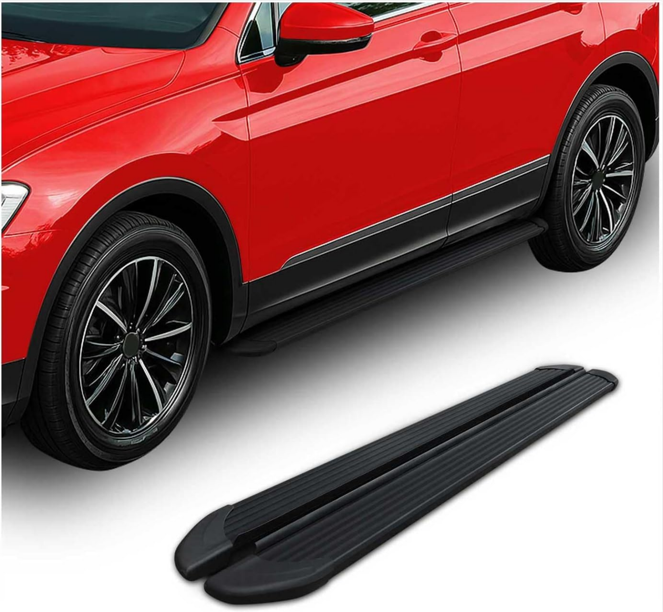
Image: OMAC Side Steps for Ford Maverick 2022-2024. The image displays the black side steps both installed on a red Ford Maverick and as a standalone product, highlighting their design and fit.