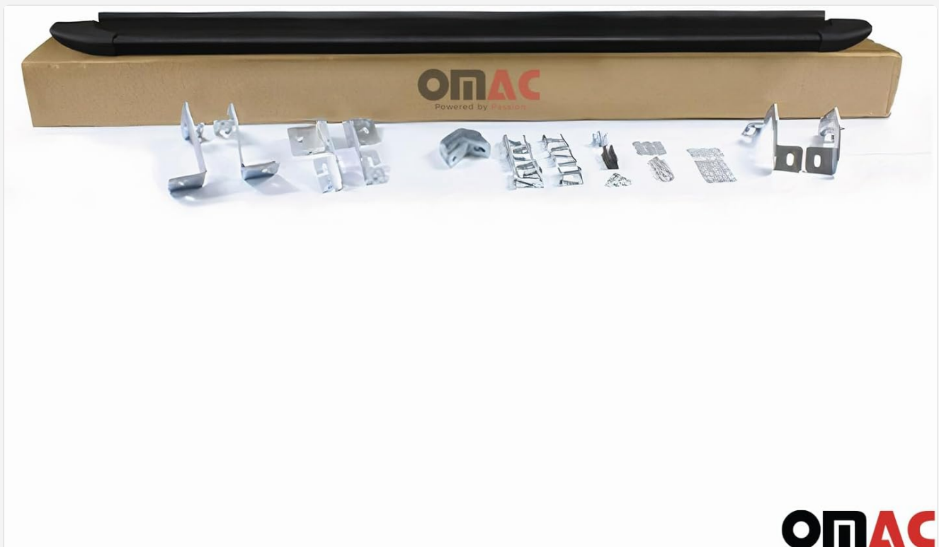
Image: Contents of the OMAC Side Steps package. This image shows the two side steps along with all the necessary mounting brackets and hardware components required for installation.