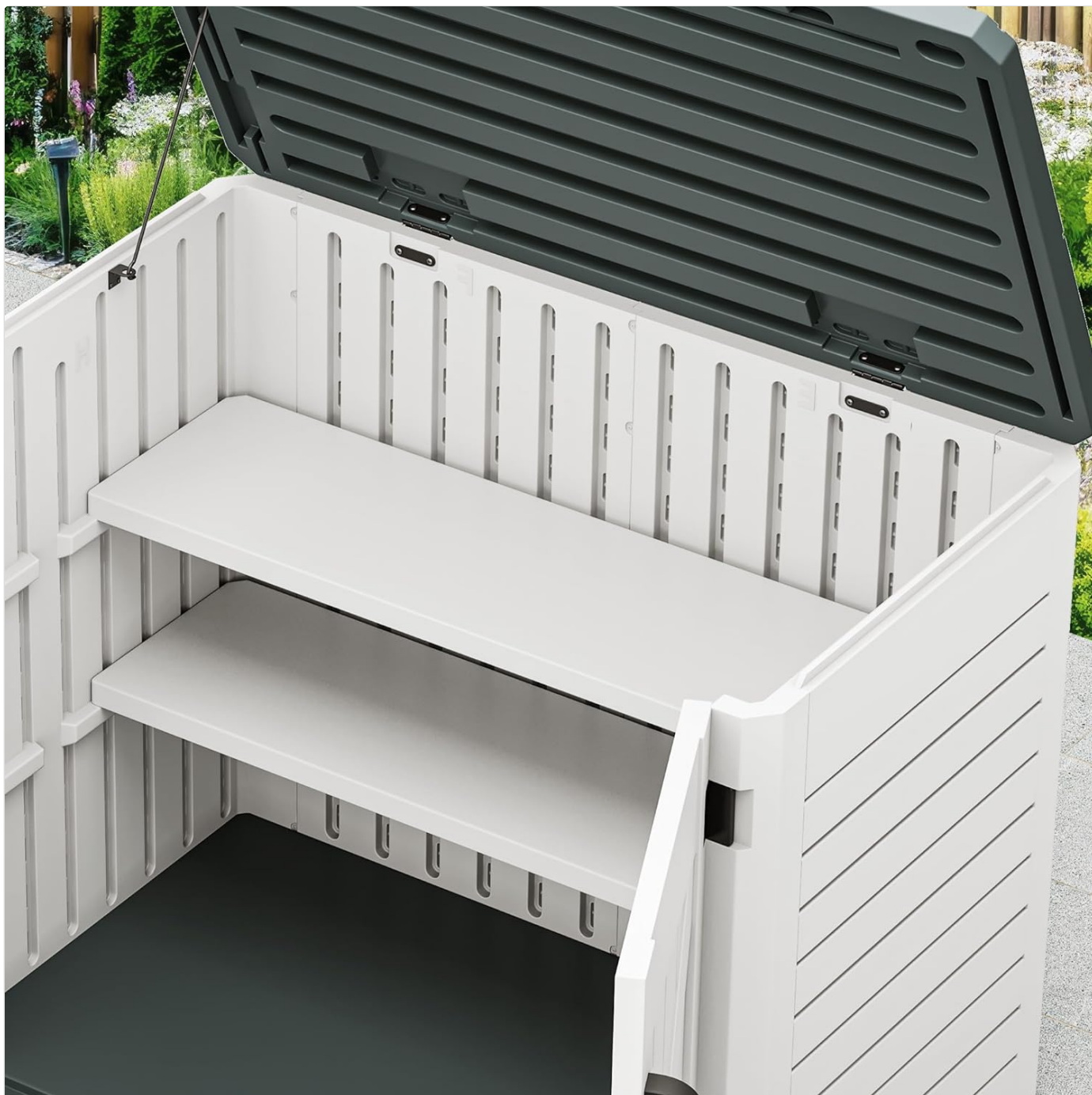
Image: Two shelves installed inside a YITAHOME storage shed.