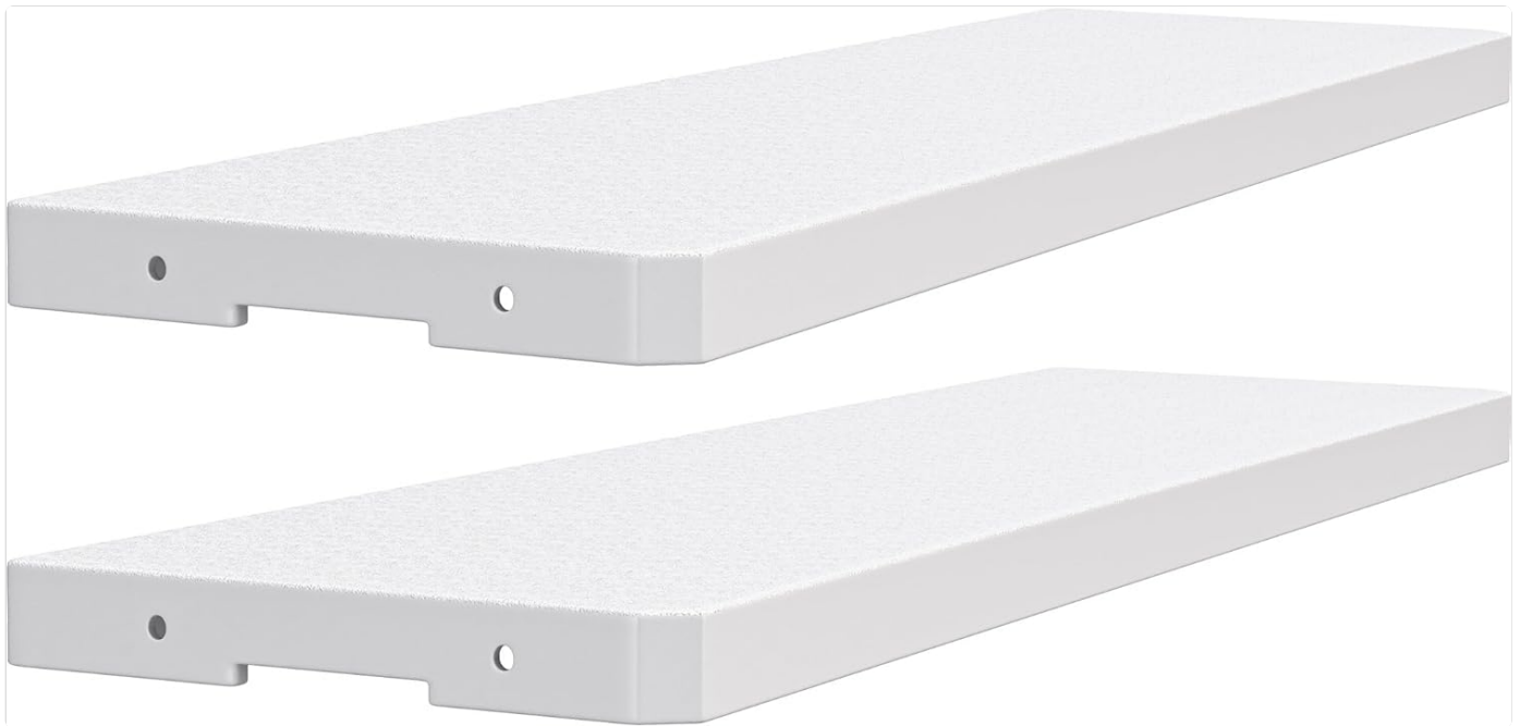
Image: Two gray YITAHOME resin storage shed shelves, ready for installation.