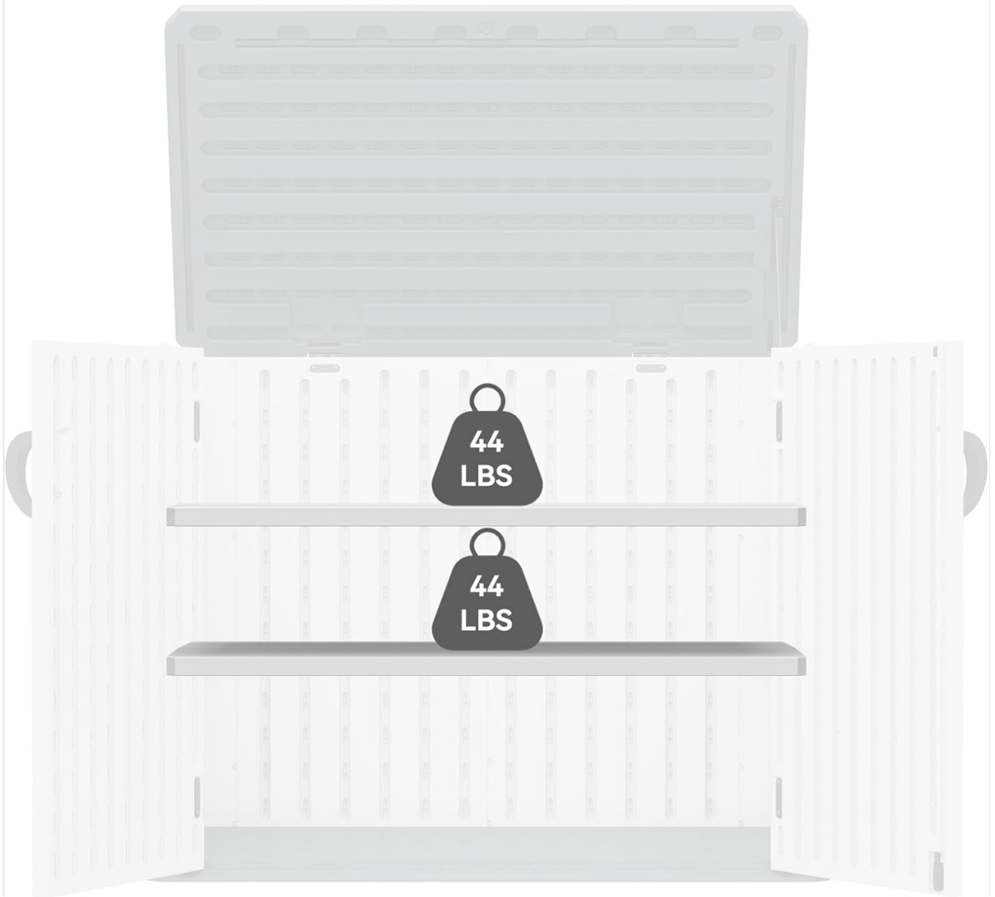
Image: Stable load bearing capacity of 44 lbs per shelf.

The stable structural design prevents swaying when loaded