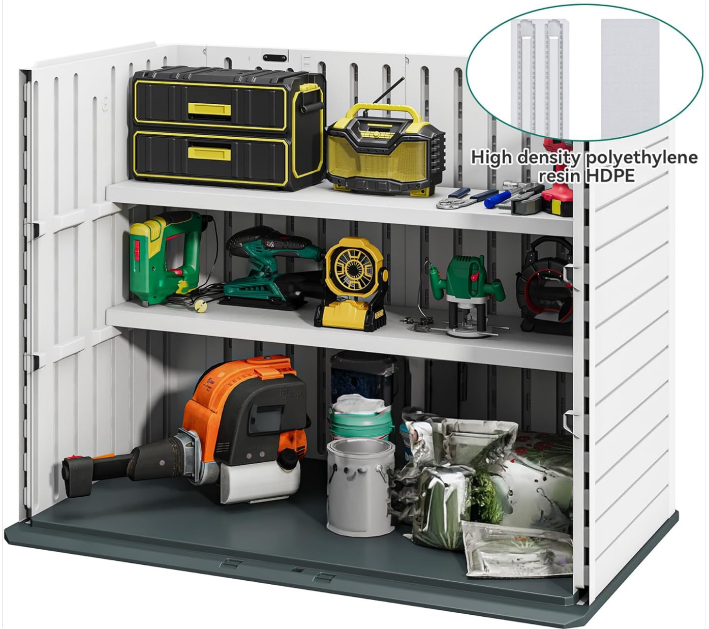
Image: Shelves demonstrating orderly placement of various items.

The beauty and utility of being neat and organized