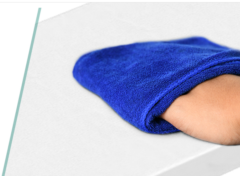
Image: Easy to clean surface of the shelf.

High-density polyethylene resin for easier cleaning