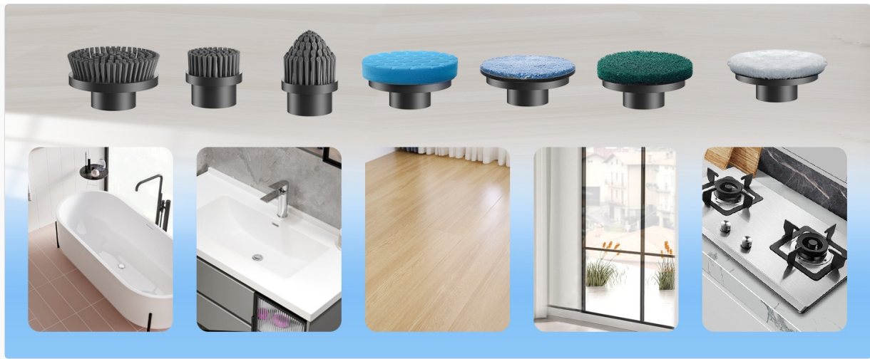
Figure 3: A selection of brush heads and their recommended uses for different surfaces.