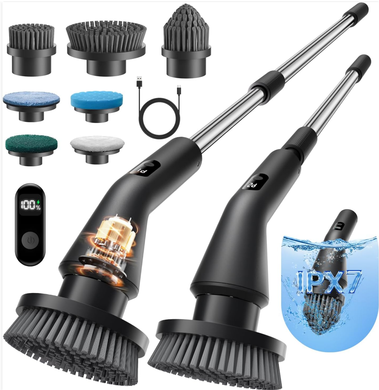
Figure 1: Leebein Electric Spin Scrubber with all included components.