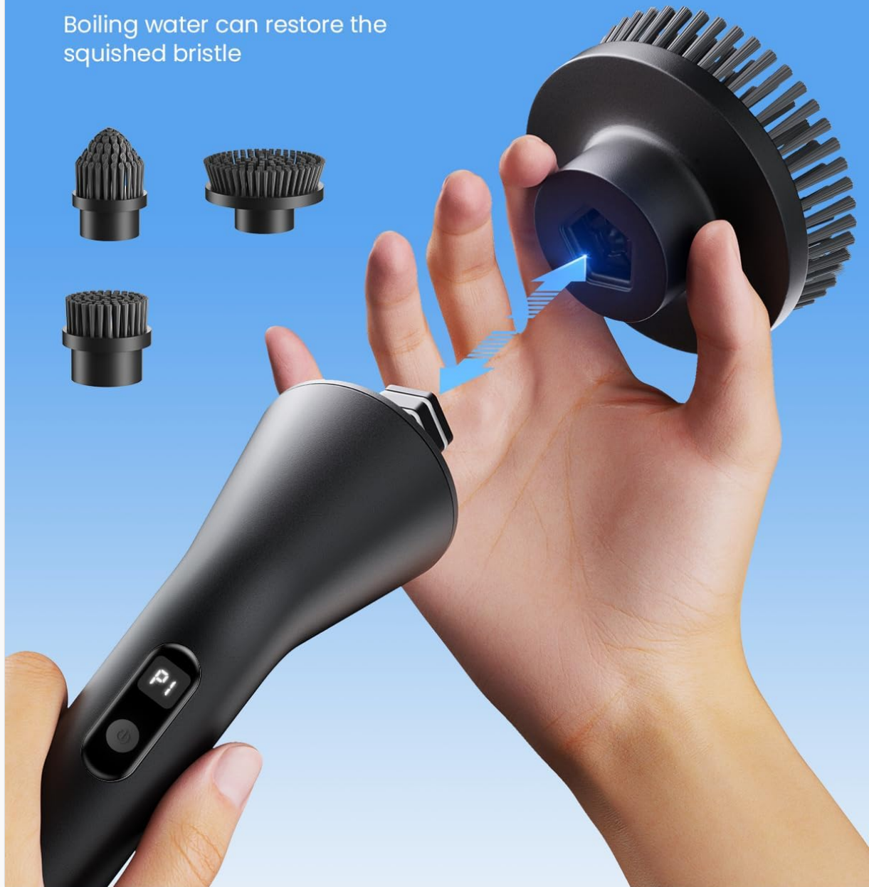
Figure 4: Brush heads are designed for easy attachment and detachment.

Boiling water can restore the squished bristle