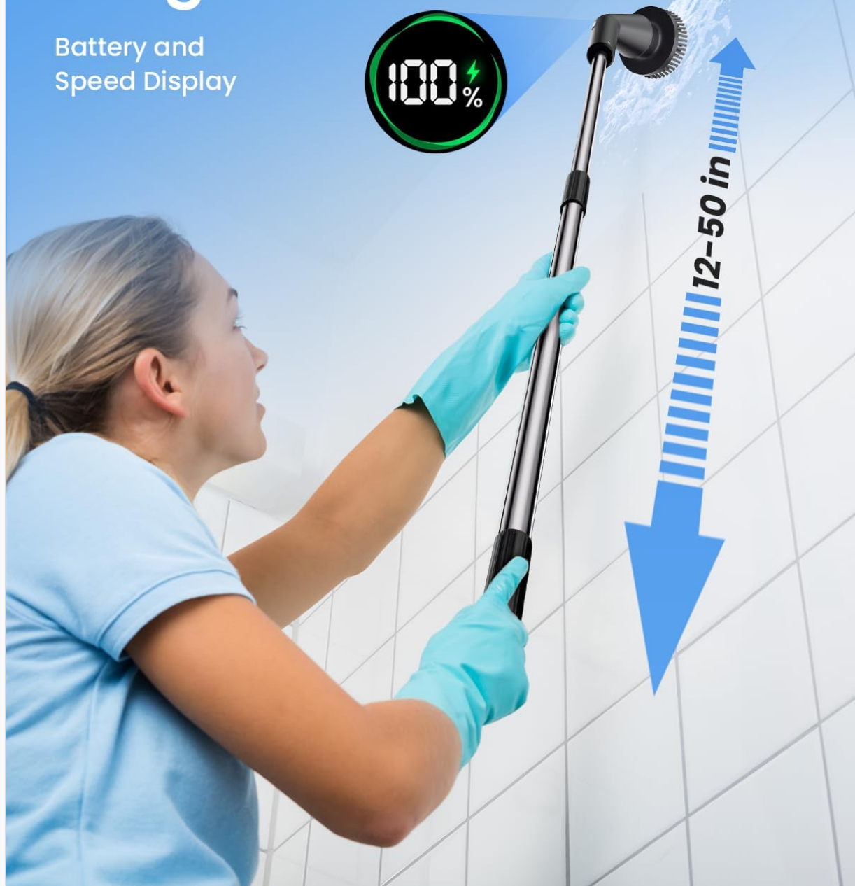
Figure 2: The extendable handle allows for adjustable length from 12 to 50 inches.