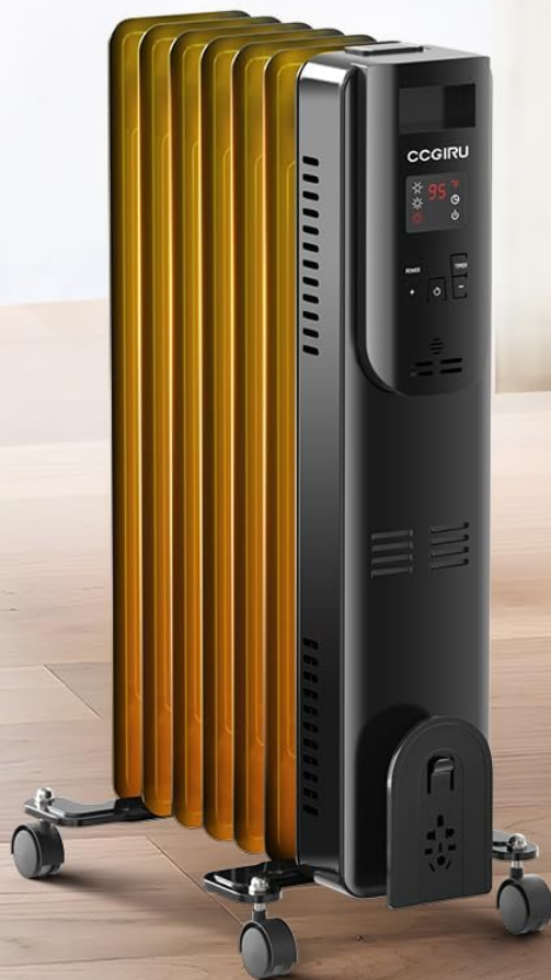
Image: Detailed view of the heater's control panel with LED display and buttons for power, timer, and temperature settings.