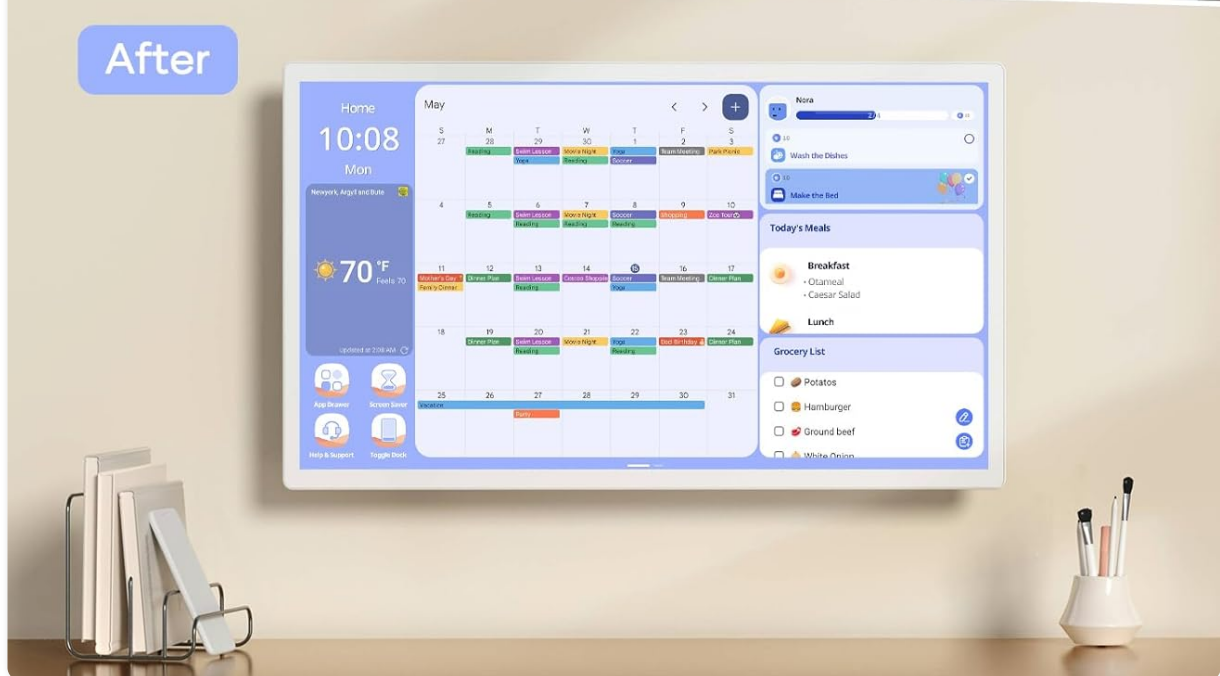
Figure 6: Easy Meal Planner interface.