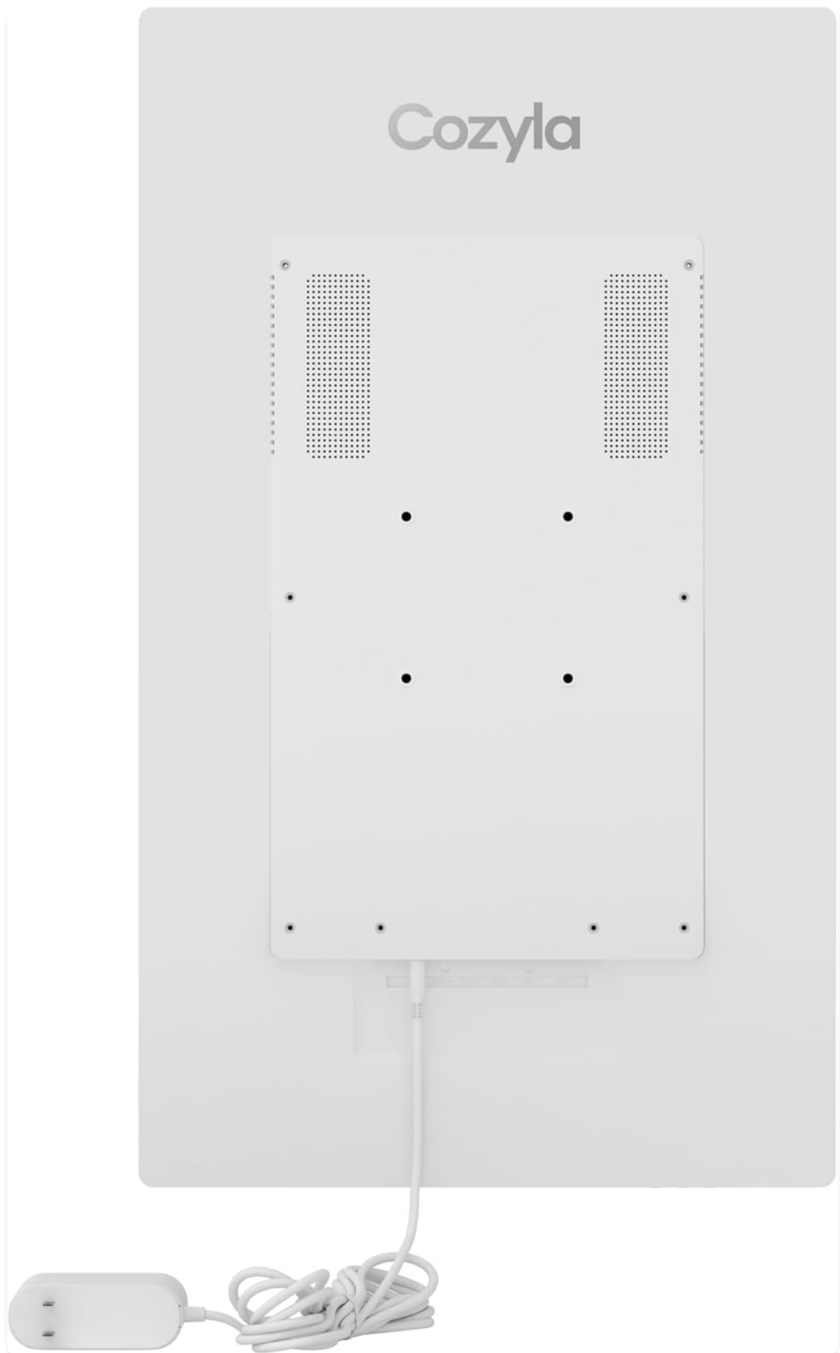
Figure 2: Back of the Digital Calendar+ 2, illustrating the mounting mechanism.