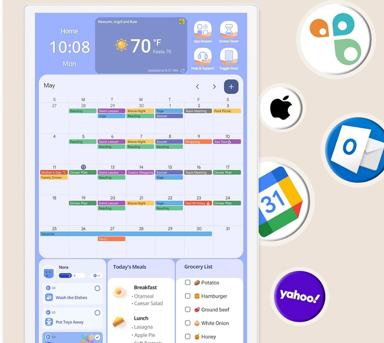
Figure 1: Feature comparison highlighting the comprehensive capabilities of the Cozyla Calendar+ 2.

Seamlessly syncs with your calendar apps