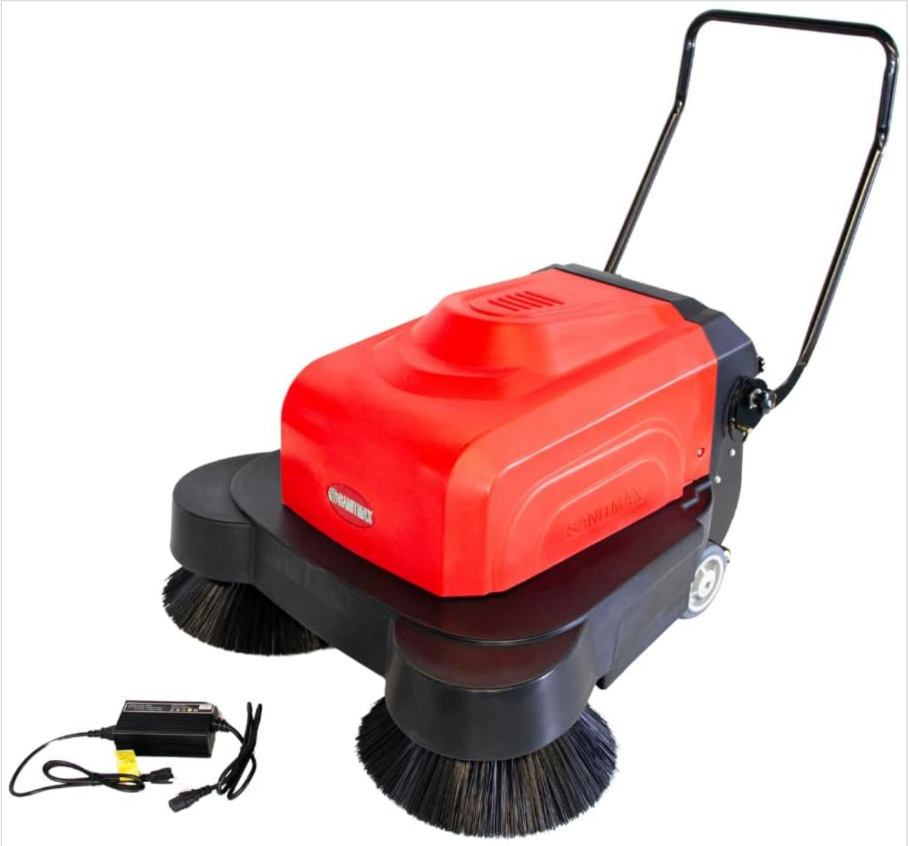
Figure 3.1: Overall view of the SANITMAX floor sweeper with its included battery charger.

Familiarize yourself with the main components of your SANITMAX floor sweeper.