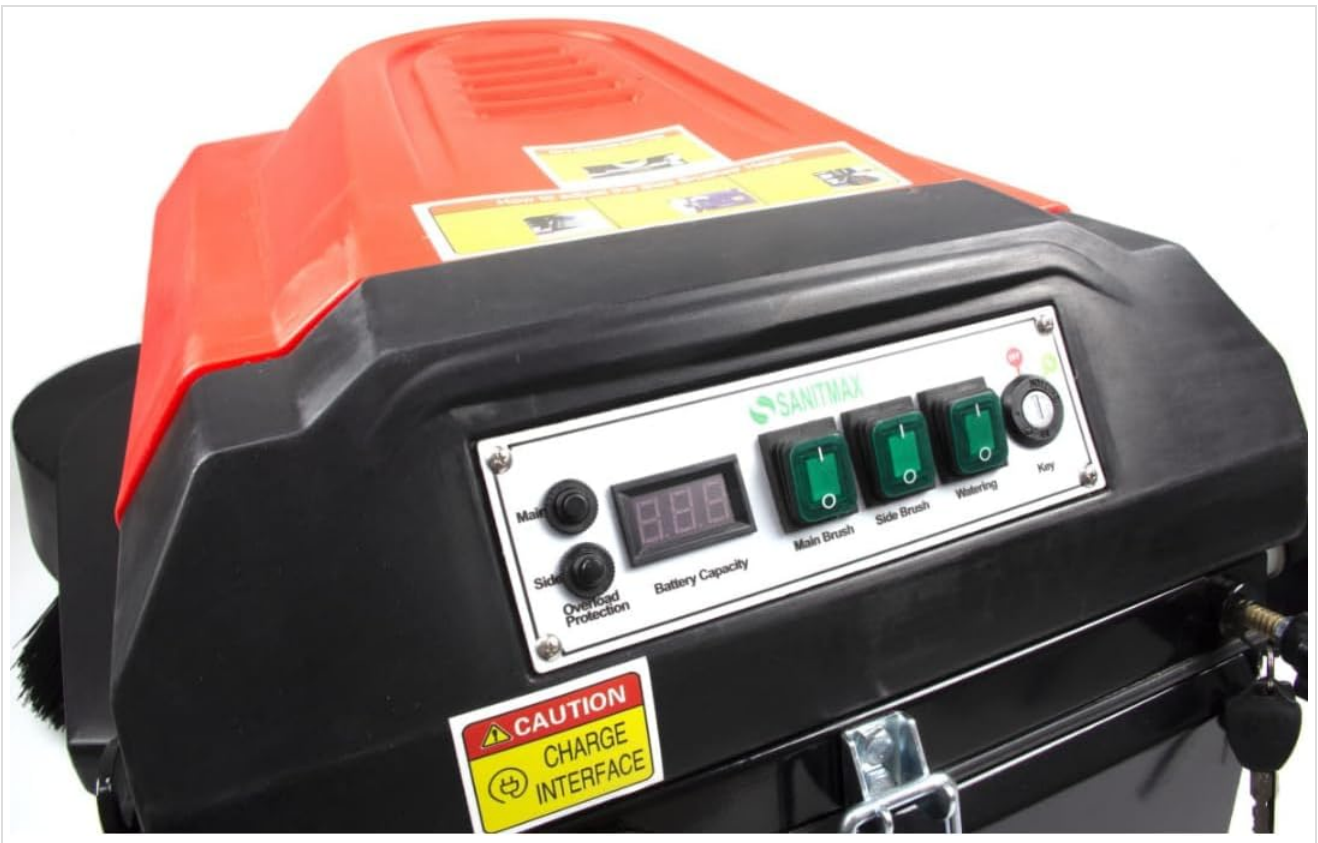
Figure 3.3: Detailed view of the control panel with battery capacity display, main brush switch, side brush switch, watering switch, and key ignition.