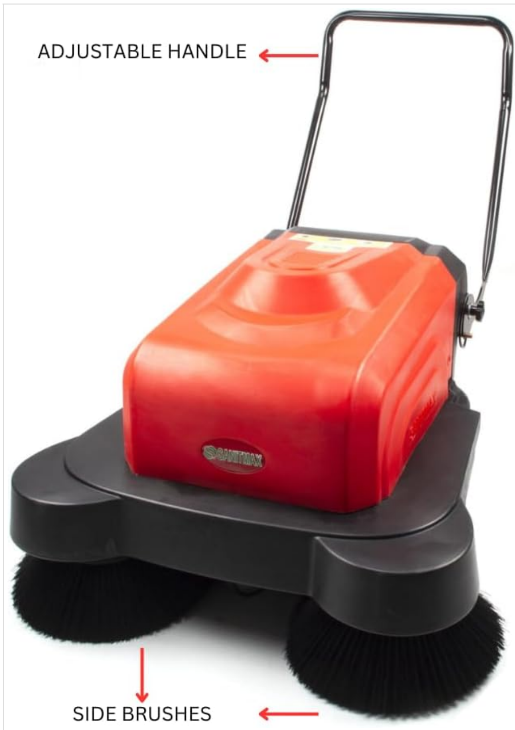
Figure 3.2: Key external components including the adjustable handle and side brushes.