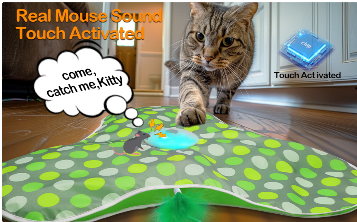
A cat looking intently at the toy, with musical notes and mouse icons indicating the lifelike mouse squeaky sound feature.