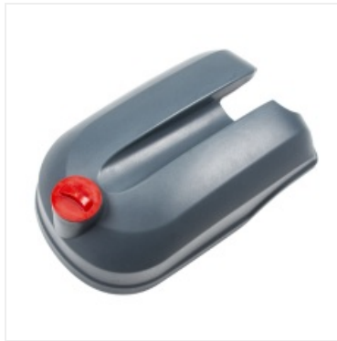
Figure 4.2: Battery and Charger.

This image displays the 24V/52Ah lithium battery pack and its corresponding charger. The battery provides power for up to 2.5 hours of continuous operation, and the charger is used to replenish its power, taking approximately 3.5 hours for a full charge.