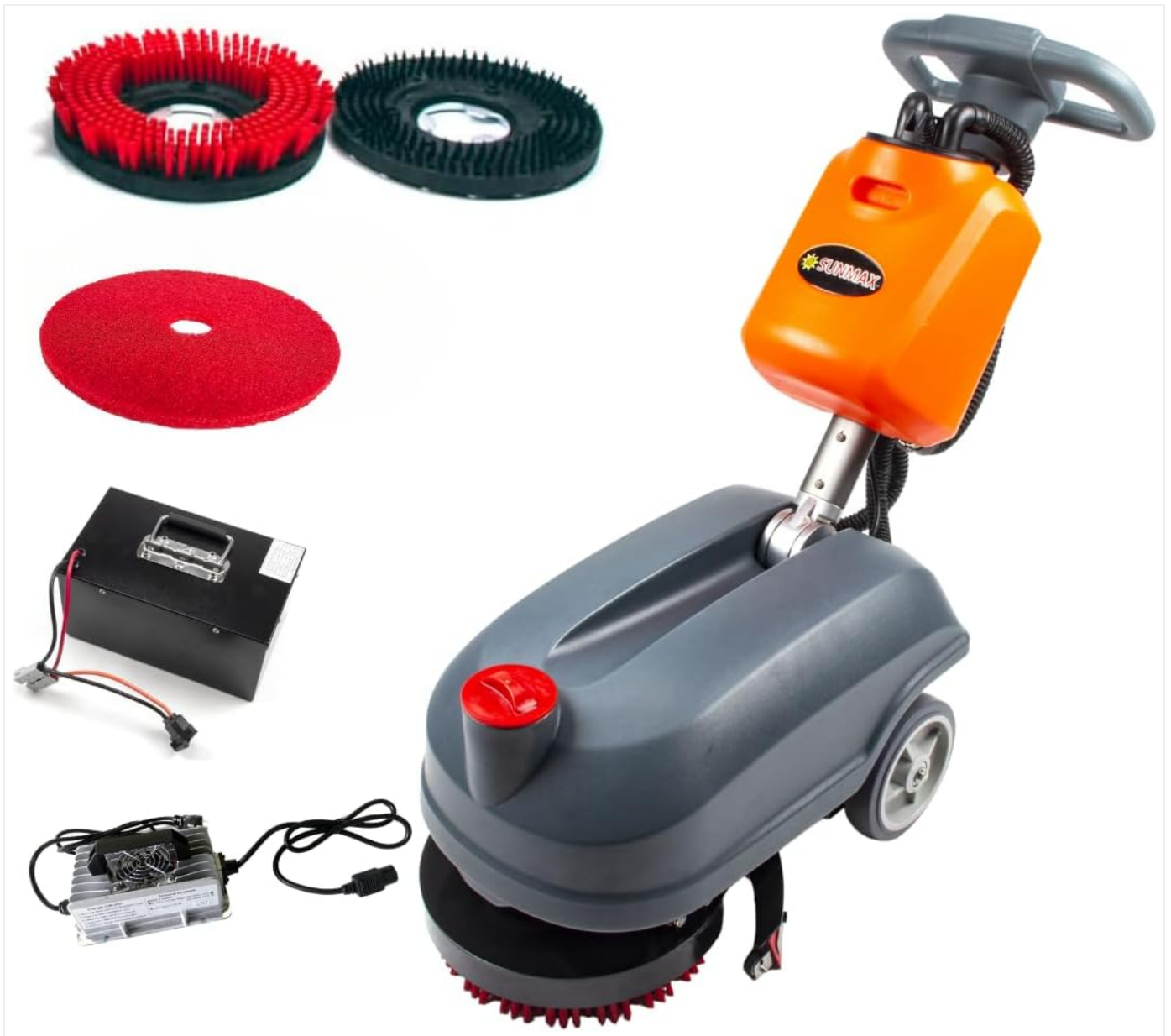
Figure 3.1: Overview of the SUNMAX RT15+ Scrubber Dryer and Included Components.

This image displays the complete SUNMAX RT15+ unit along with its key accessories: the main scrubber body, the detachable solution and sewage tanks, the ergonomic handle with control panel, the cleaning brush, the squeegee assembly, the lithium battery, and the battery charger. These components are essential for the machine's operation and maintenance.