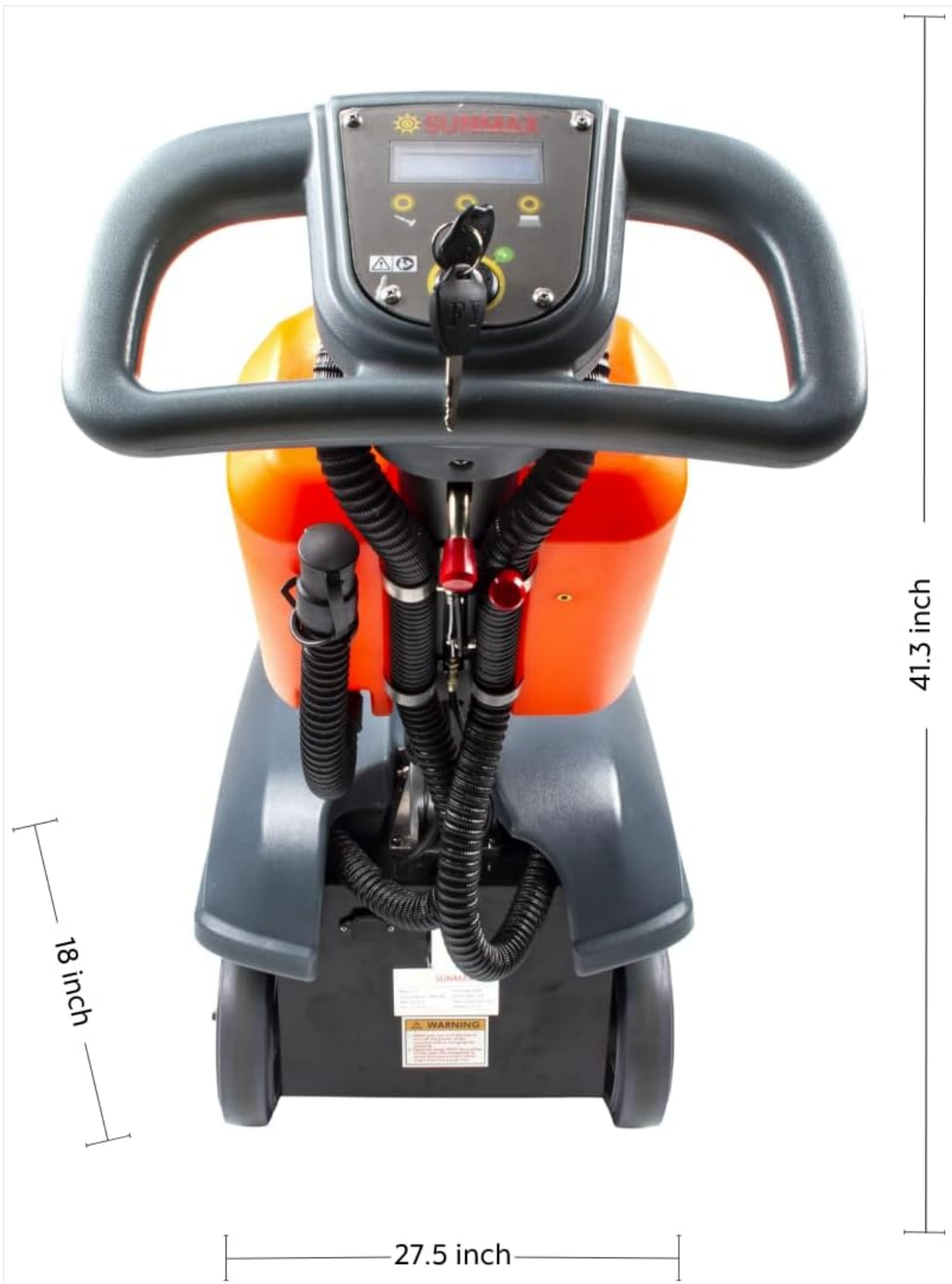
Figure 8.1: RT15+ Dimensions.

This image provides a clear front view of the SUNMAX RT15+ scrubber dryer with its key dimensions indicated. The machine measures 27.5 inches in length, 18 inches in width, and 41.3 inches in height, illustrating its compact design for maneuverability.