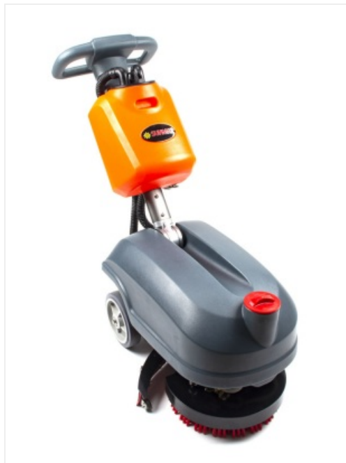
Figure 4.3: Detachable Sewage Tank.

This image shows the detachable orange sewage tank, which has a 4-gallon capacity. This tank collects the dirty water and cleaning solution after scrubbing, and its detachable design facilitates easy emptying and cleaning.