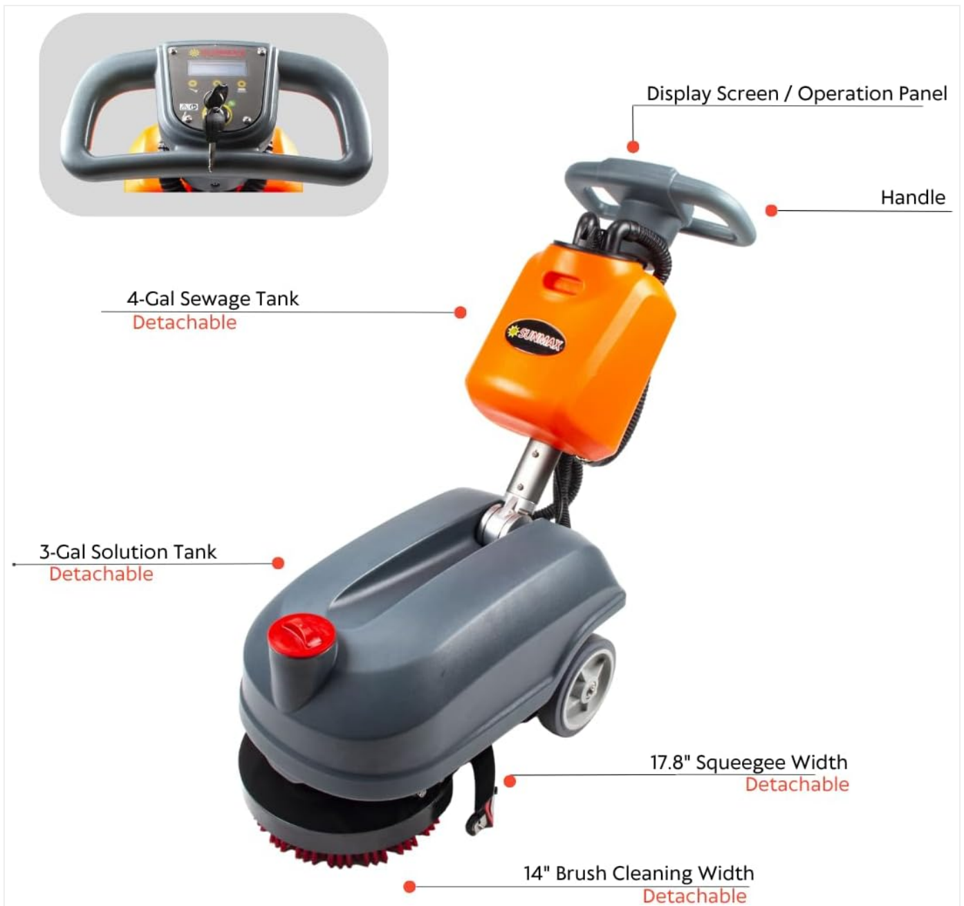
Figure 3.3: Control Panel Detail.

This image shows a detailed view of the machine's control panel, located on the handle. It features a display screen for real-time status updates, a key ignition for power, and buttons to control the brush, vacuum, and water flow functions. This panel allows operators to monitor and adjust the machine's settings during operation.