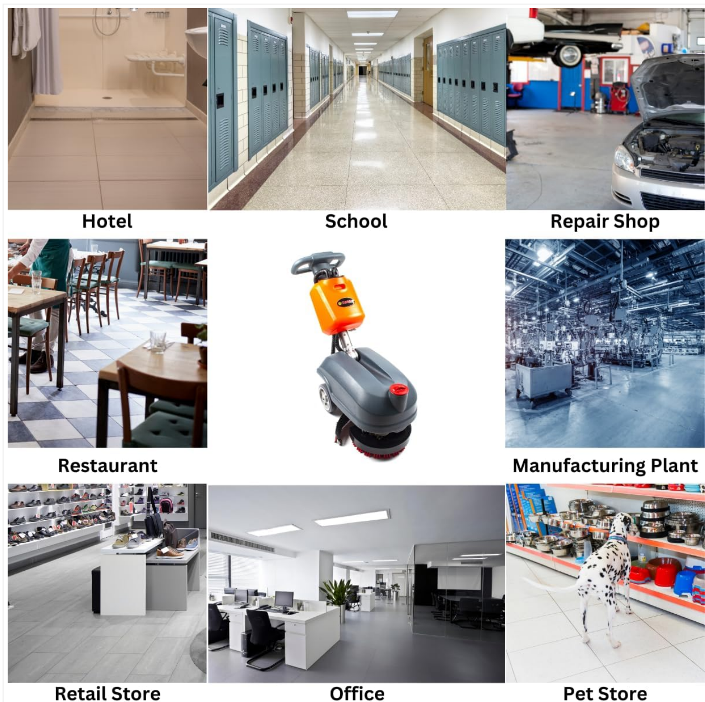
Figure 5.2: Commercial Applications of the RT15+ Scrubber Dryer.

This image demonstrates the broad utility of the RT15+ scrubber dryer across various commercial settings. Examples include hotels, schools, repair shops, restaurants, manufacturing plants, retail stores, offices, and pet stores, highlighting its adaptability for different cleaning needs.