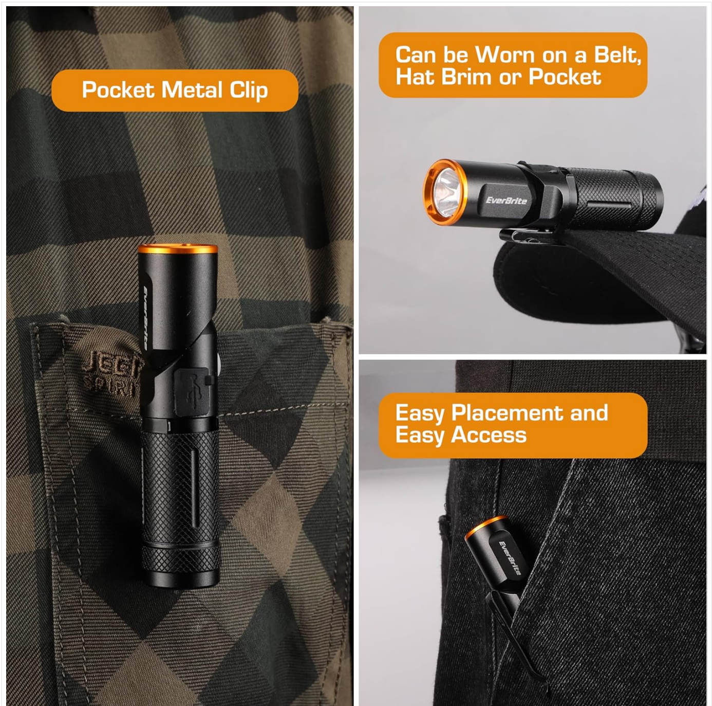
Figure 6.4: Examples of carrying the flashlight using the pocket clip on clothing or a hat brim.