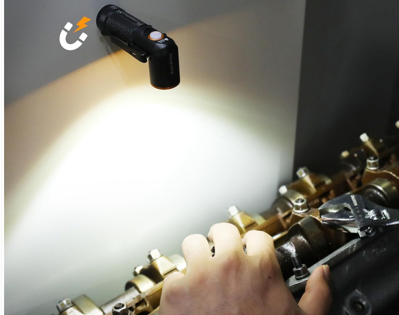
Figure 6.3: Flashlight securely attached to a metal surface using its magnetic base, providing hands-free illumination.

Firmly Adhere to Any Metal Surface Hands Free Convenience