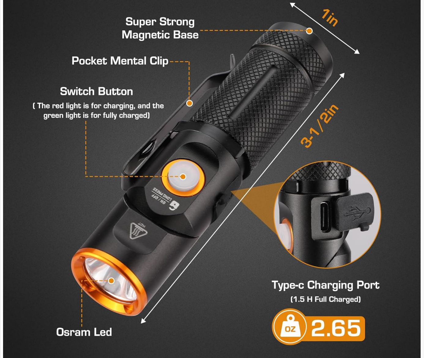
Figure 4.2: Detailed diagram illustrating the key components of the flashlight, including the Osram LED, switch button, pocket metal clip, magnetic base, and Type-C charging port, along with its compact dimensions.