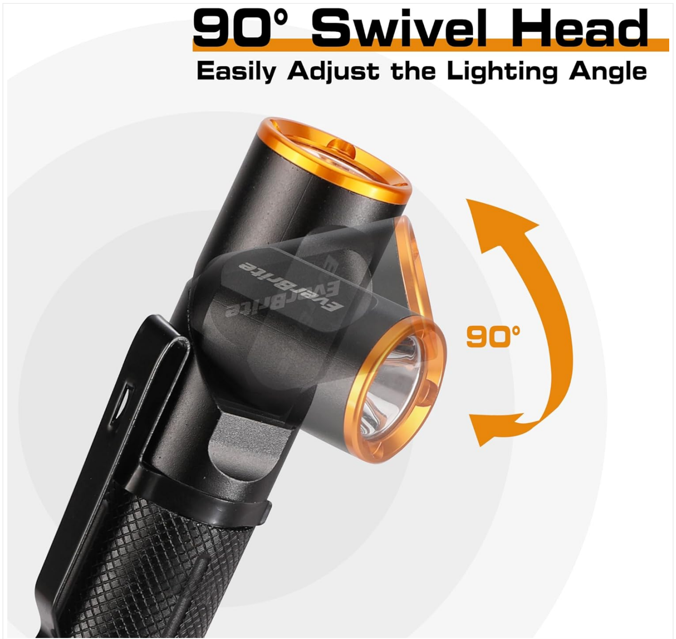
Figure 6.2: The flashlight head rotating 90 degrees to adjust the beam direction.

The flashlight head can be rotated 90 degrees to direct the light precisely where needed. Gently rotate the head to achieve the desired angle. This feature is particularly useful for hands-free operation when combined with the magnetic base or pocket clip.