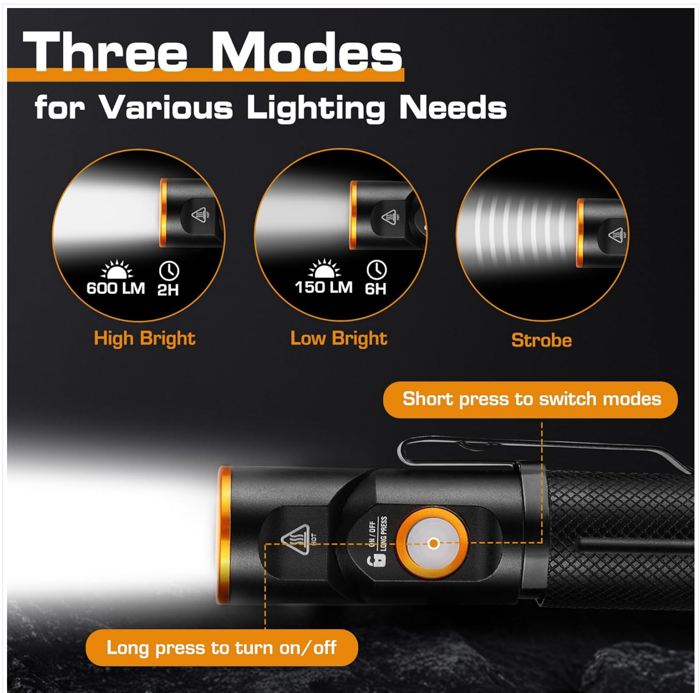
Figure 6.1: Illustration of the flashlight's three lighting modes and the button press sequence for power and mode selection.