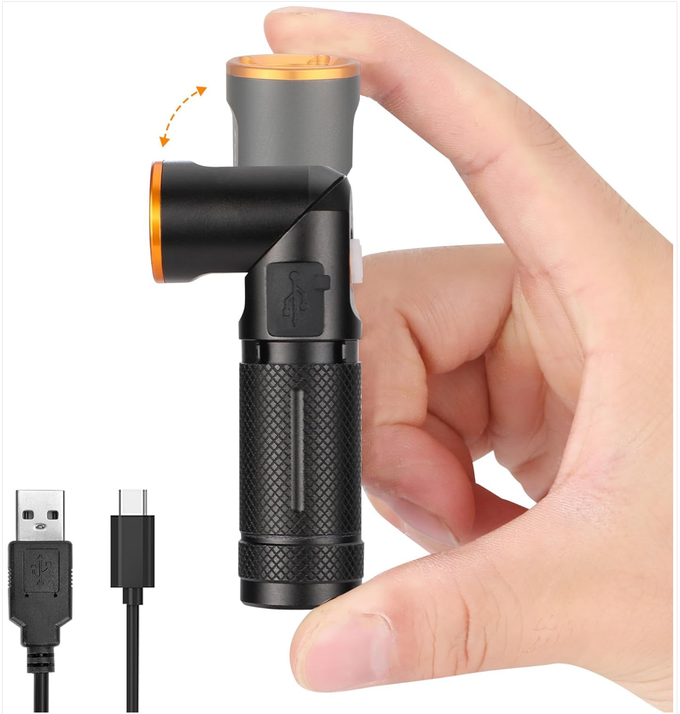
Figure 4.1: EverBrite E011183AE Flashlight with its 90-degree swivel head and Type-C charging port visible, alongside the charging cable.