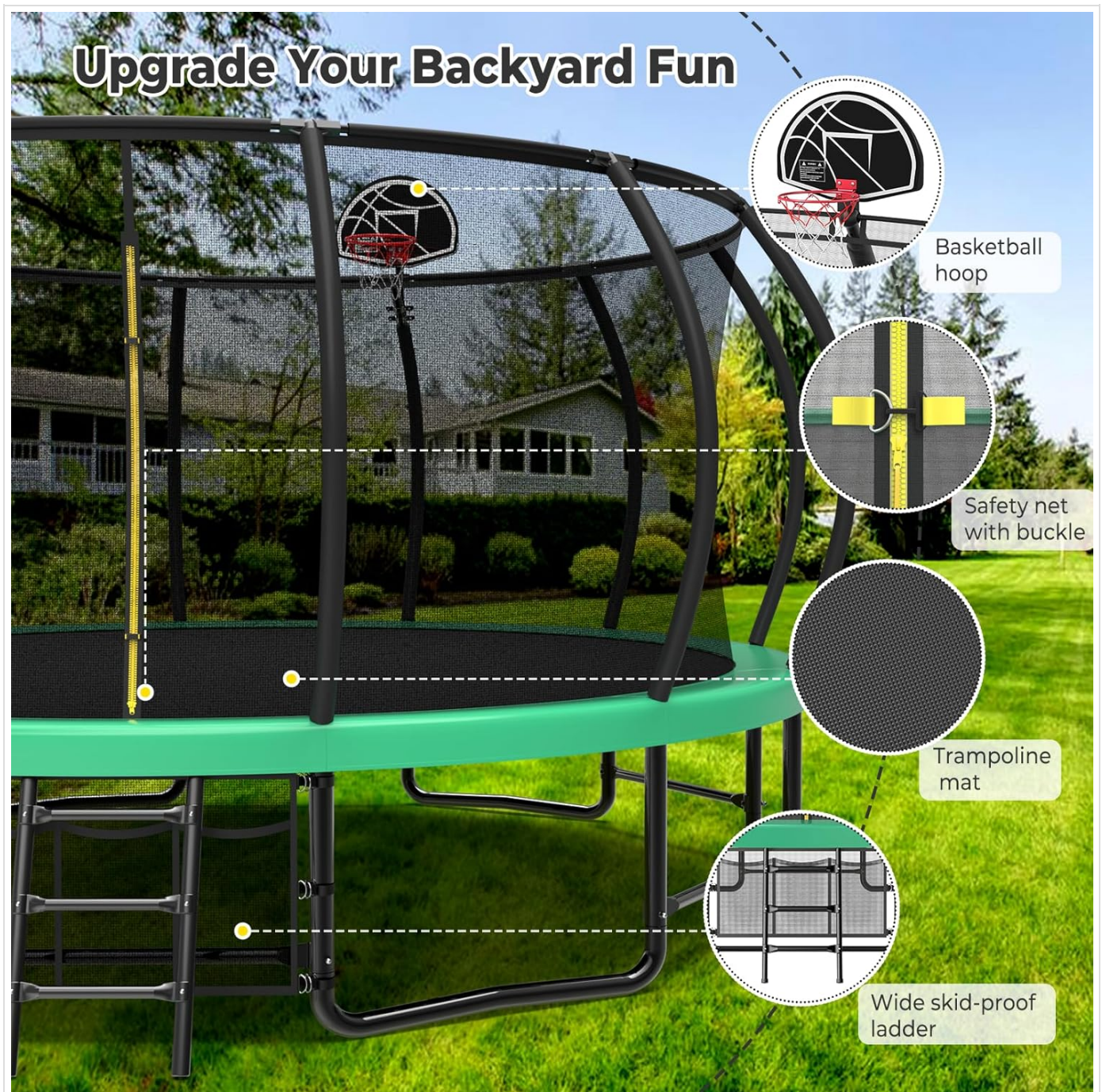
Figure 2.1: Main components of the Lyromix Trampoline.