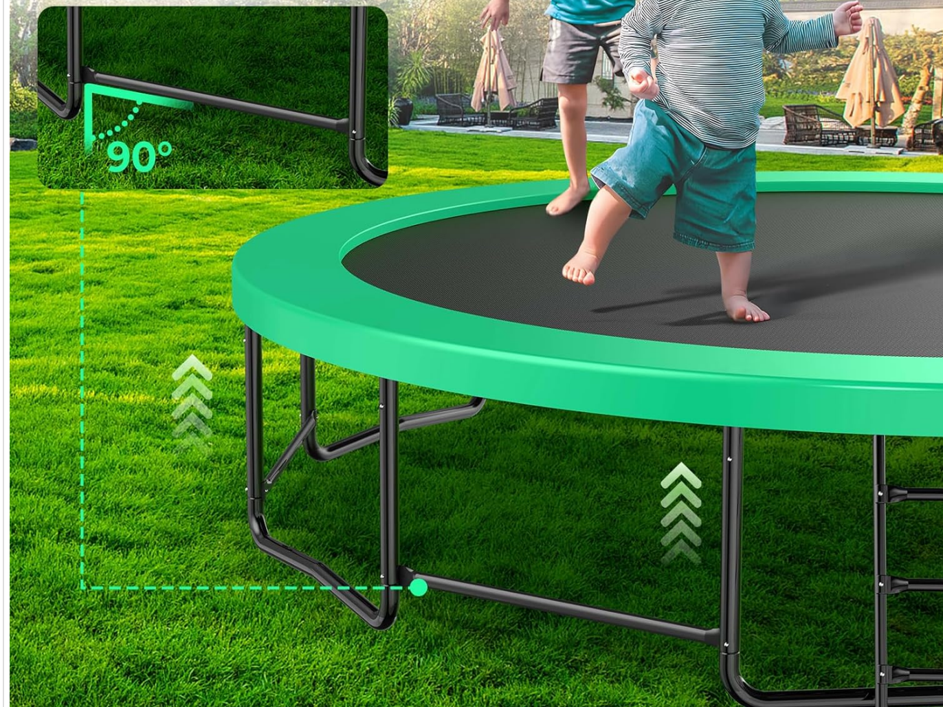
Figure 5.1: Children enjoying the trampoline safely.

Watch your child thrive on our secure balance poles