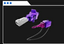
Cybertronian Laser Gun