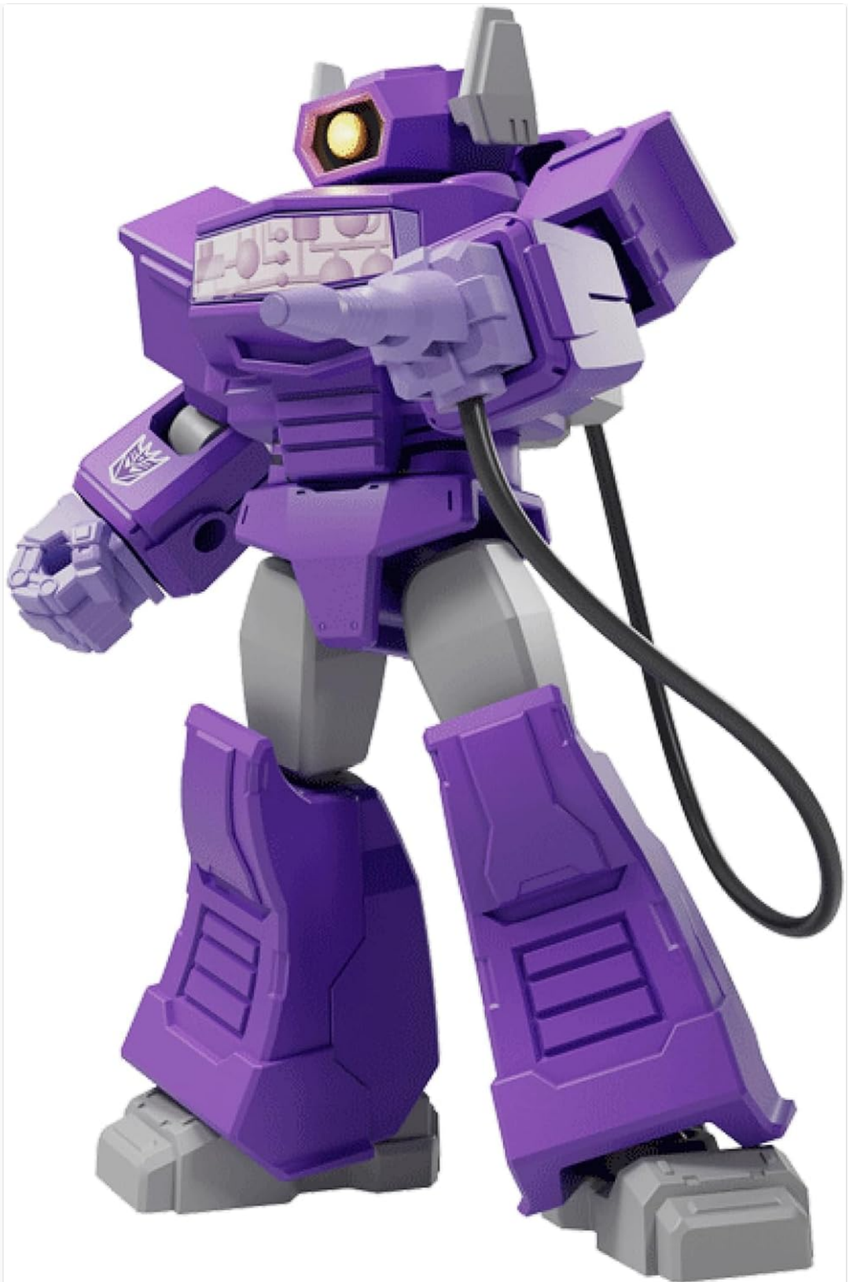
Figure 5: Shockwave figure demonstrating articulation and accessory use.