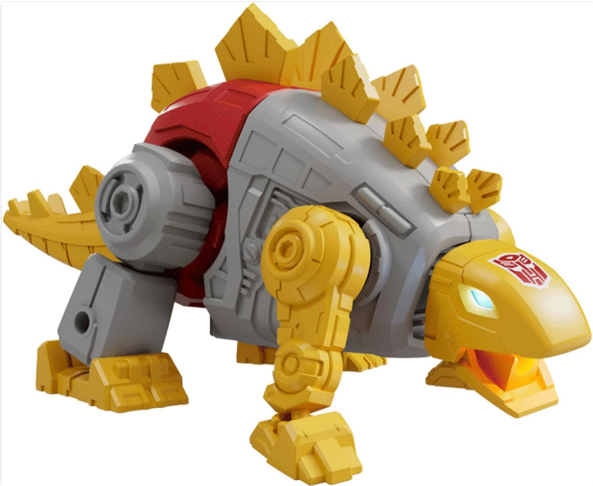
Figure 6: Snarl figure showcasing posability.