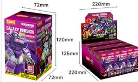
Figure 7: Product dimensions for the blind box and display box.