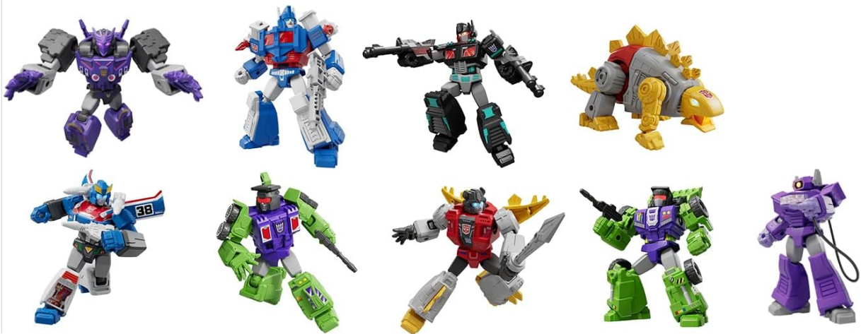
Figure 1: BLOKEES Transformers Galaxy Version 04 Blind Box and Shockwave figure.