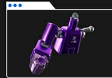
Upper Limb Joints