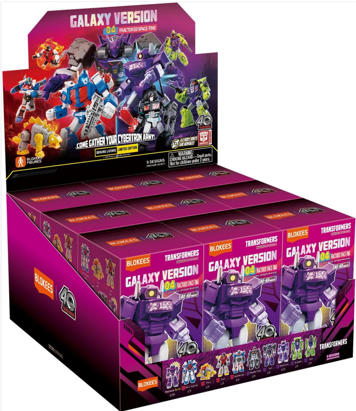
Figure 3: Blind box packaging containing individual figure kits.