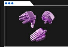
Interchangeable Hand Parts