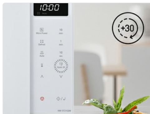
Figure 4.5: The Quick 30 button on the control panel for rapid heating.