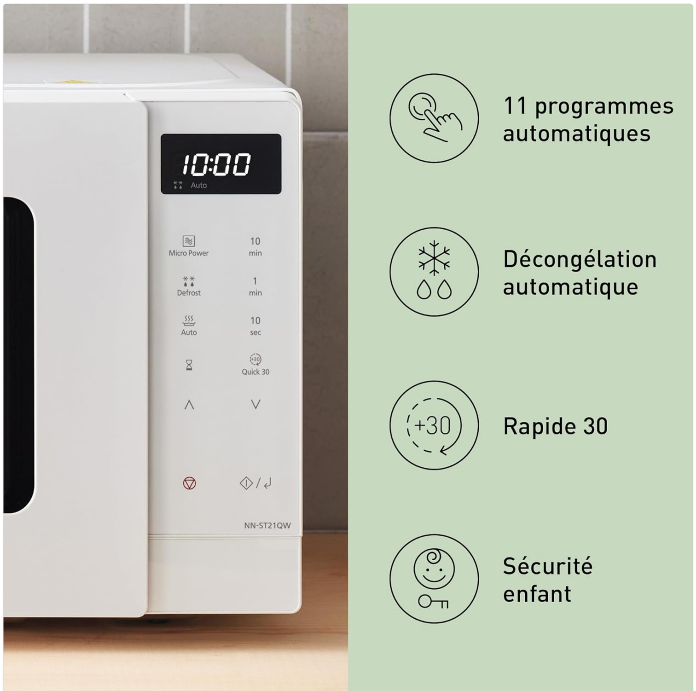
Figure 4.1: The control panel with LED display, showing buttons for Micro Power, Defrost, Auto programs, Quick 30, and time adjustments.