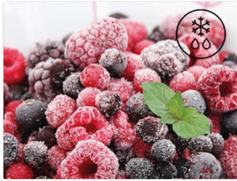
Figure 4.4: Visual representation of the automatic defrost function, suitable for frozen foods like berries.