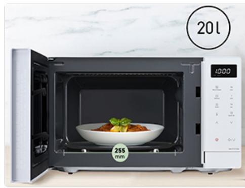
Figure 3.2: Interior view of the microwave, highlighting the 20L capacity and 255mm glass turntable.