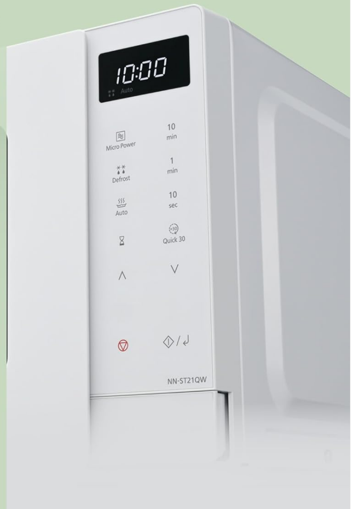
Figure 4.3: The 11 automatic programs offered by the microwave for various food types.