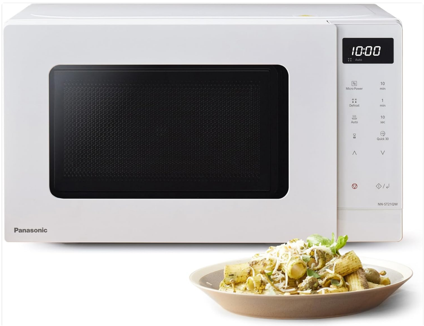
Figure 1.1: Front view of the Panasonic NN-ST21QWEPG Solo Microwave Oven in a kitchen setting, with a dish of pasta in the foreground.