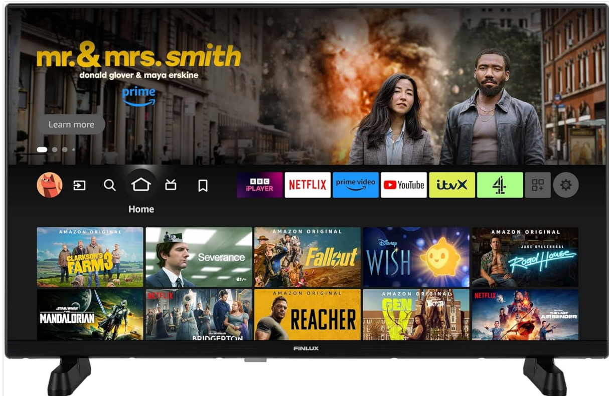
Image: Front view of the Finlux MH24F 32 inch Smart Fire TV with its stand attached, showcasing the Fire TV interface on screen.

Place the TV screen-down on a soft, flat surface to prevent scratches. Align the stand pieces with the corresponding slots on the bottom of the TV and secure them with the provided screws.