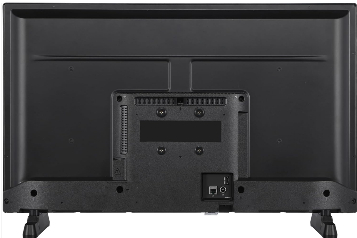
Image: A close-up of the side input ports on the Finlux MH24F television, providing additional HDMI and USB connectivity options.