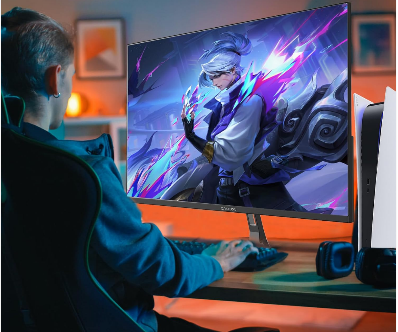
Image: A user engaged in gaming on the GAMEON GOPS27180VA monitor, demonstrating its visual performance and connectivity in a typical setup.

0.5ms Response time with 180HZ resolution, low input lag reduces the delay between the controller input and the action on the screen. Bringing you a brand new gaming experience!