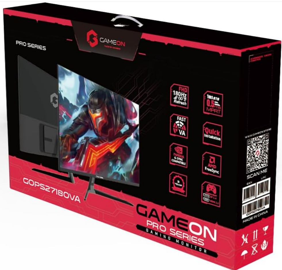
Image: Retail packaging for the GAMEON GOPS27180VA monitor, highlighting key specifications and quick installation features.