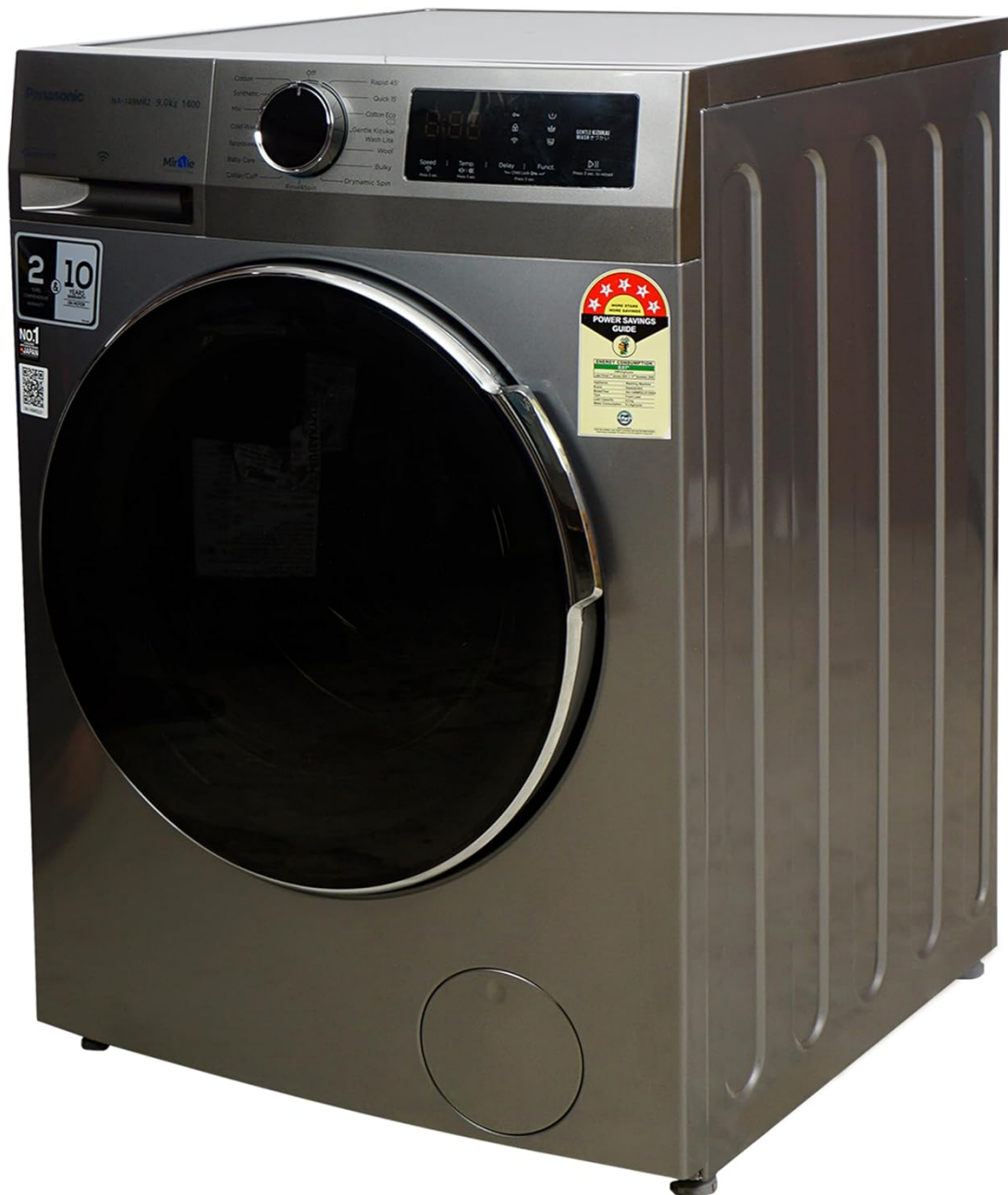
Figure 1.1: Front view of the Panasonic NA-149MR2L01 washing machine with the door closed.