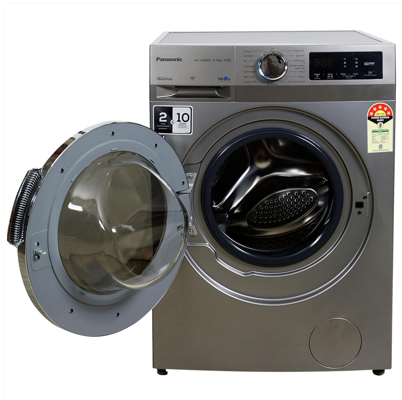
Figure 4.1: Front view of the washing machine with the door open, ready for loading.

Open the door and load items loosely into the drum. Do not overload the machine. For optimal washing, ensure items can move freely.