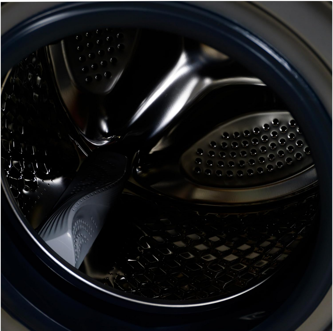
Figure 6.1: Close-up of the stainless steel drum, designed for efficient washing.