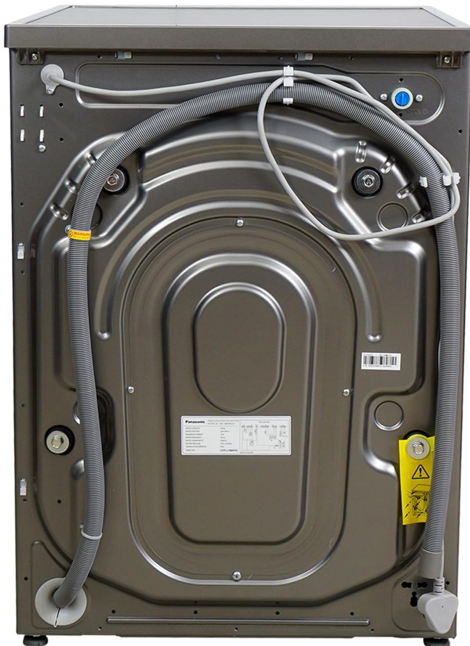
Figure 3.1: Rear view of the washing machine, indicating transit bolt positions and hose connections.

Before operating the machine, all transit bolts must be removed . These bolts secure the drum during transport. Failure to remove them will cause severe vibration and damage to the machine.