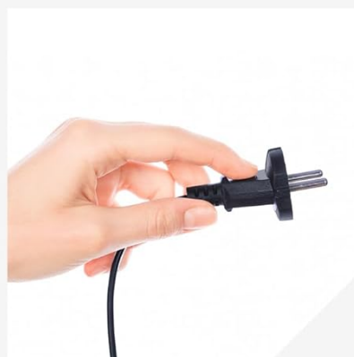
Figure 4: Illustration of the DC and AC power cables for versatile power supply options.