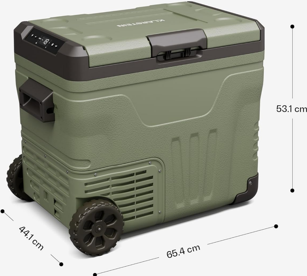
Figure 5: Product dimensions (Length: 65.4 cm, Width: 44.1 cm, Height: 53.1 cm).