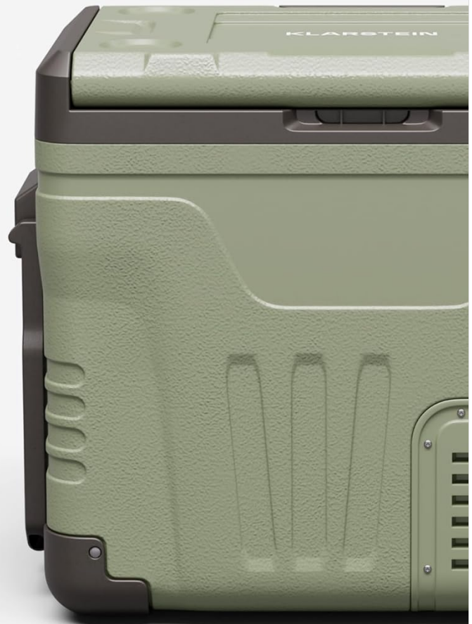
Figure 1: Klarstein PolarForce 50L Portable Refrigerator with key features such as 50L capacity, -20^{\circ}\text{C} to 20^{\circ}\text{C} temperature range, and LCD control panel.