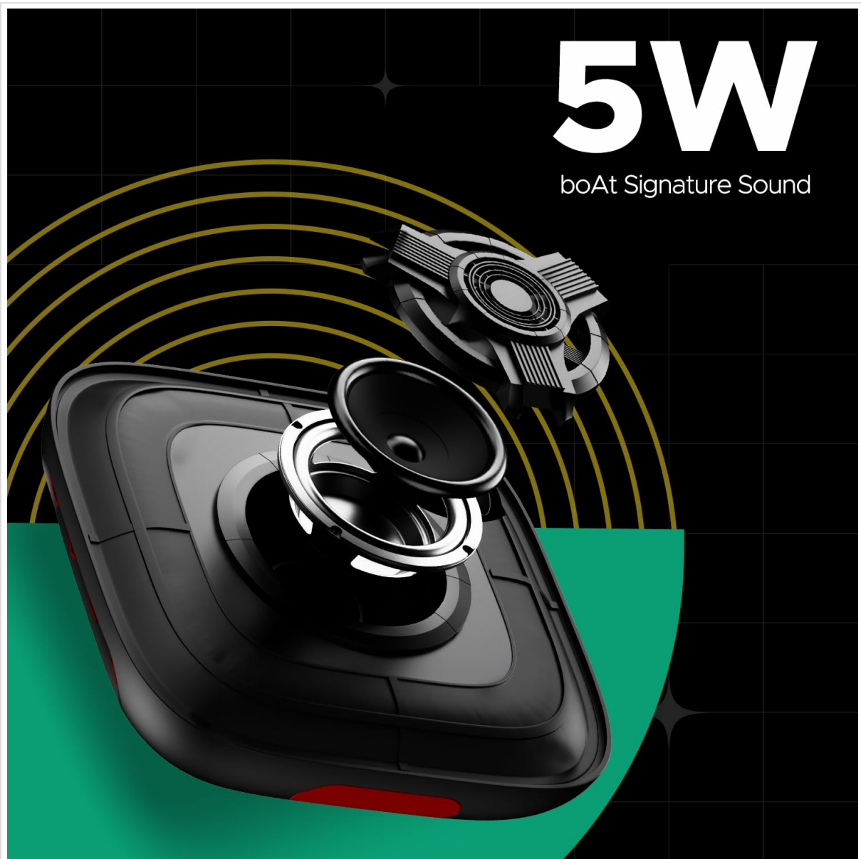
Illustration highlighting the 5W boAt Signature Sound, indicating powerful and clear audio output from the speaker's internal components.