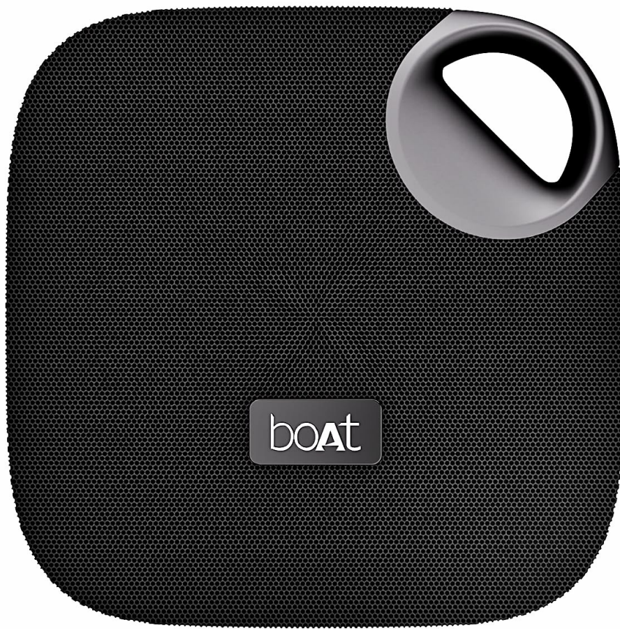
Front view of the boAt Stone 193 Pro / 190 Pro Bluetooth Speaker, showcasing its compact, square design with a textured black grille and the boAt logo.