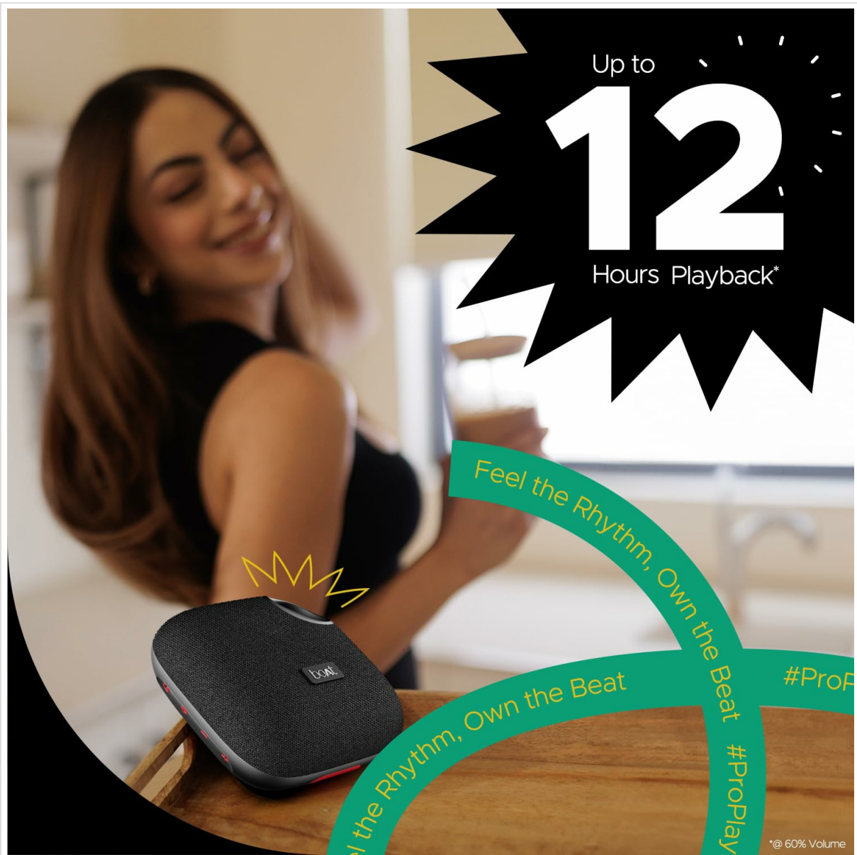
Image depicting the speaker in use with a person enjoying music, emphasizing its long battery life of up to 12 hours of playback.