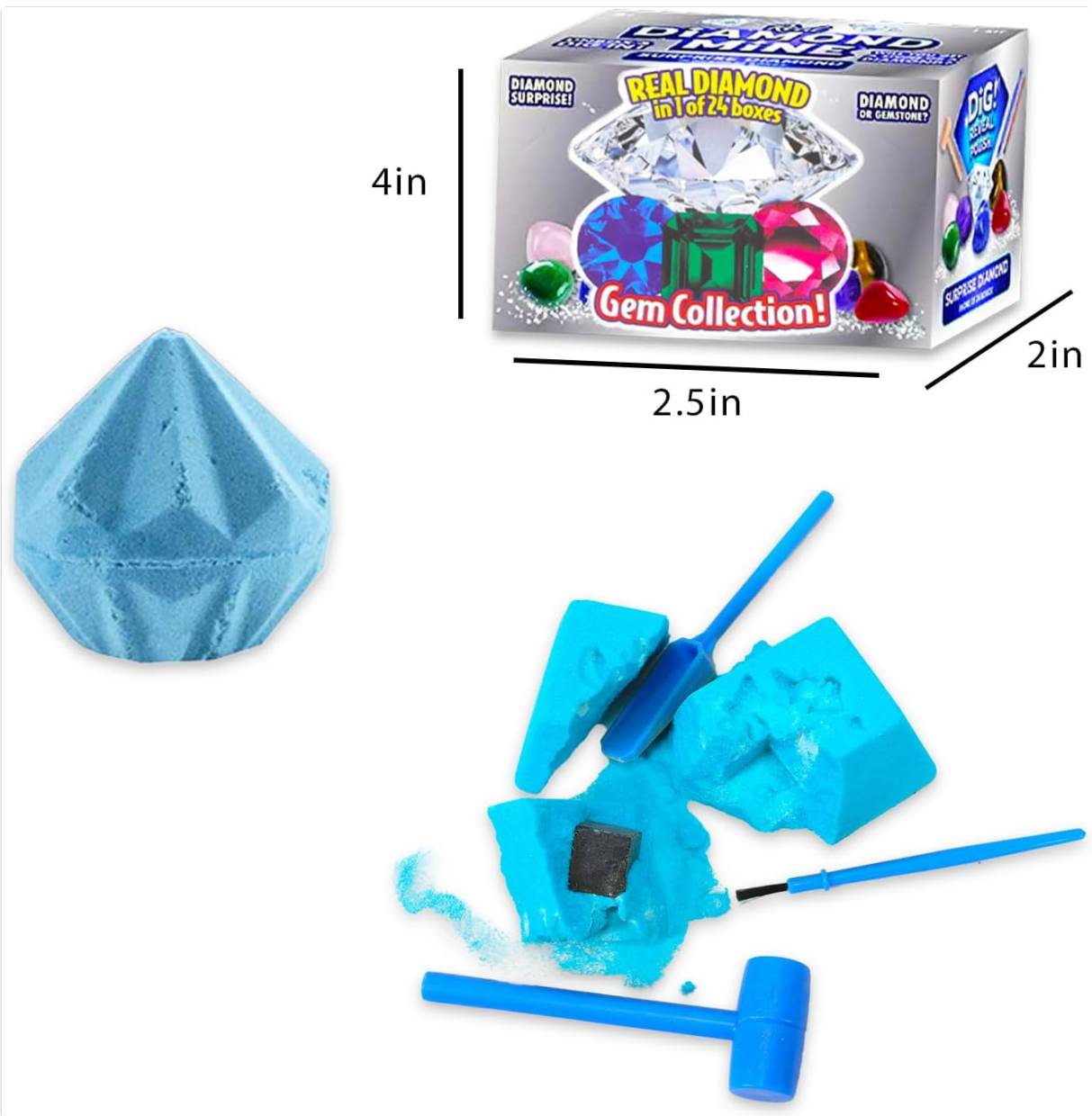
Image: A diamond-shaped digging block with a blue mallet, chisel, and brush, illustrating the components for one diamond excavation. The block measures approximately 2.5 inches wide and 4 inches tall.