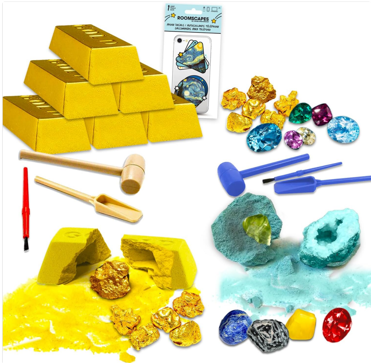
Image: Overview of the complete kit contents, including gold bars, diamond-shaped blocks, digging tools, and various excavated gemstones.