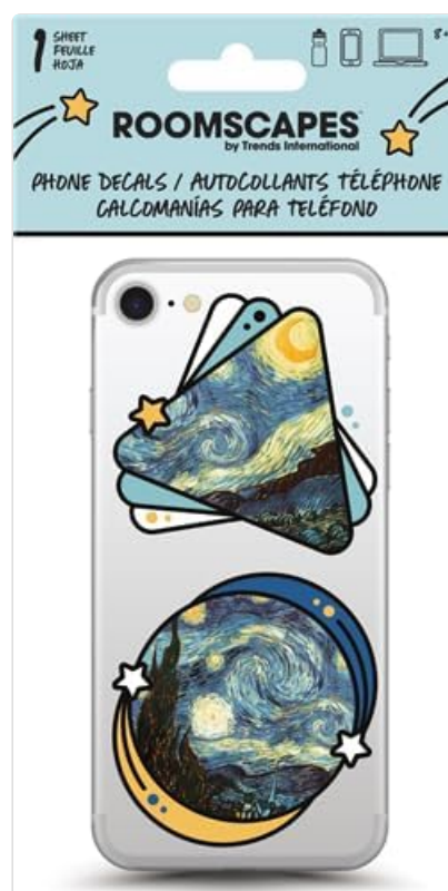
Image: The bonus phone decal featuring a "Starry Night" inspired design, included with the kit.