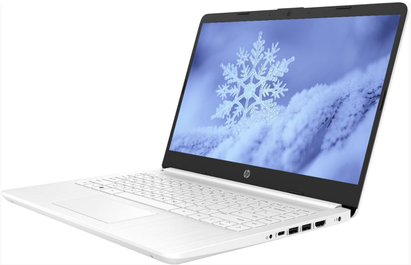
Image: Right side of the HP 14-inch Business Laptop, featuring the HDMI port, two USB-A 3.0 ports, a USB-C 3.0 port, and a headphone/microphone combo jack.